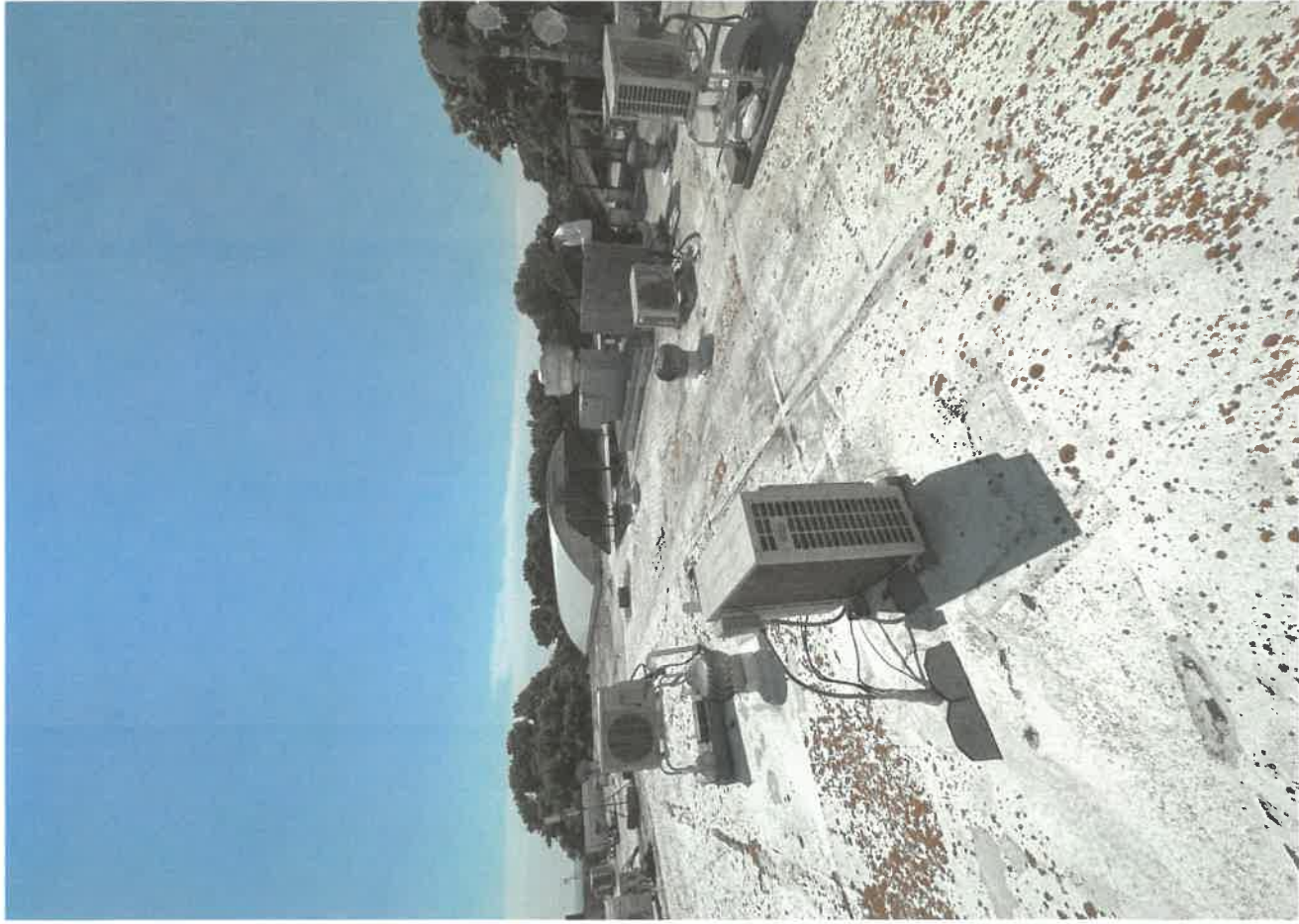
Roof AC units