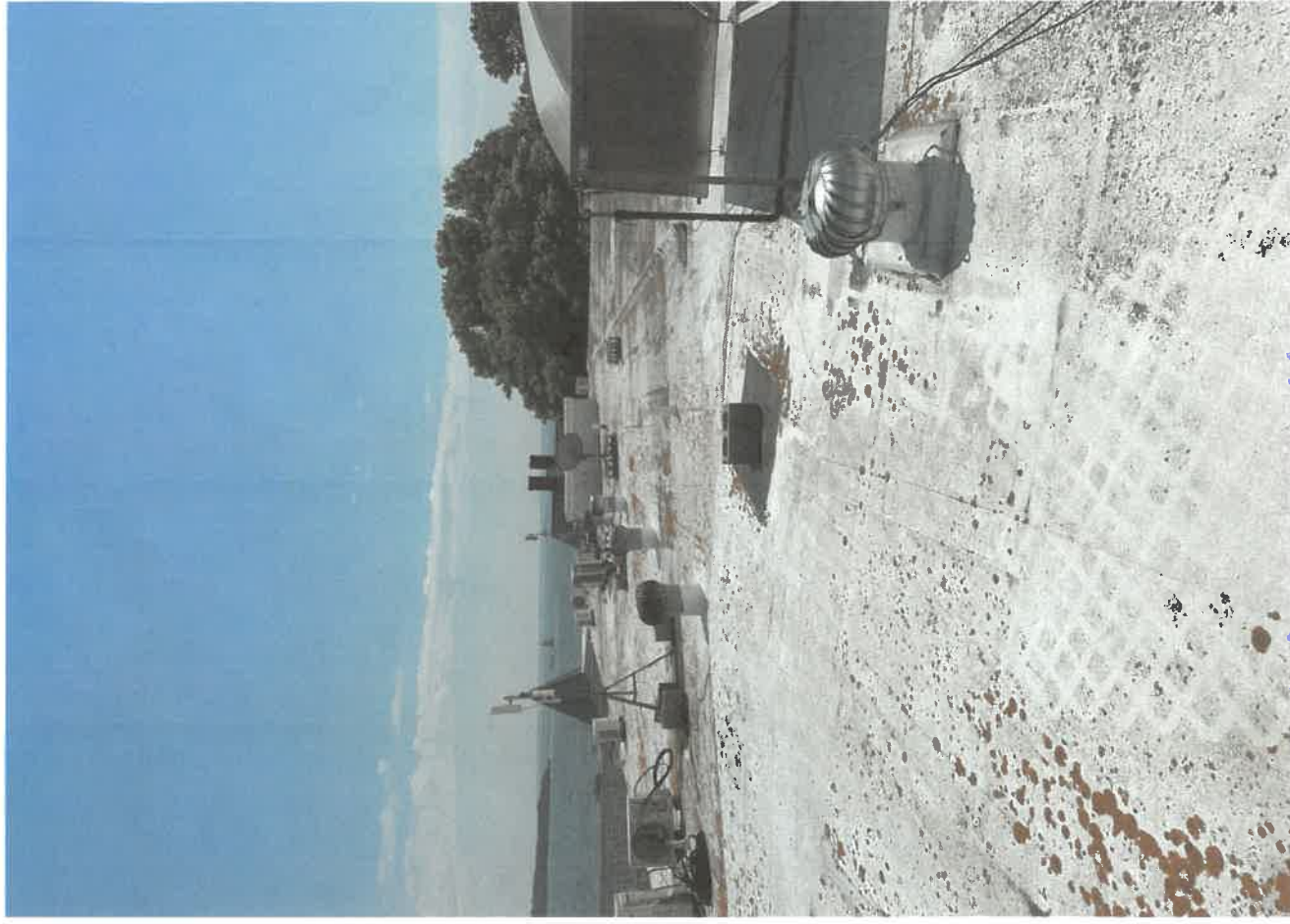
Roof Area Adding AC