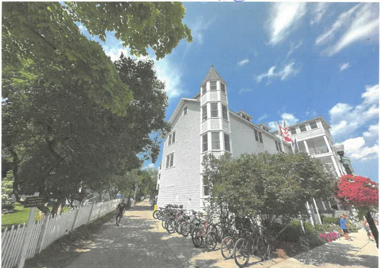
French Lane & Main St.