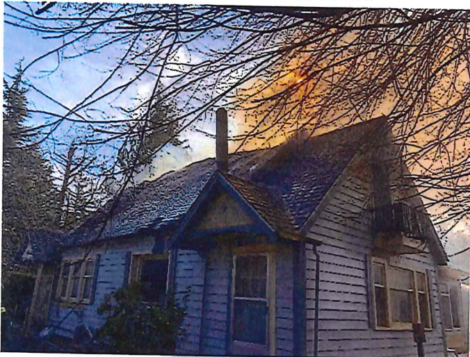
Structure fire 1725 Main St.