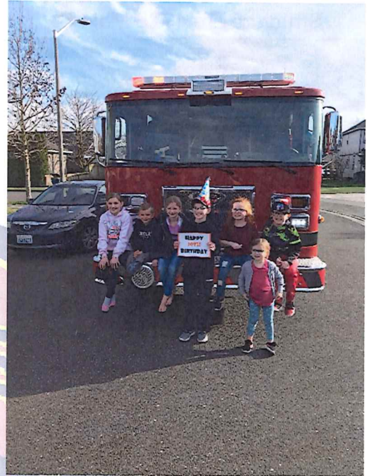
Crew did a surprise birthday drive-by

Overtime Hours: Not finalized Volunteer Hours: Not finalized