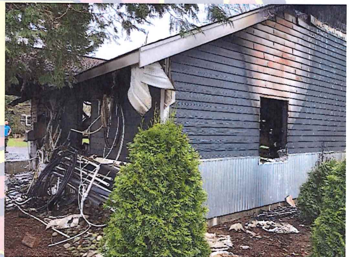
Structure fire 8600 Bender