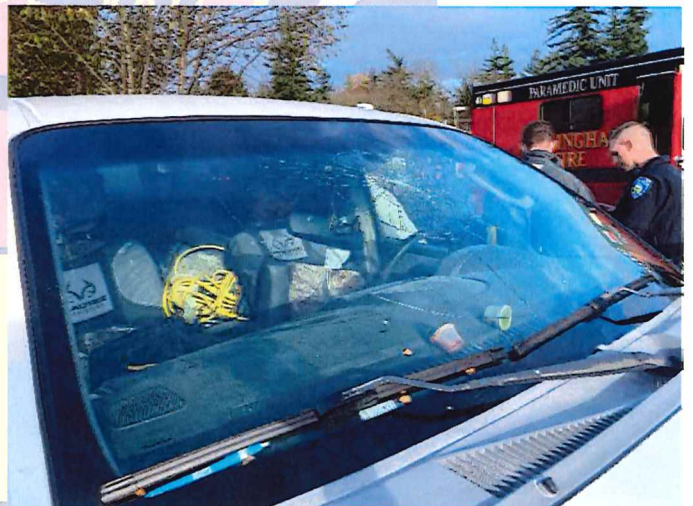
MVA 8247 Guide Meridian