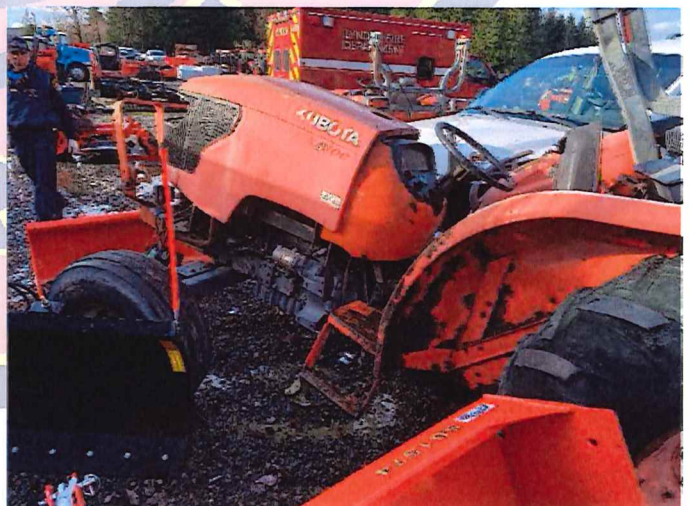
MVA 8247 Guide Meridian