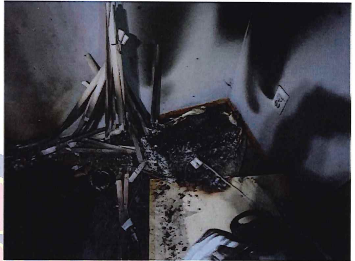
Bedroom fire 1372 Elm St.