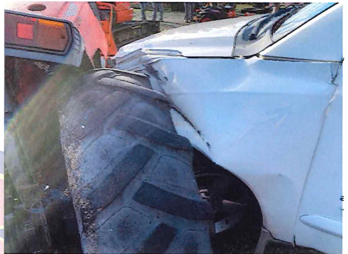
MVA 8247 Guide Meridian