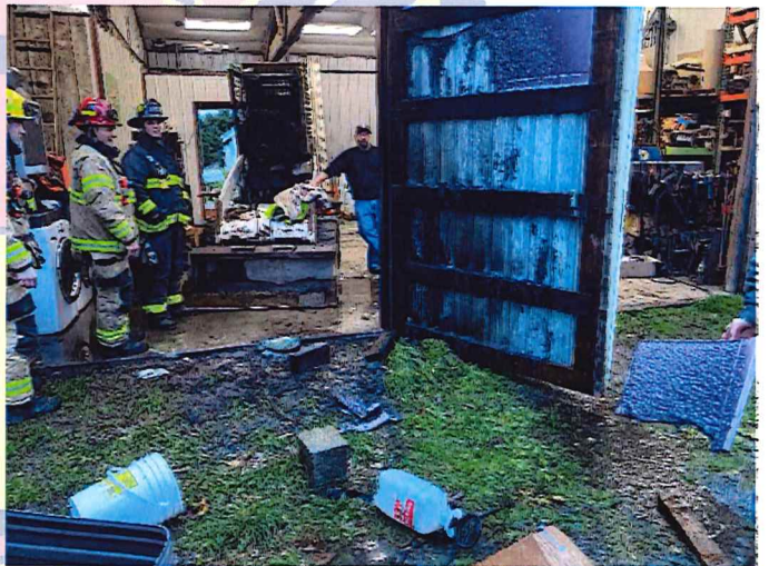
Shop fire 1322 Birch Bay Lynden Rd.