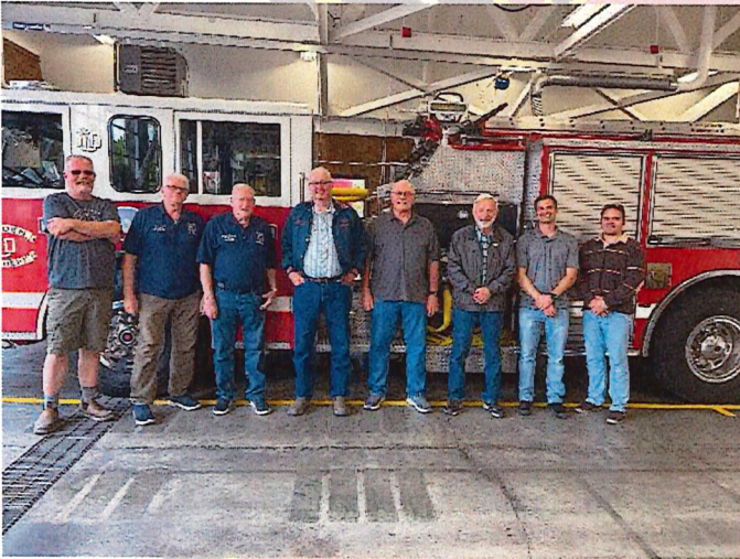
2024 Retiree Spring Dinner