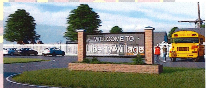
Liberty Village PowerPoint Presentation