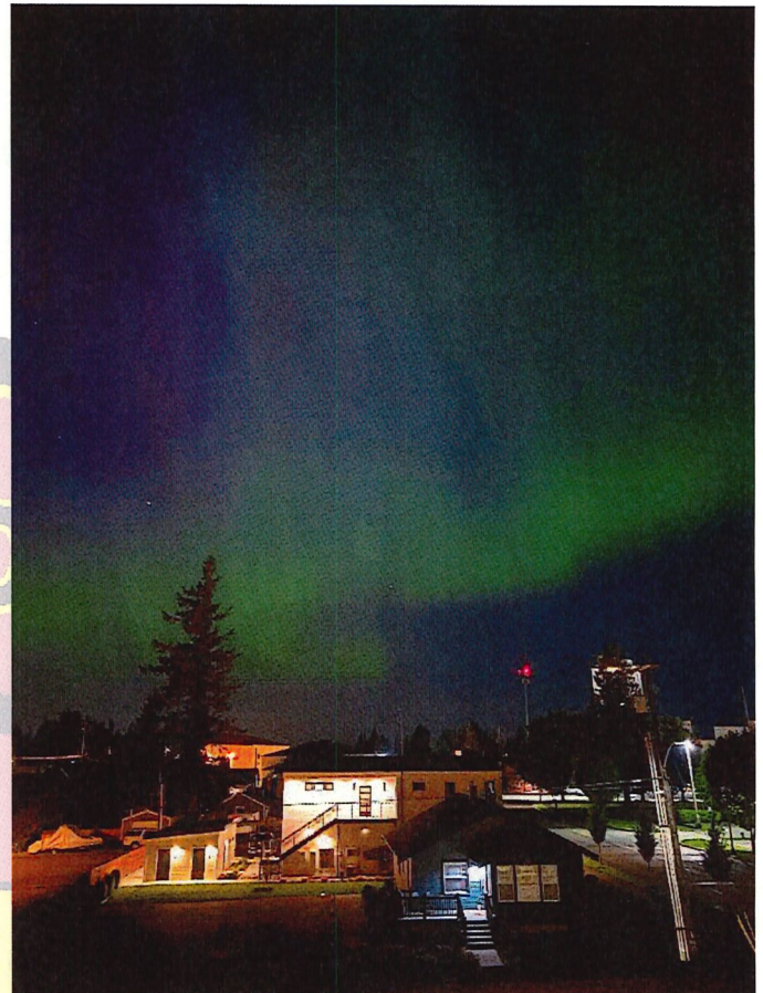
Northern lights display

Average at Hospital Time = 24:31 (26:30)