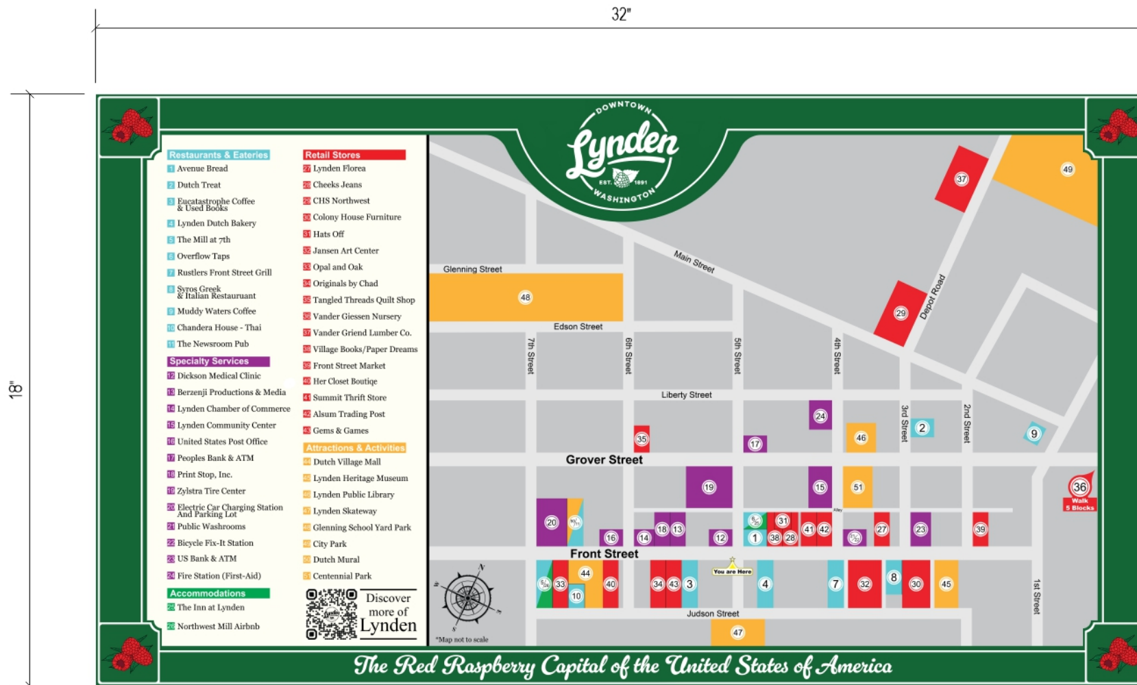
FRONT VIEW SCALE: 3" = 1'-0"