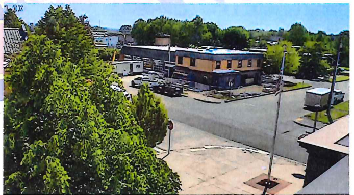
Fire station progress – metal siding and roof