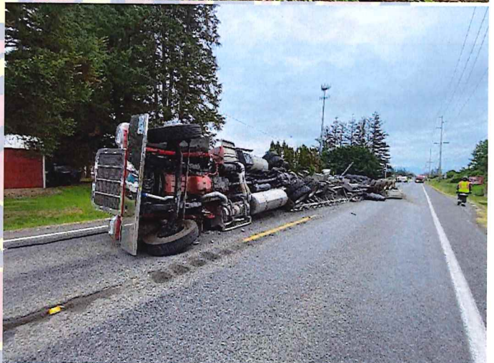
Rollover East Badger Rd.