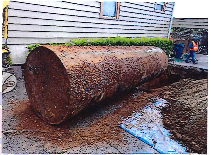
Large fuel tank removed from home on Grover