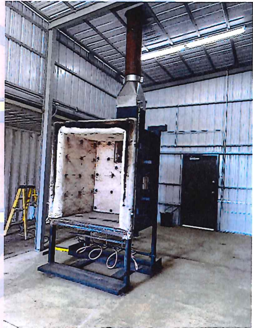
Fire rating testing unit at Lynden Door