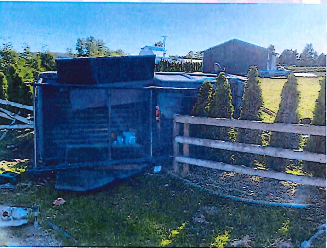
MVA Hannegan Rd.