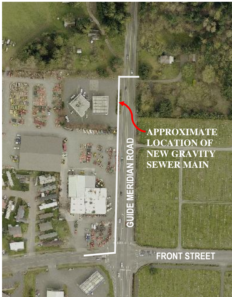
FIGURE 1 AERIAL OF PROJECT