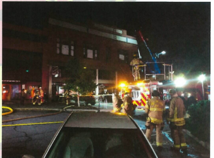
B-76 covered downtown Bellingham fire