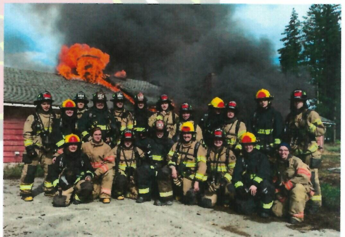
2020 ESFA Recruits