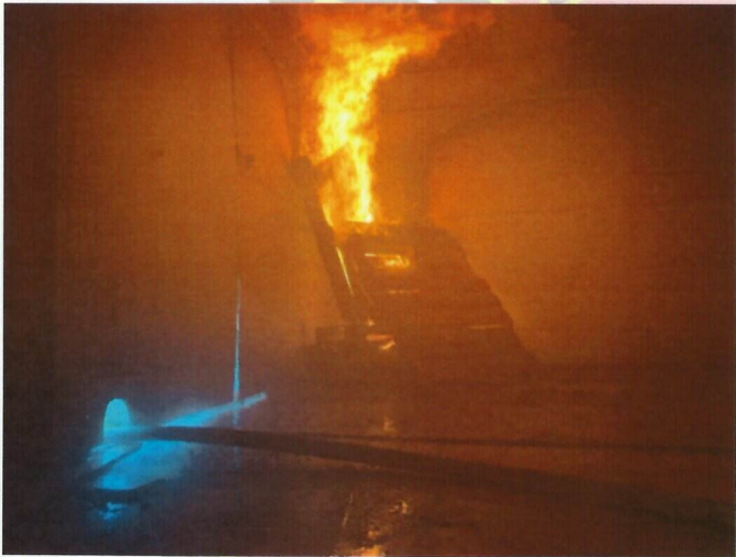
Lighting it up