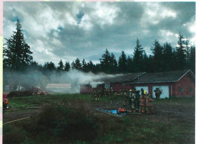
Live Fire Training

Overtime Hours: 322 Volunteer Hours: 340.5