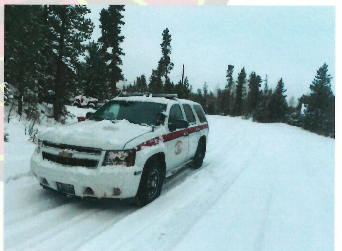
Something you don't normally have to deal with on a wildland fire