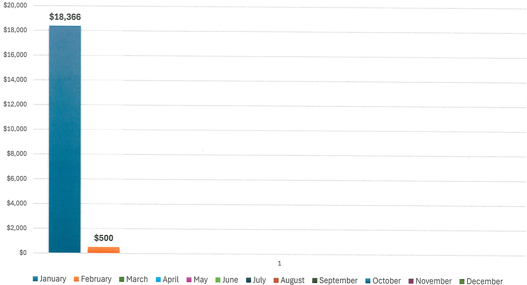
Fraud money lost 2025 - $18,866