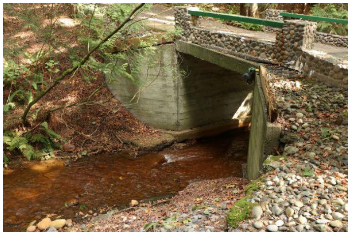
Box culvert bridge on the existing driveway over Pepin

Maintain the ability of the stream to maintain its natural hydrogeomorphic course. Projects that would allow the channel to naturally migrate are limited due to this being a constrained urban stream, but the channel migration zone that does exist should be restored to native forest wherever possible. There are no plans to remove the hardened streambank downstream of the bridge.