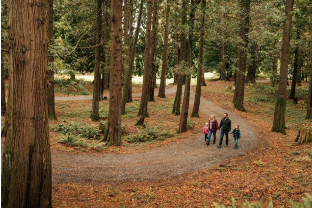
Residents walking through the cedar grove just to the south of the Conservation Area