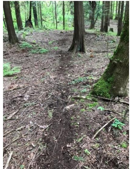
Game trail crossing the upland area

Finally, the impact to the forest by deer herbivory will need to be addressed if long-term regeneration is to continue.