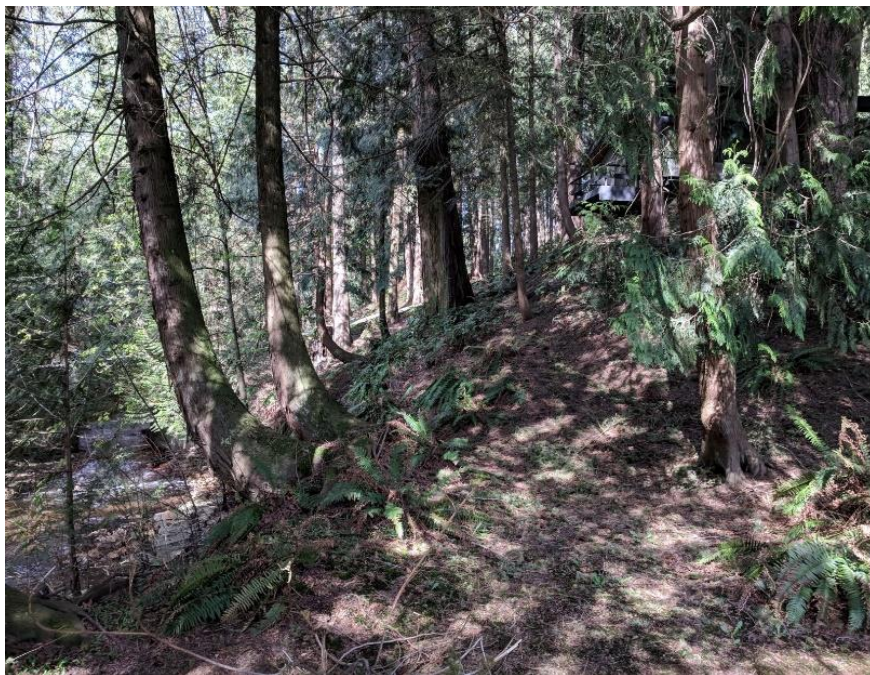
Well-vegetated riparian slope above Pepin Creek

Maintain the status of the well-vegetated Pepin Creek riparian zone. Aggressive control of invasive plant species, including clearing, hand pulling, and targeted herbicide treatments should occur as they are located.