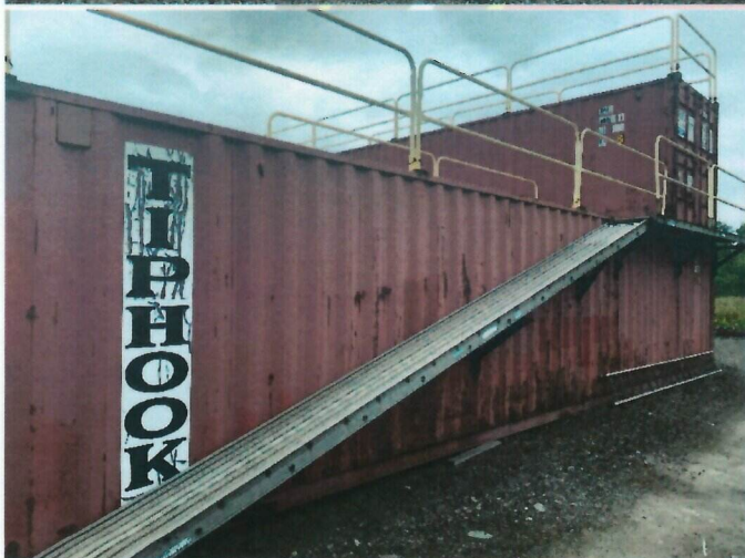
Alcoa to donate their fire training Conex boxes