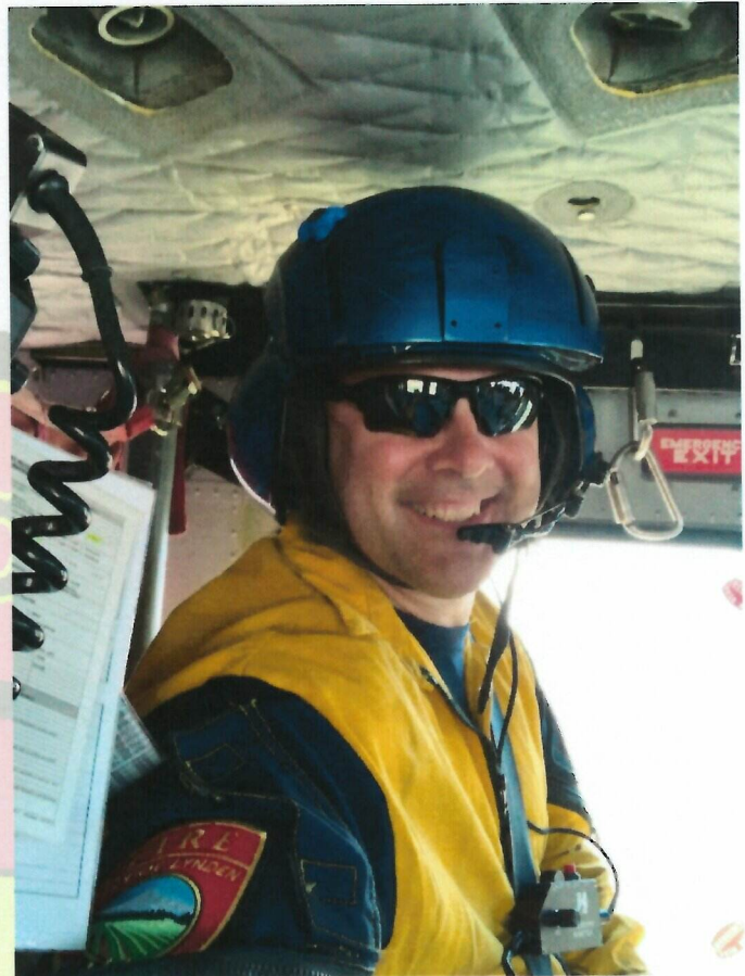
AC Hatley out on deployment at the Saddle Mt. fire – permagrin