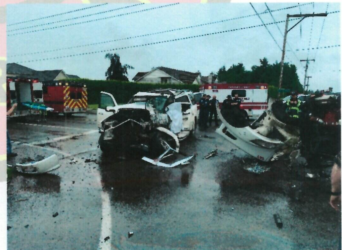
Fatal crash on Badger 7/2/20