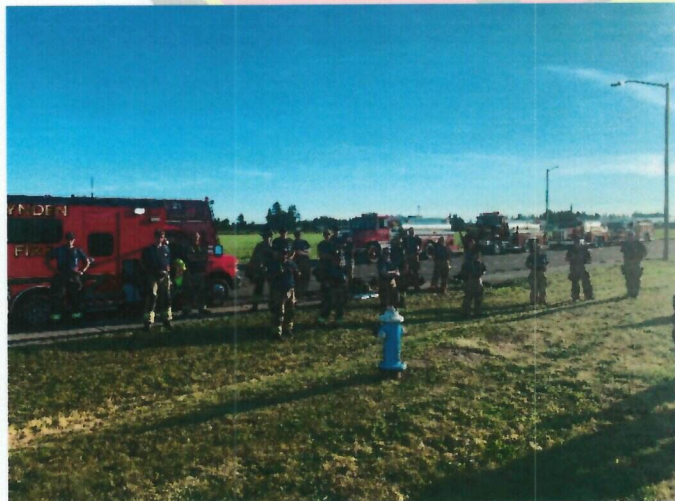
Joint water tender ops training with Dist-1 and NWFR – great turnout