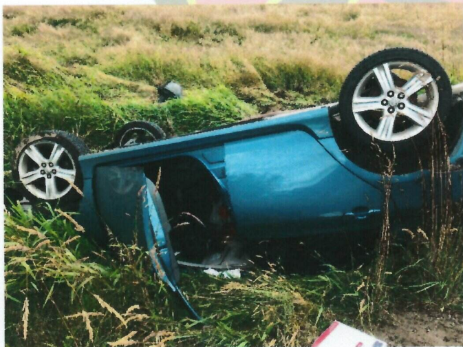
MVA Birch Bay – Lynden Rd.