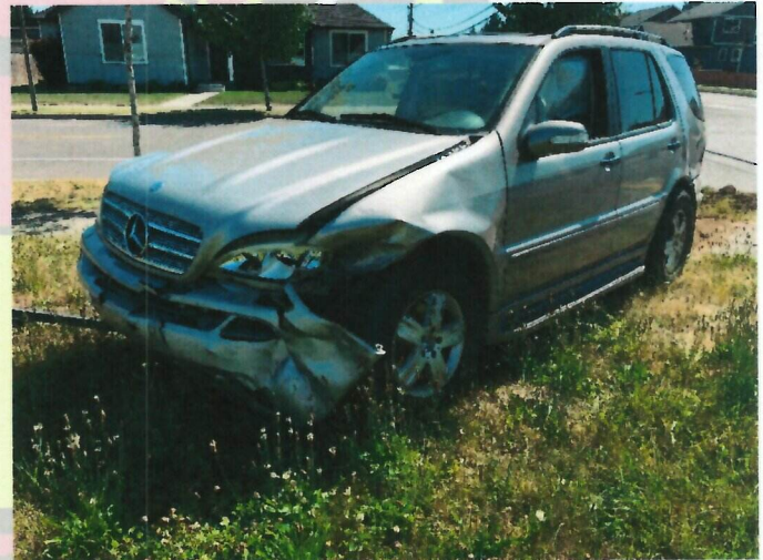
MVA Aaron Dr.