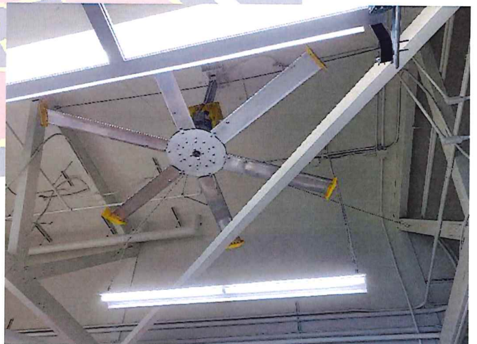
Exercise room overhead fan