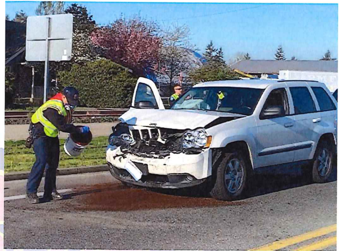
MVA on Badger