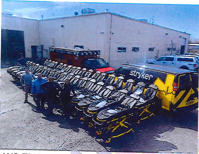
WC EMS taking deliver of new Stryker Power Cots