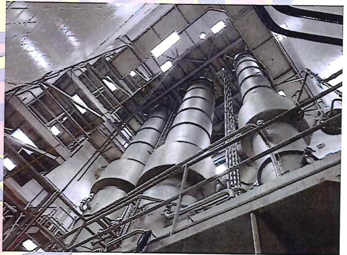
Darigold new addition final inspection