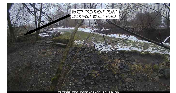
SCoured LEVEE BACKSLOPE AFTER FLOOD - FEB 2020