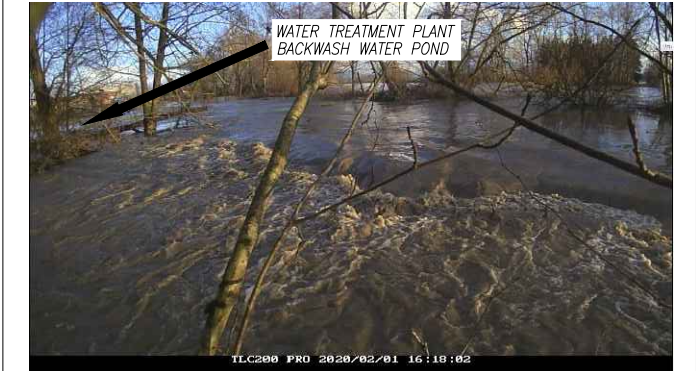
LEVEE OVERTOPPING DURING FLOOD - FEB 2020