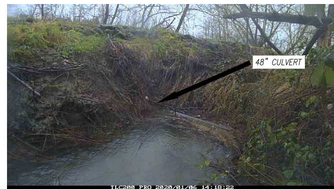
CULVERT PARTIALLY PLUGGED WITH SEDIMENT - JAN 2020