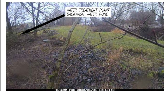
SCoured LEVEE BACKSLOPE BEFORE FLOOD - FEB 2020

LEVEE BACKSLOPE PERIODICALLY DAMAGED BY OVERTOPPING DURING FLOODS