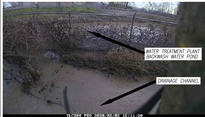
BANK EROSION AFTER FLOOD - FEB 2020