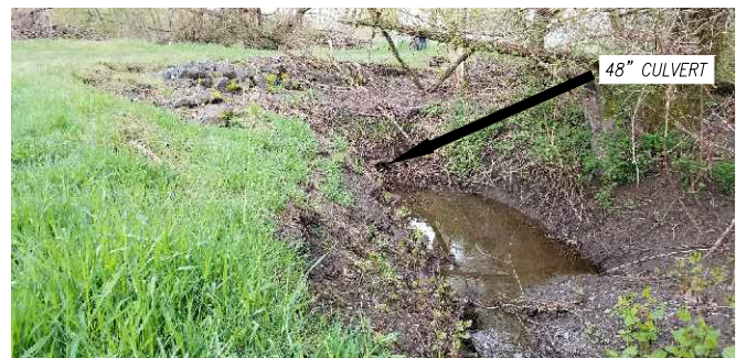
CULVERT PARTIALLY PLUGGED WITH SEDIMENT - APRIL 2019

CULVERT PERIODICALLY PLUGGED BY SEDIMENT AND DEBRIS