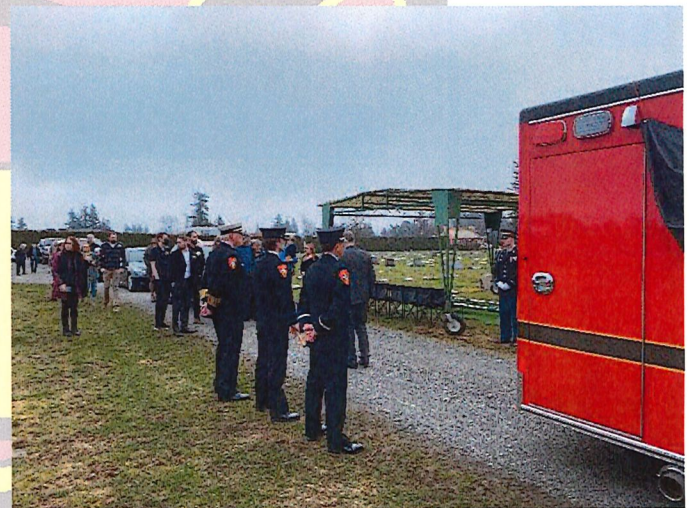
Jim Top graveside presentation