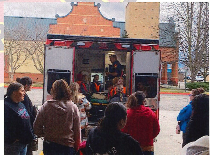
Isom Elementary station visit