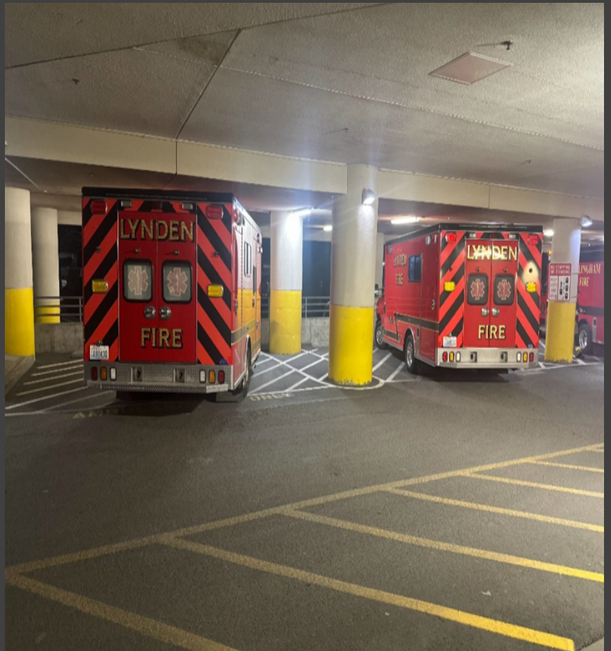
A75 & A7502 at St Joes on transports