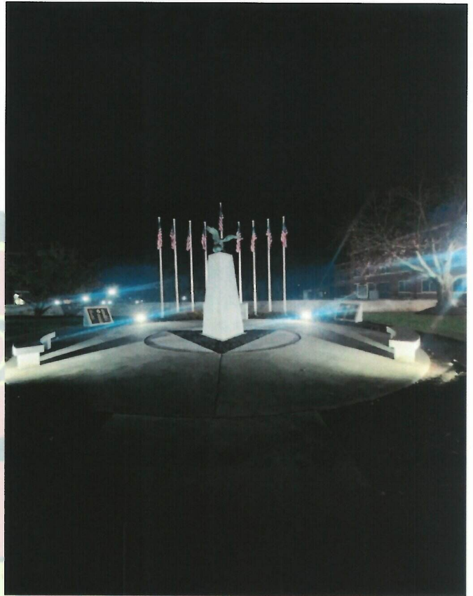
Fallen FF Memorial at NFA

Overtime = 344 (205.5) Part-time = 395 (264) Volunteer = 29 (42)