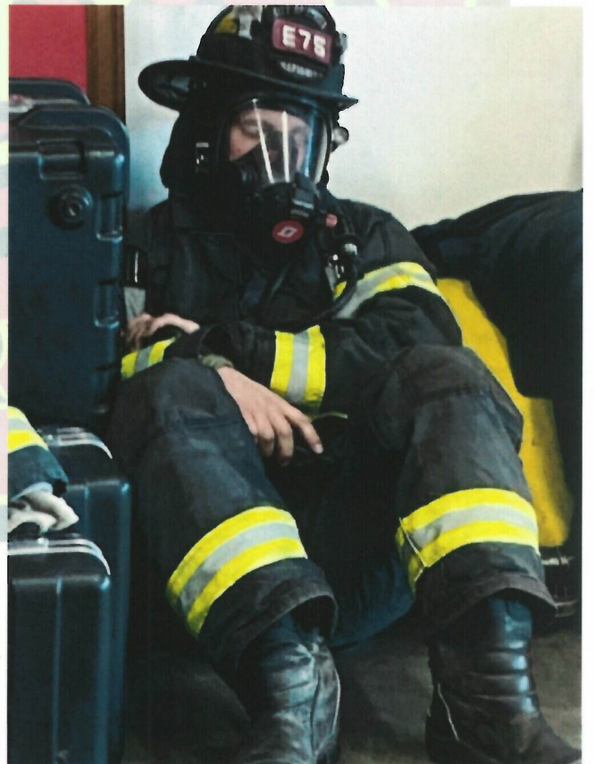
Air management drill