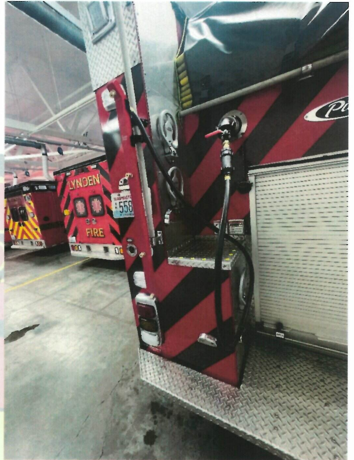
New Storm Stick decon tool