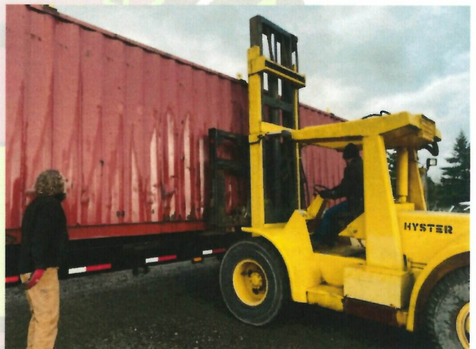
Oxbow helped with the unloading