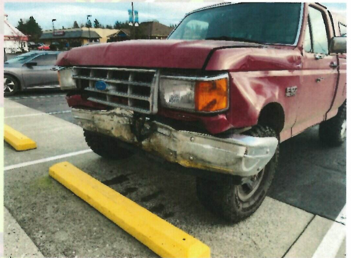
MVA Kok Rd.