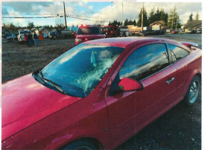
Auto vs Ped 19 th & Front