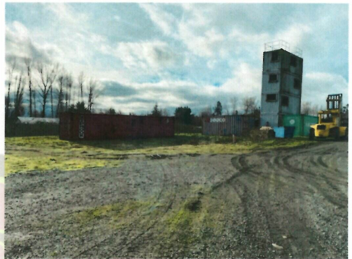
Connex boxes donated by Alcoa