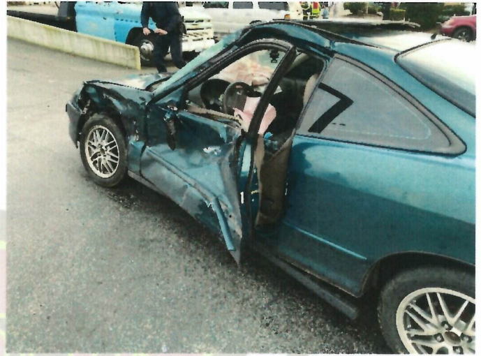
MVA Kok Rd.