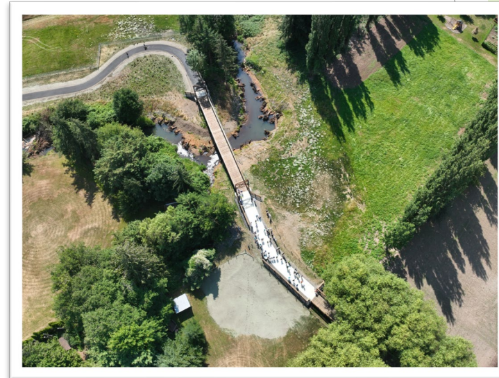
Jim Kaemingk Trail Completion