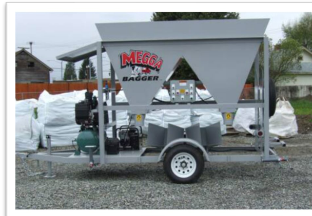
Sand Bag Filler