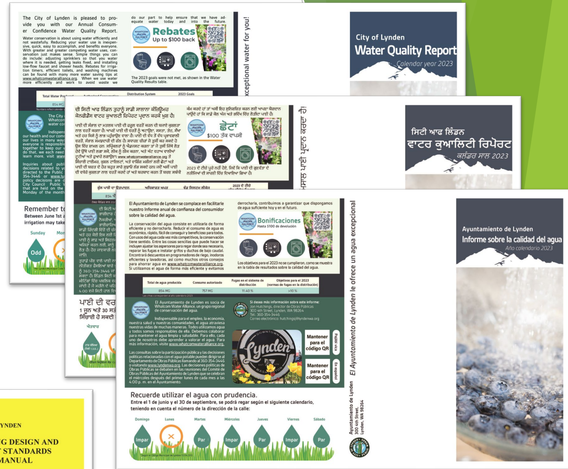
Water Quality Reports