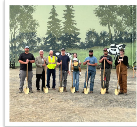
Maintenance Shop Groundbreaking