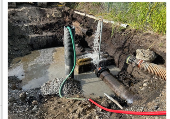
Old RIS Line Cap