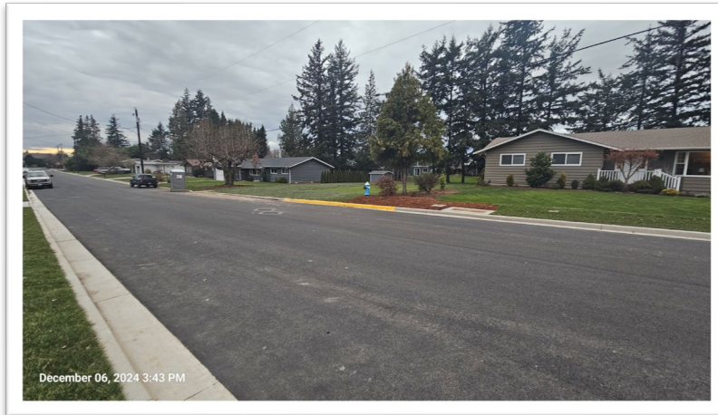
Cedar Driver Overlay