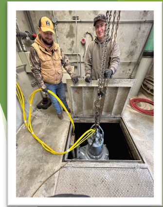
New Influent Pump at WWTP Headworks