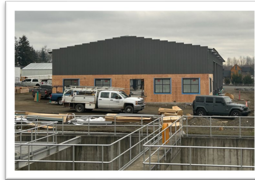
Maintenance Shop Progress