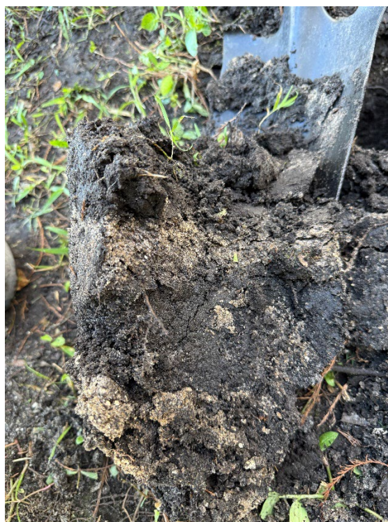
More natural looking soil profile near adjacent property cypress trees