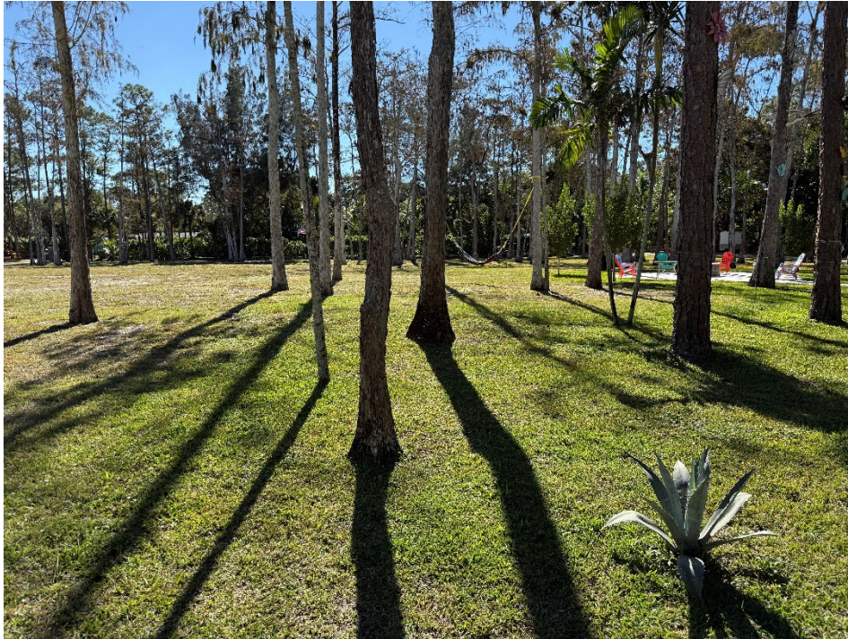
South view across property that demonstrates apparent fill around naturally existing trees