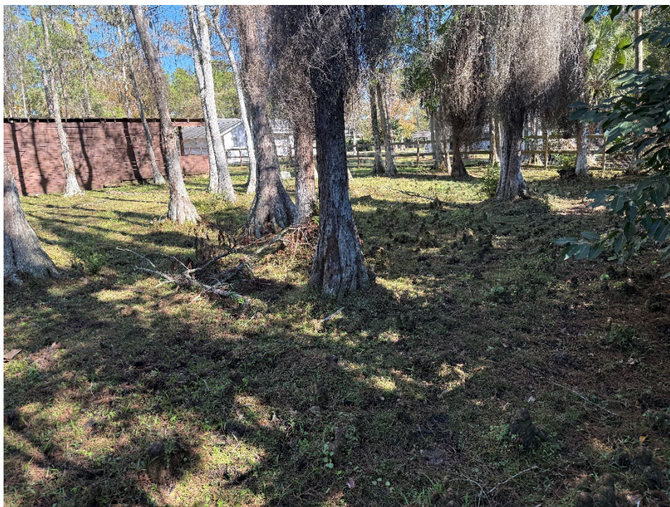
Cypress trees in the southwest corner of adjacent property