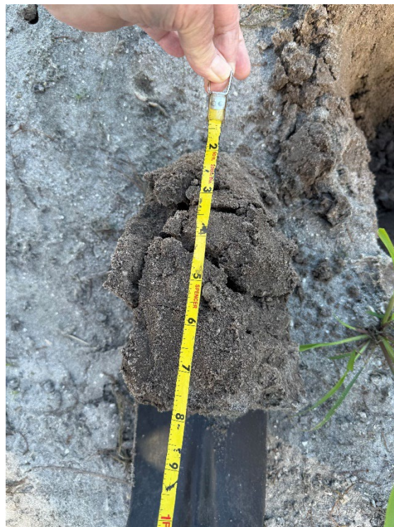
Apparent shell rock fill material t placed in center of lot and around existing trees