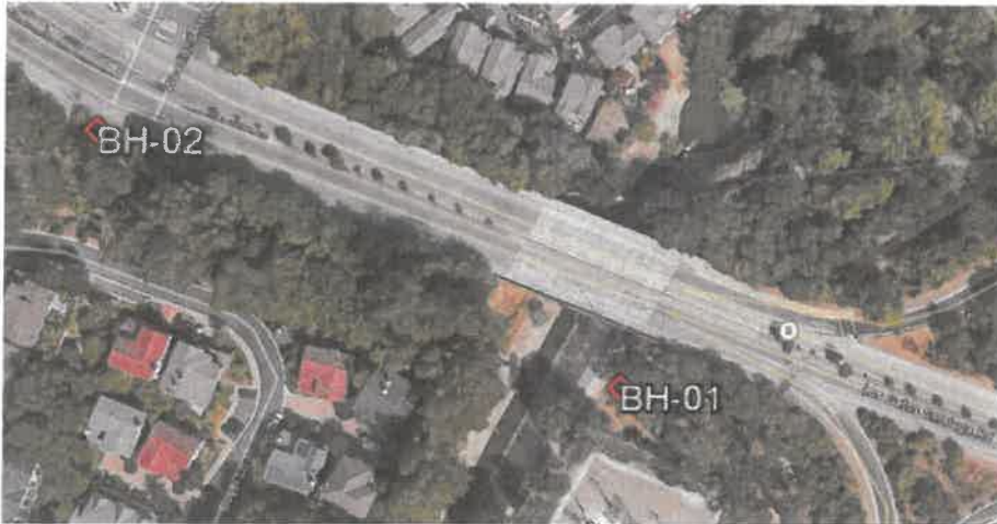
Figure 1: Proposed Borehole Locations

Mott MacDonald will coordinate and provide subcontractors to complete the following services: