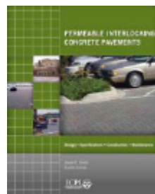
ICPI - Permeable Interlocking Concrete Pavements

As a final thought, should one or more pavers become damaged, individual units can be removed and replaced without compromising the structural integrity of the system (instruction manual available upon request).