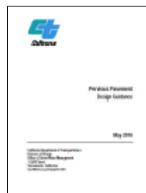
Caltrans - Porous Pavement Design Guidance