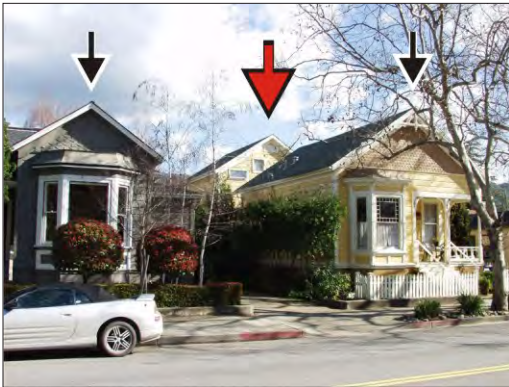
Placing a two story addition to the rear can minimize its impact on the historic resource and the scale of the neighborhood

should utilize the same materials as the existing protected exterior elements.