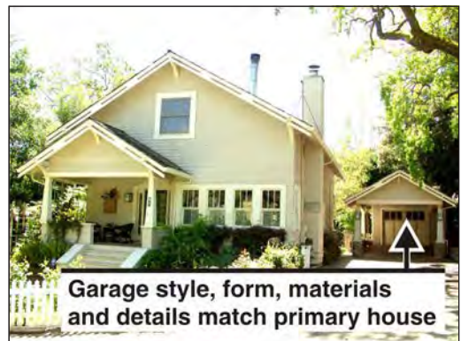
Additions, accessory buildings and secondary units should match the form, architectural style, and details of the original house