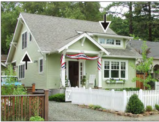
Addition incorporated into the roof successfully adds space while respecting the integrity of the existing house and the scale of the neighborhood