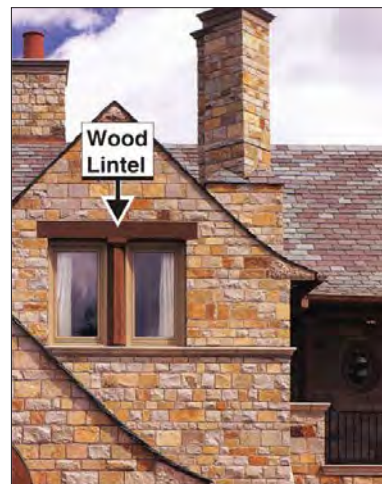
Use stone or wood lintels over openings in stone walls