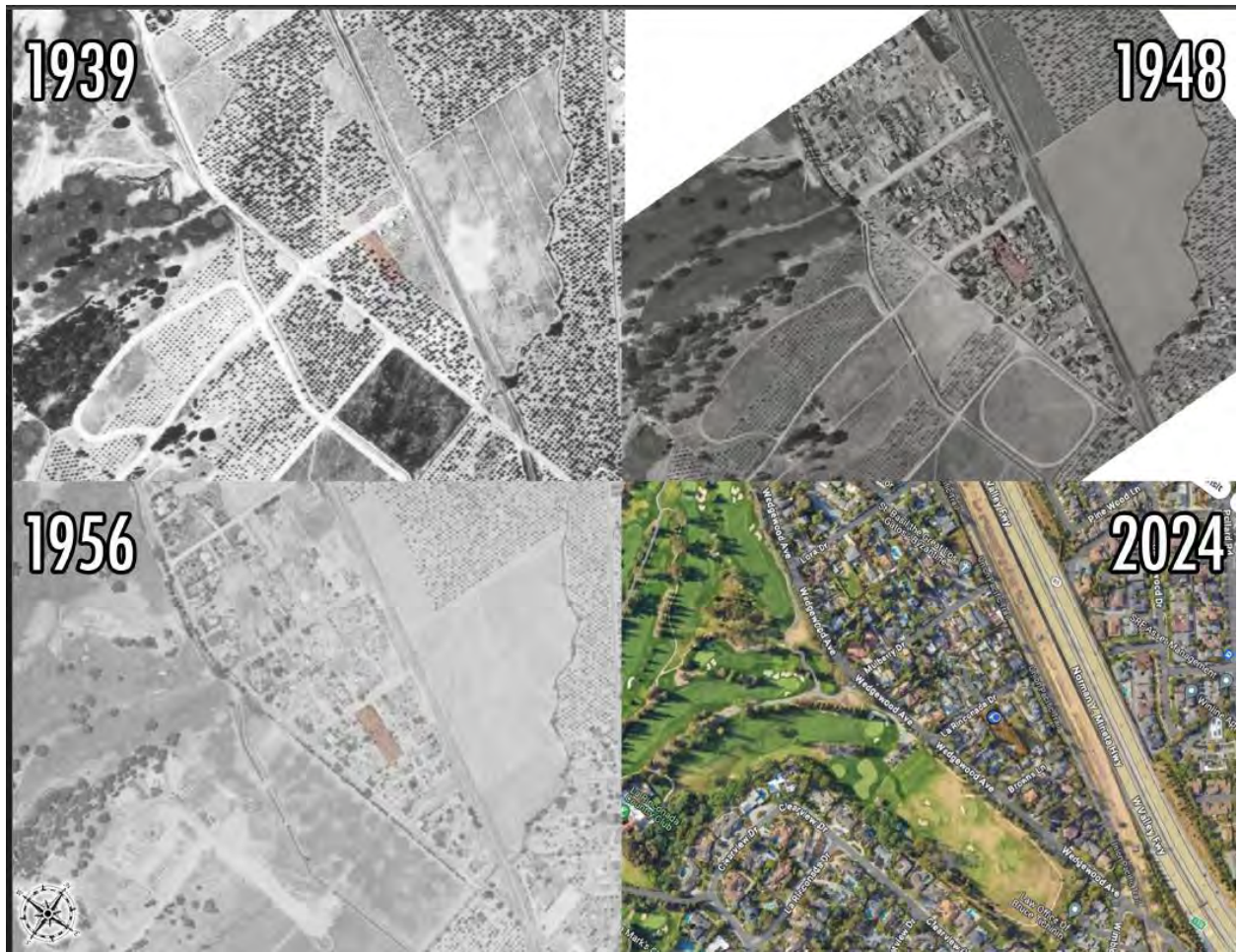
04. Aerial Photos