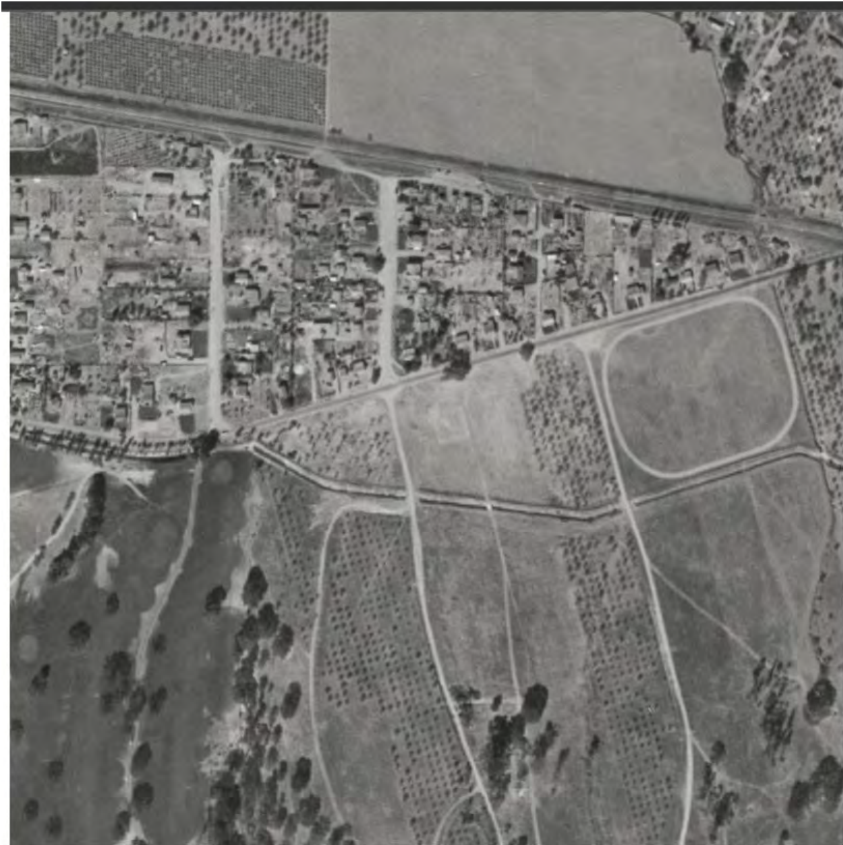
02. Scan of Aerial Photo in 1948