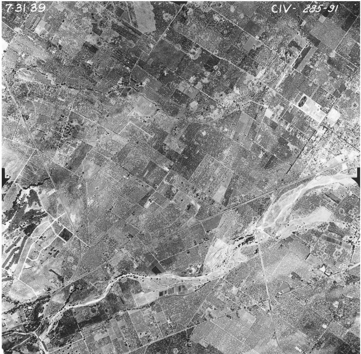
01. Aerial Photo of Neighborhood