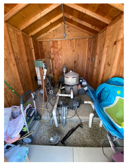
INTERIOR OF SHED