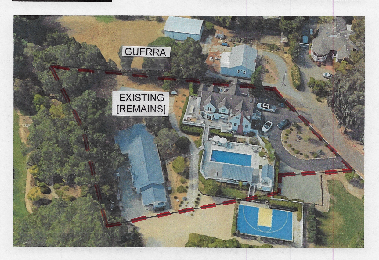
PARCEL 2 - POTENTIAL BUILDING SITE