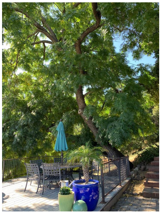
Tree #9. Walnut tree proposed for removal.

SERVICE CENTER 41 MILES AVENUE LOS GATOS, CA 95030