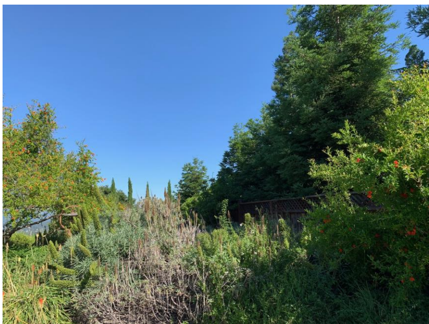
Trees #1 through 8. Redwood trees.