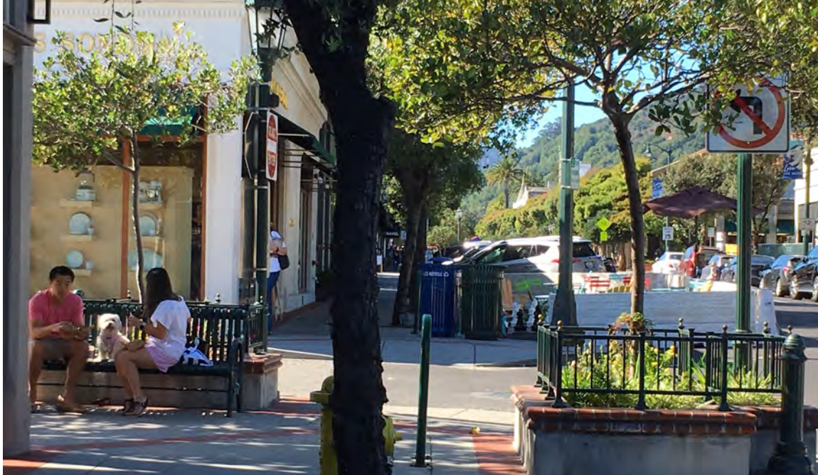
Visitors choose green bench away from traffic over nearby empty parklet even when parklet is shaded.

beautification. It is embarrassing that their contributions, sweat equity, memorials and dedications are now being belittled by proponents of trendy for the sake of trendy. I walk downtown regularly and have seen only a few people sitting in parklets, but I often see folks enjoying time both on the green benches and in well-designed private spaces as evidenced below.