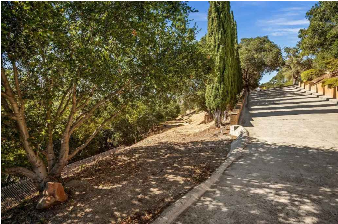
LOOKING UP VIVIAN DRIVE AT THE NEW DRIVEWAY ENTRANCE LOCATION

FROM THE OFFICE OF CHRIS SPAULDING ARCHITECT 801 CAMELIA STREET, SUITE E BERKELEY CA 94710