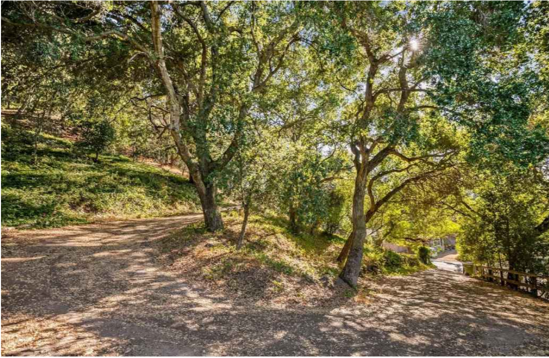
THE FIRST HAIRPIN TURN ON THE OLD DRIVEWAY FROM KENNEDY ROAD