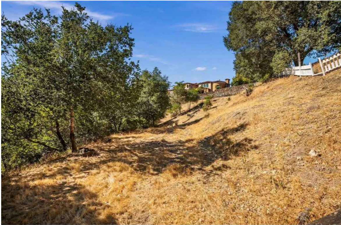
FIRE APPARATUS TURN-AROUND LOCATION