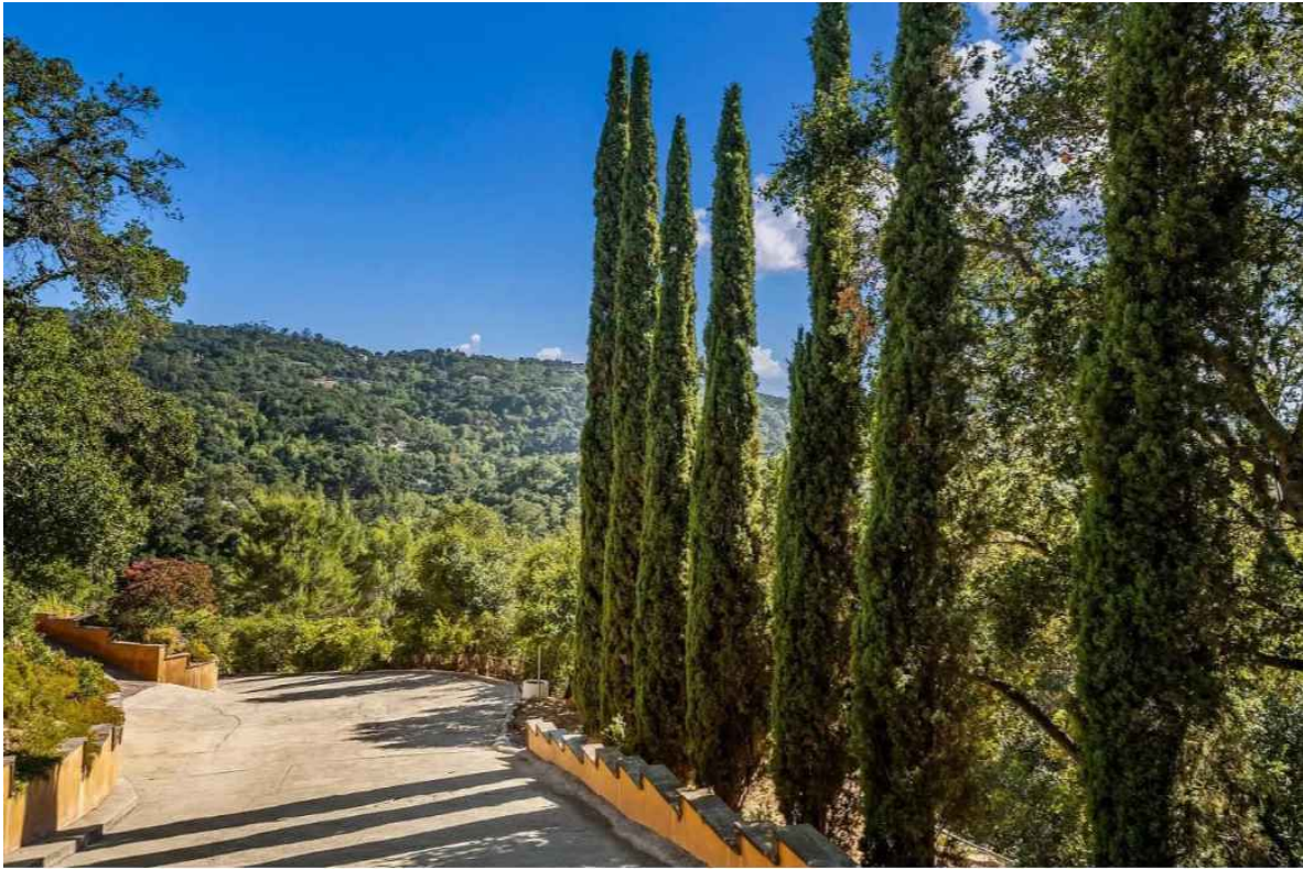
LOOKING DOWN VIVIAN DRIVE WHERE NEW DRIVEWAY WILL ENTER