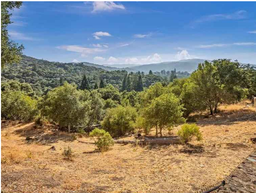
LOOKING DOWN AT THE BUILDING SITE FROM THE ROAD ABOVE

FROM THE OFFICE OF CHRIS SPAULDING ARCHITECT 801 CAMELIA STREET, SUITE E BERKELEY CA 94710