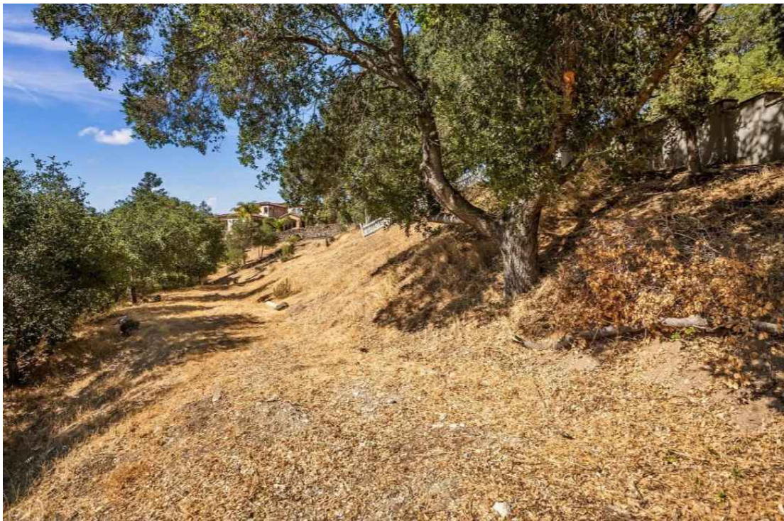
LOOKING DOWN THE NEW DRIVEWAY ENTRY TOWARDS THE BUILDING SITE

FROM THE OFFICE OF CHRIS SPAULDING ARCHITECT 801 CAMELIA STREET, SUITE E BERKELEY CA 94710