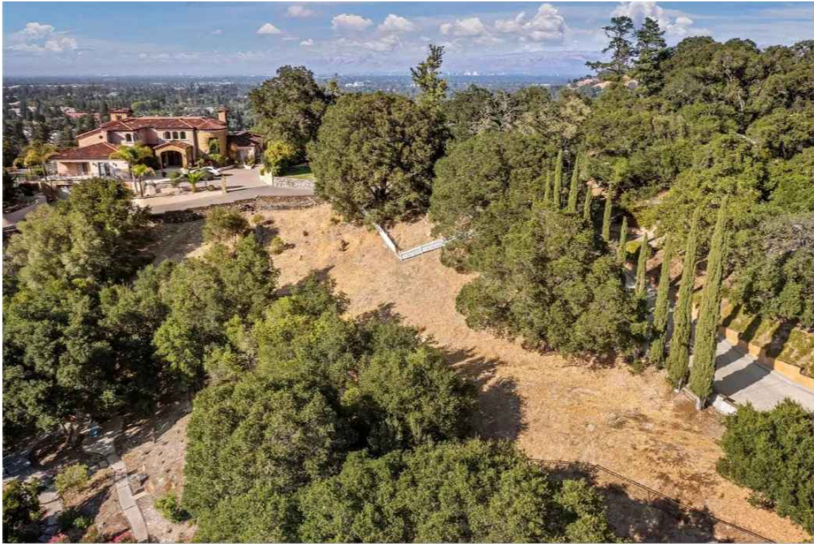
AERIAL VIEW OF BUILDING SITE