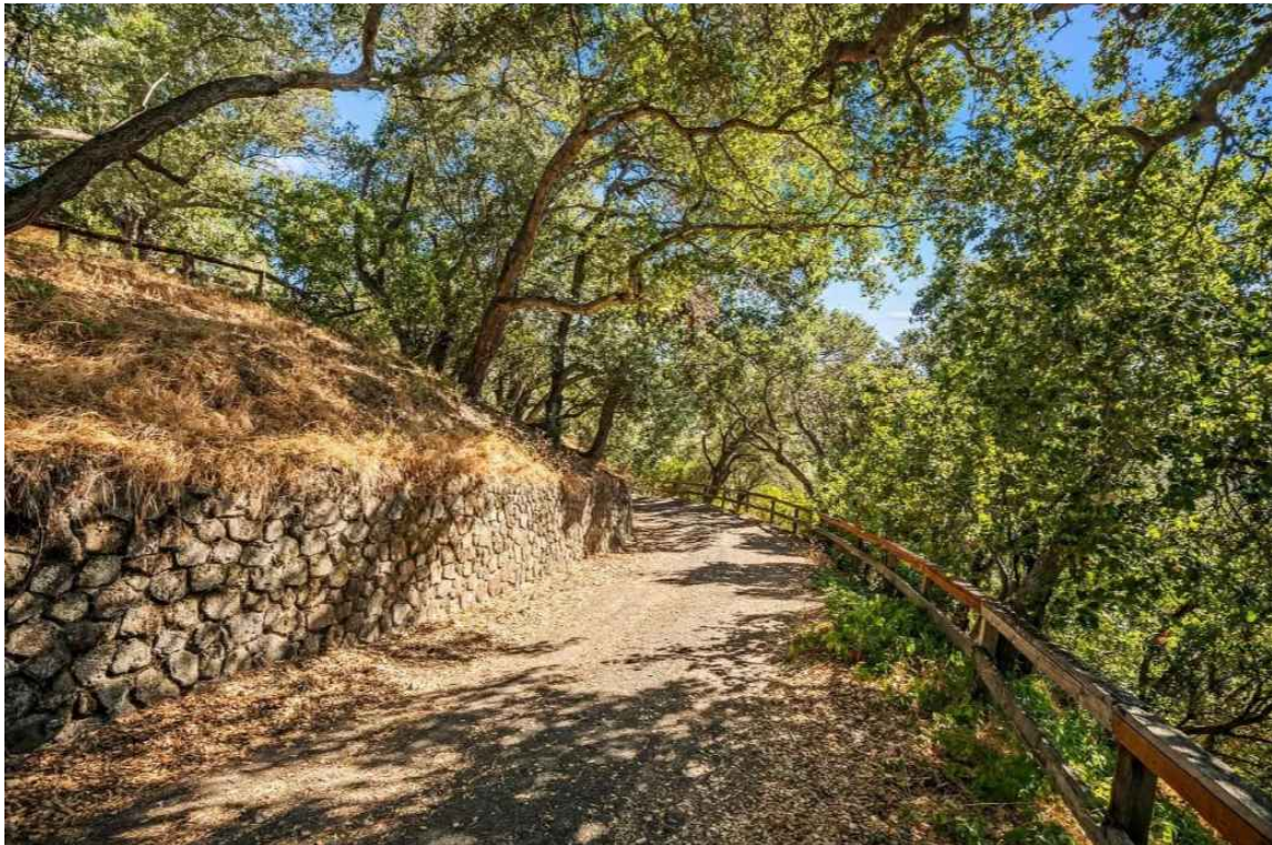
THE OLD DRIVEWAY FROM KENNEDY ROAD

FROM THE OFFICE OF CHRIS SPAULDING ARCHITECT 801 CAMELIA STREET, SUITE E BERKELEY CA 94710