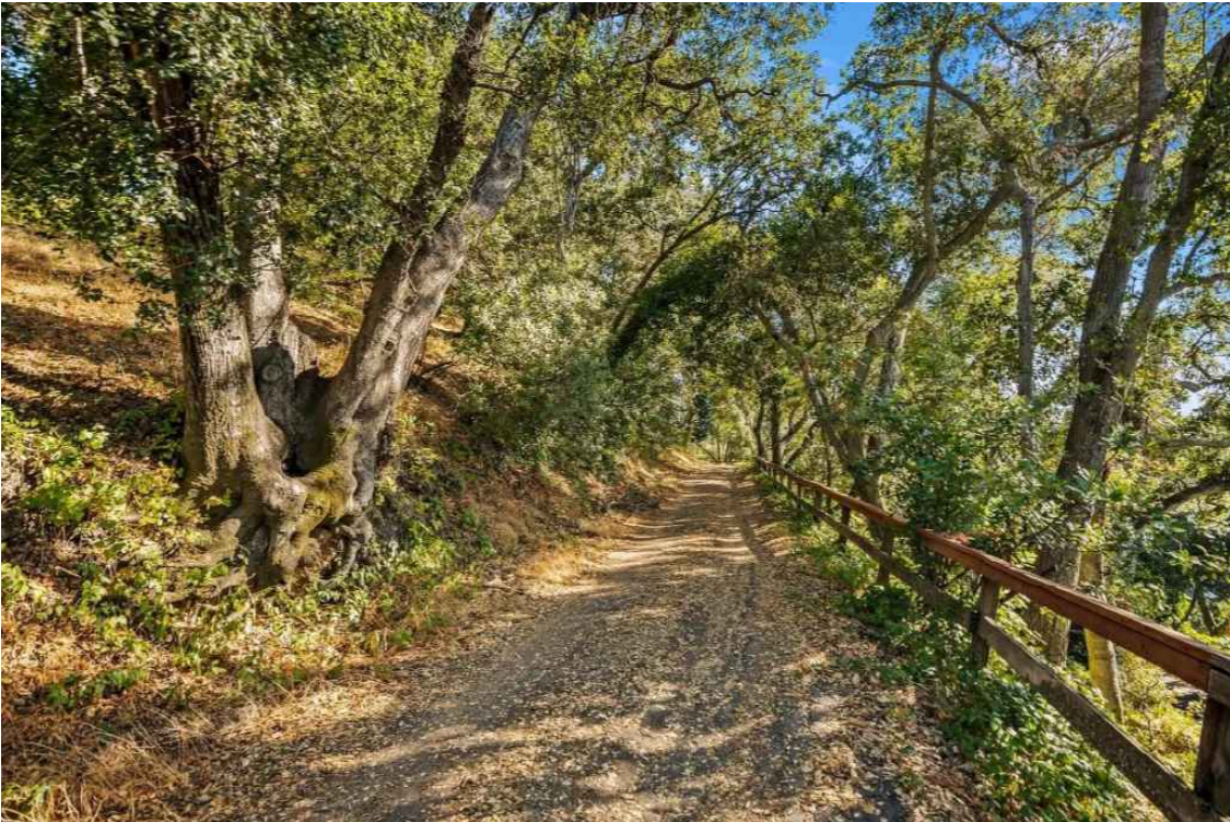
THE OLD DRIVEWAY FROM KENNEDY ROAD

FROM THE OFFICE OF CHRIS SPAULDING ARCHITECT 801 CAMELIA STREET, SUITE E BERKELEY CA 94710