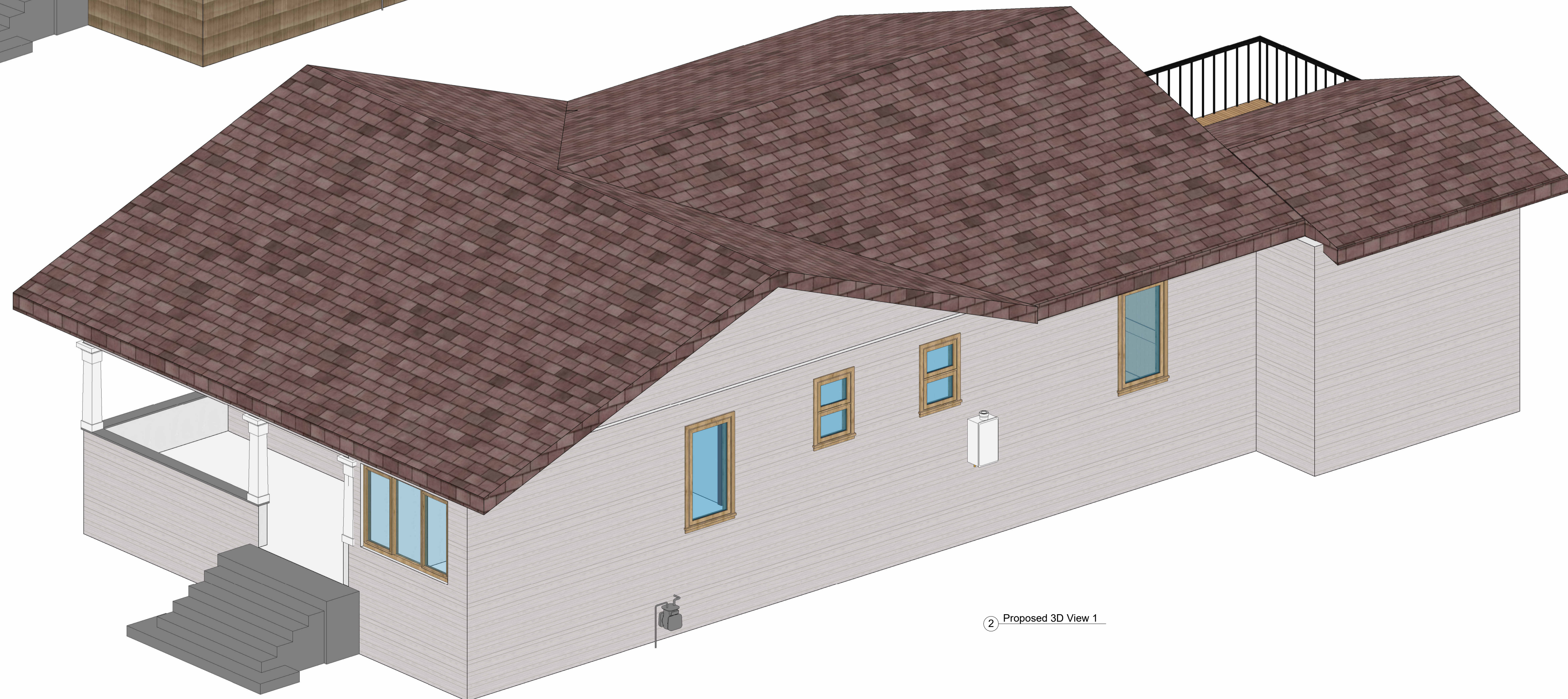
② Proposed 3D View 1