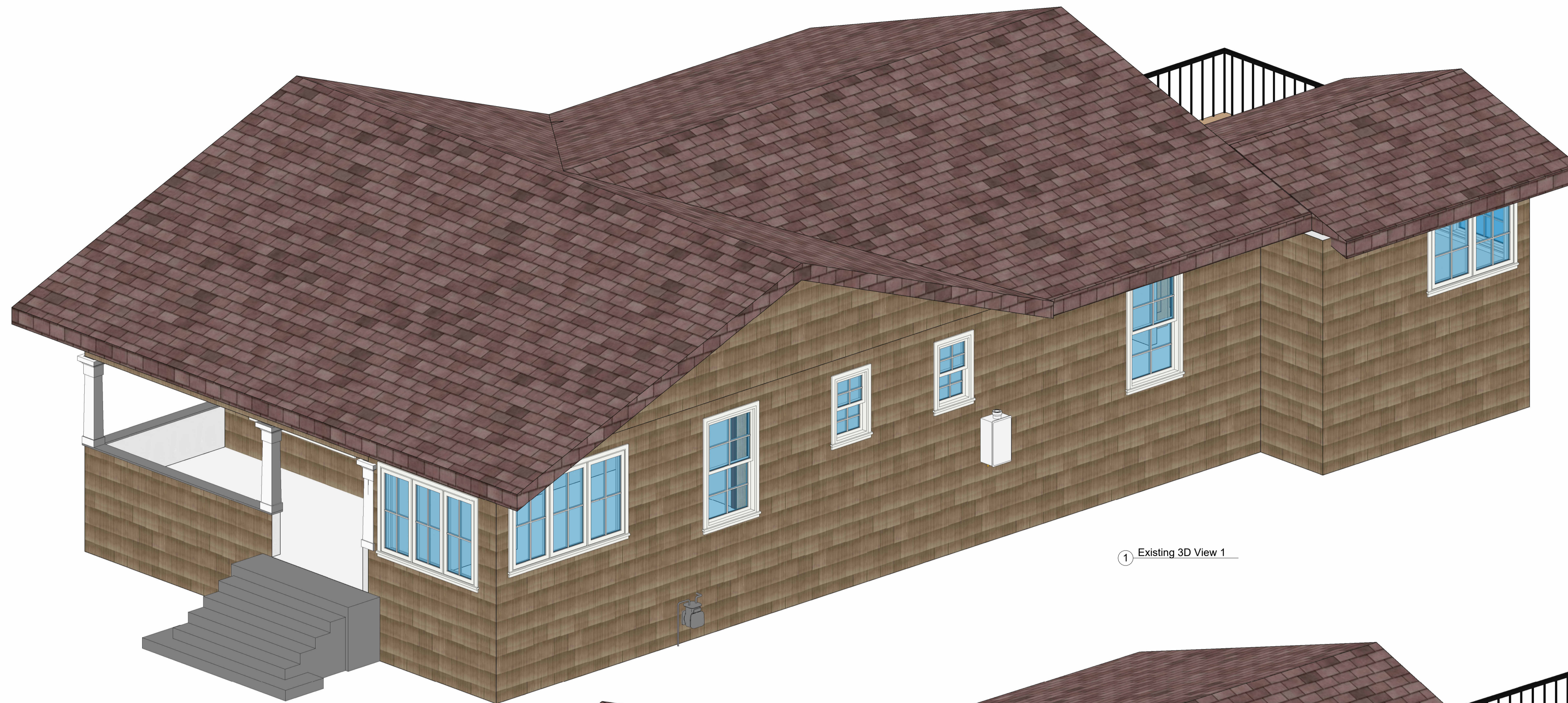
① Existing 3D View 1