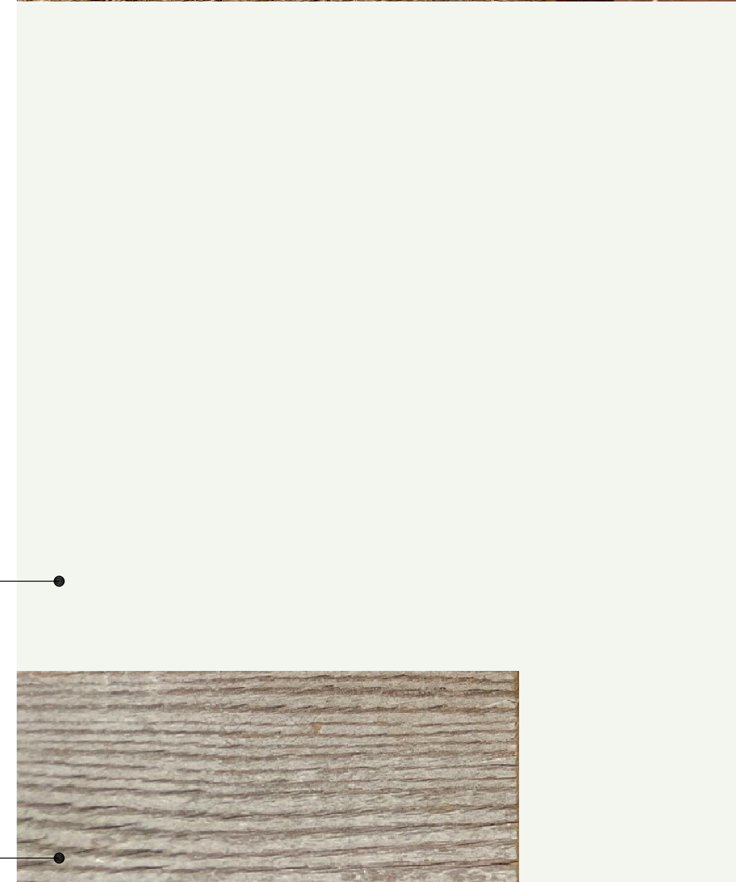
RECLAIMED WOOD LINTELS