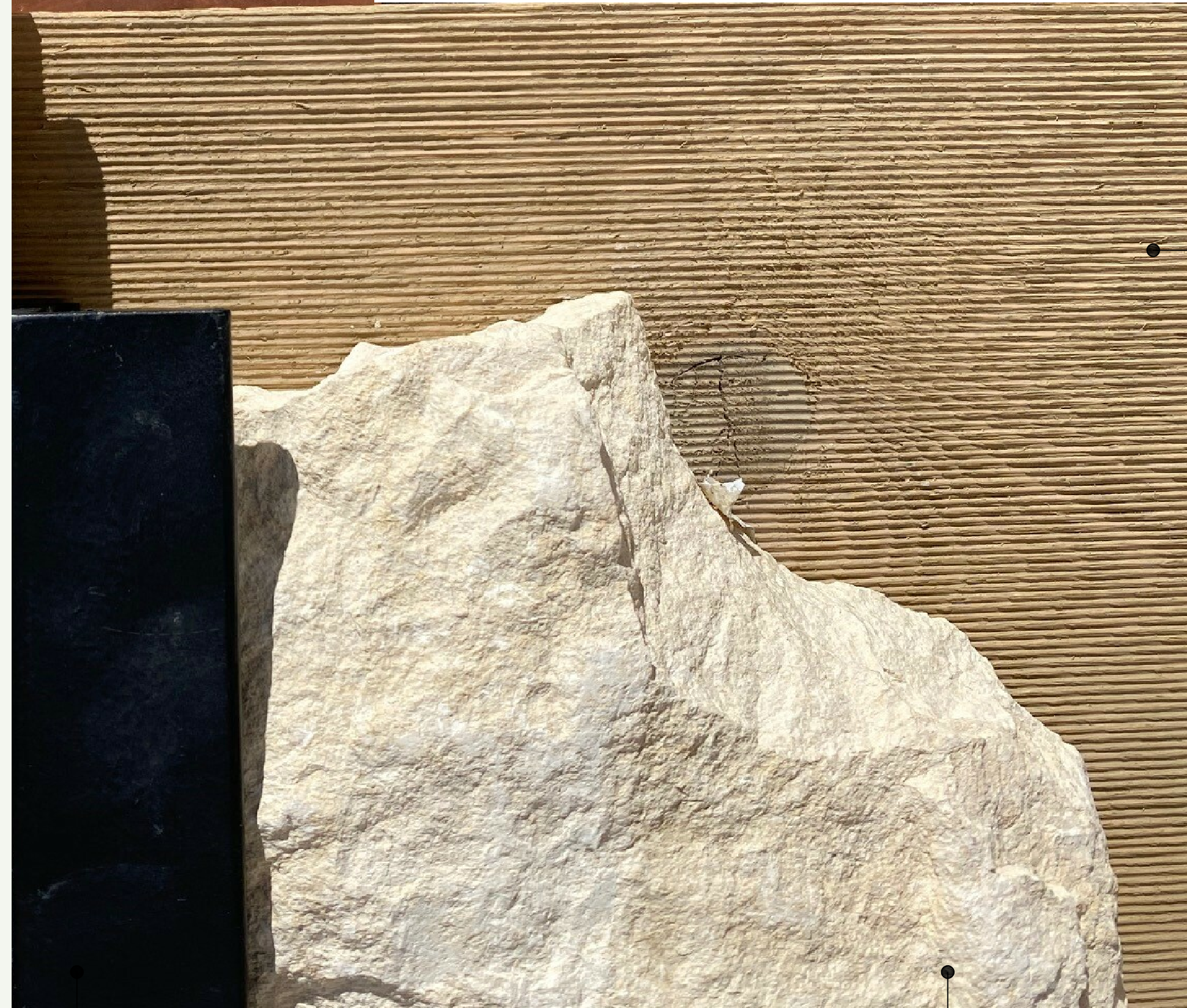
SPLIT FACED STONE VENEER