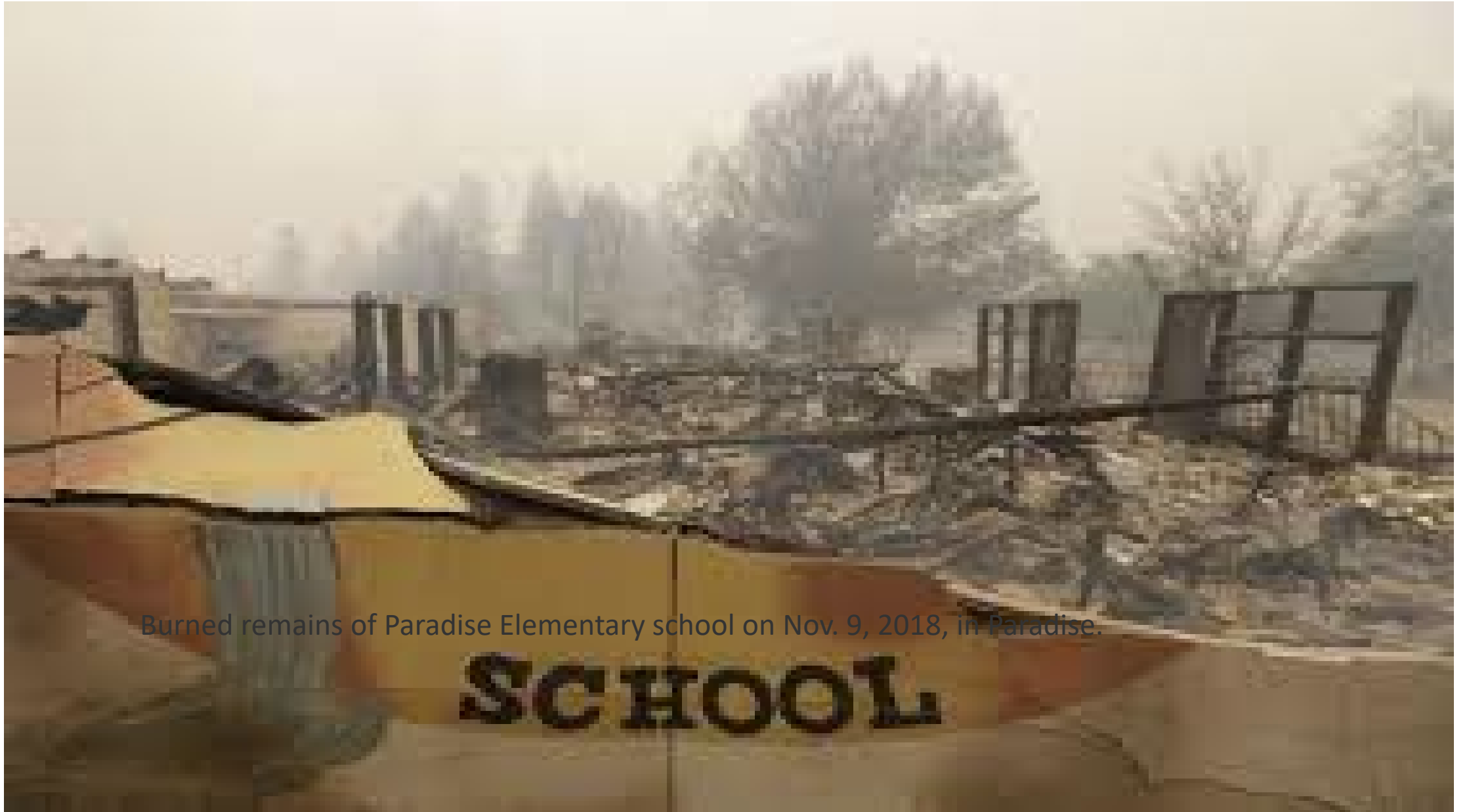
Burned remains of Paradise Elementary school on Nov. 9, 2018, in Paradise.