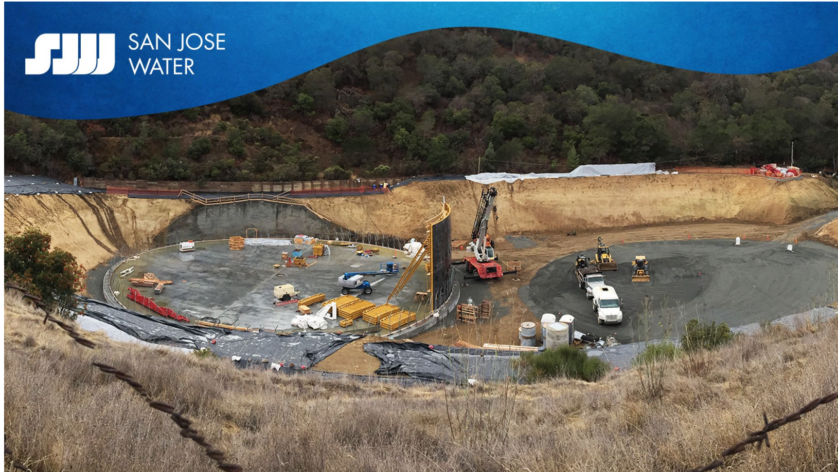
2018 Built 2 2.5M gallon tensioned concrete reservoirs.