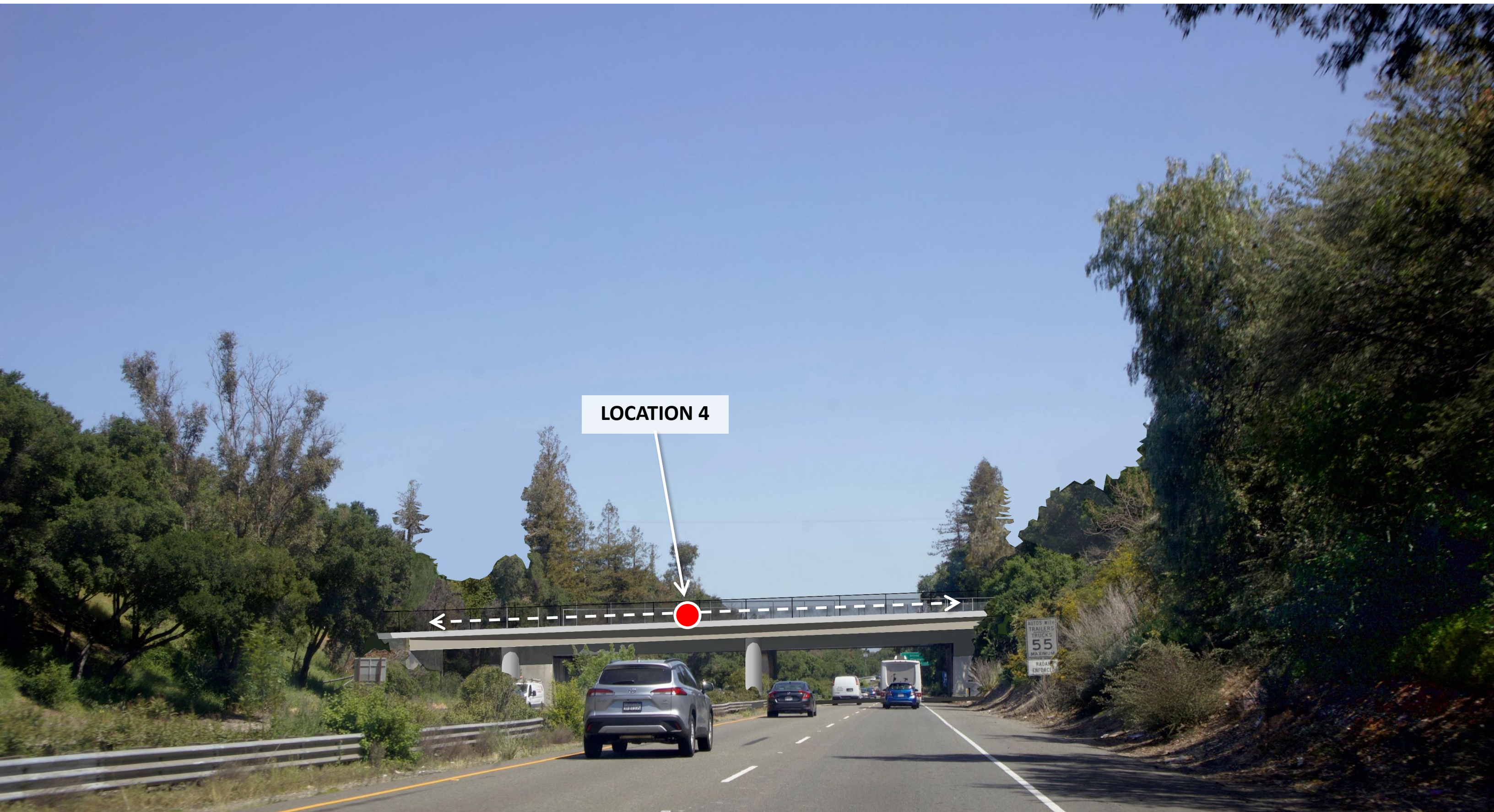
3 – BLOSSOM HILL / SR-17 BPOC – PUBLIC ART LOCATIONS – NORTH-FACING VISUAL SIMULATION