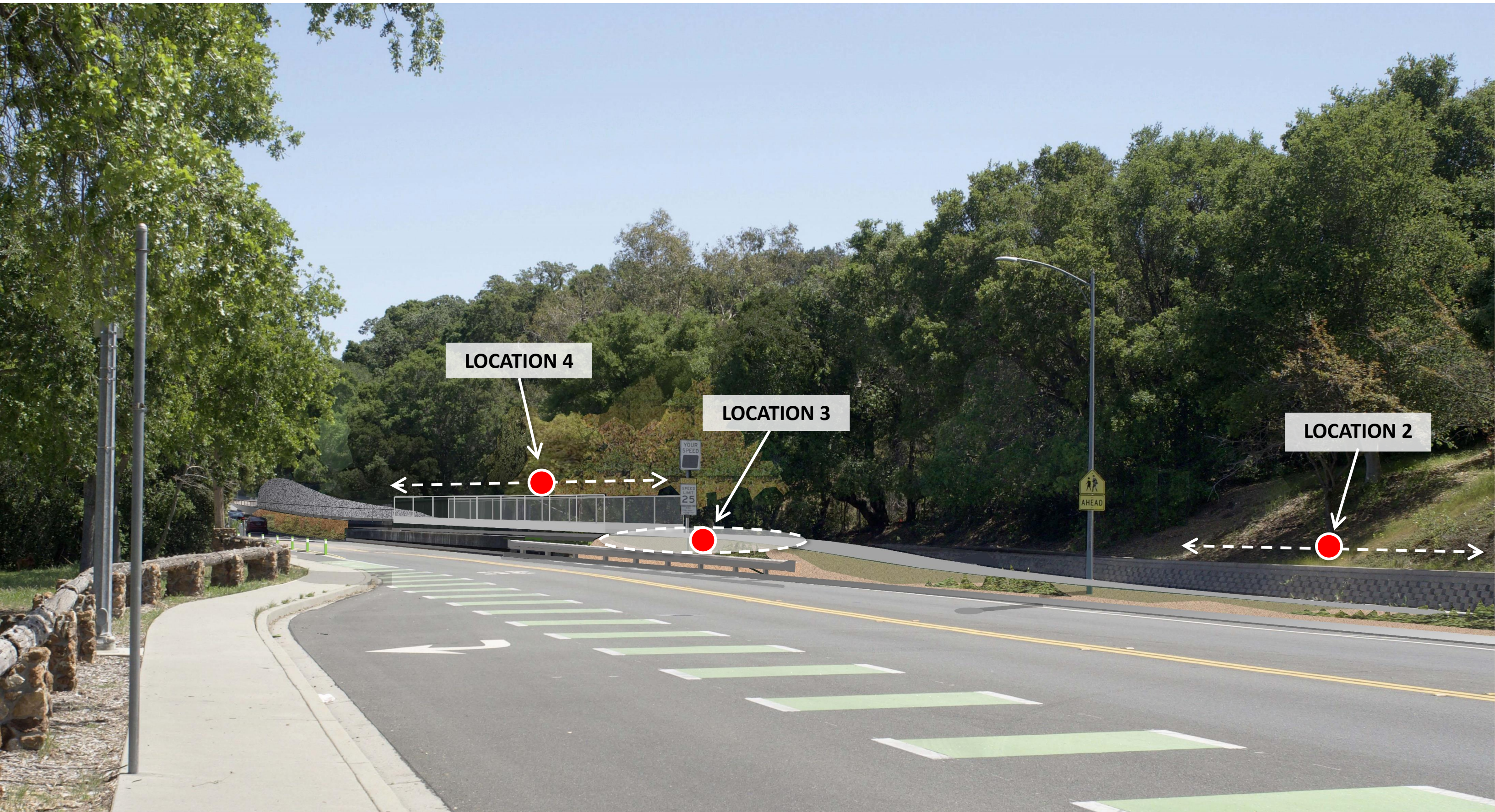
2 – BLOSSOM HILL / SR-17 BPOC – PUBLIC ART LOCATIONS – EAST-FACING VISUAL SIMULATION