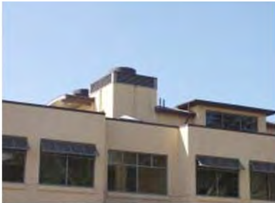
Equipment screen integrated with building design

Commercial Design Guidelines, pg 12 Exhibit 1