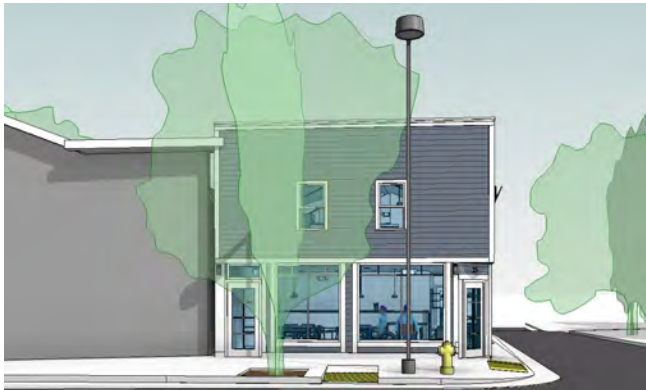
Front Street View

Roof top vent, placed at the rear of the building, is screened by the proposed mechanical screen with vertical siding. The screen is not visible from the front and rear views.