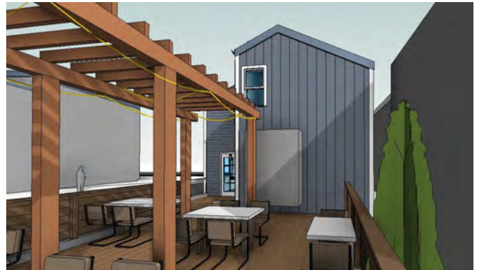
Rear Patio View