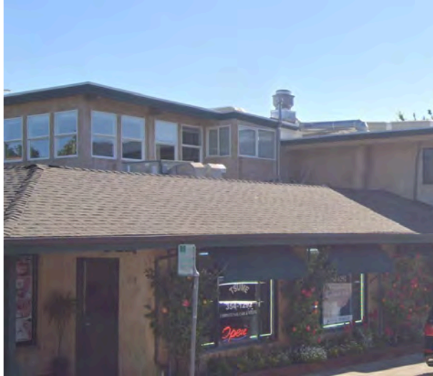
322 N Santa Cruz Ave, Exhibit 5