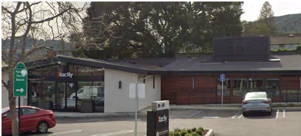
221 Saratoga-Los Gatos Rd, Exhibit 7