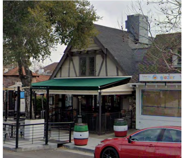
330 N Santa Cruz Ave, Exhibit 6