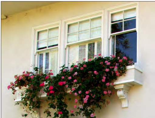
True divided lite windows are encouraged when appropriate to the original structure