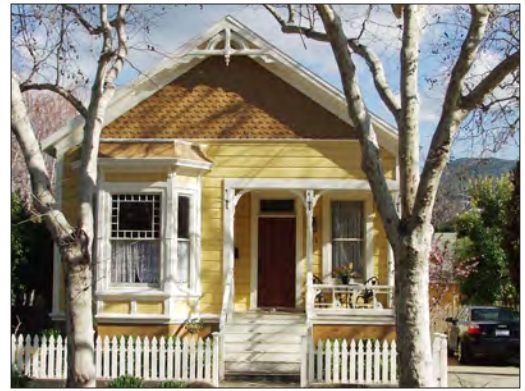
Match bay windows to the architectural style of the house