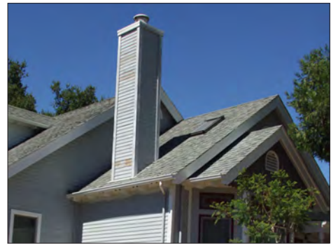
Wood clad chimneys are prohibited