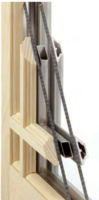
Simulated divided lite windows may be considered on a case-by-case basis