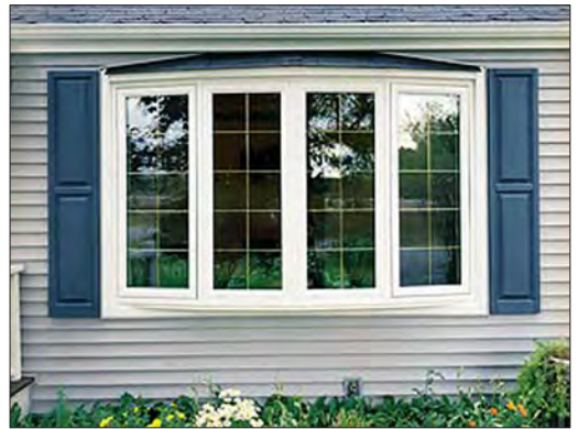
Some window styles, such as this bow bay window, would have very limited applicability for use on a historic resource structure