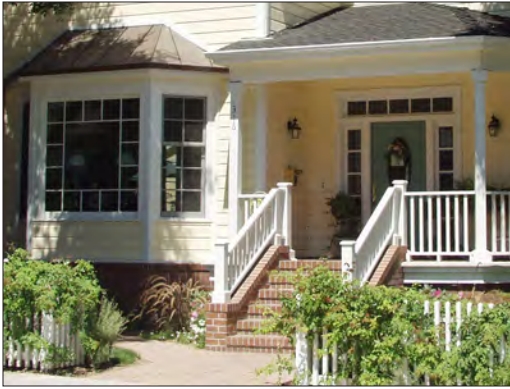
Original doors and windows should be retained and repaired