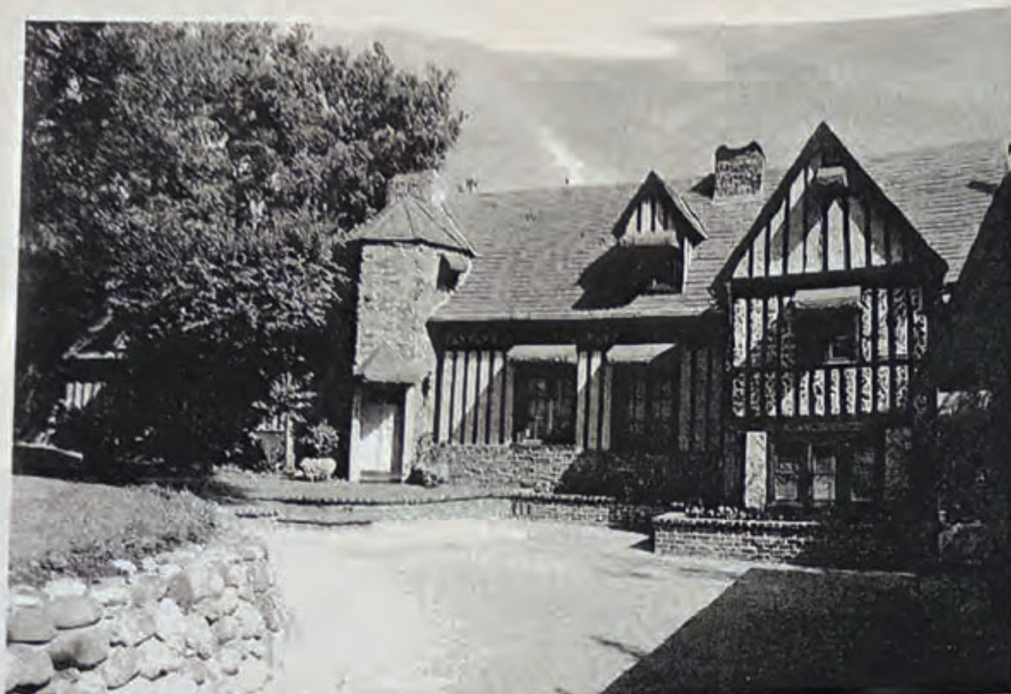
68 Broadway Les Moineaux