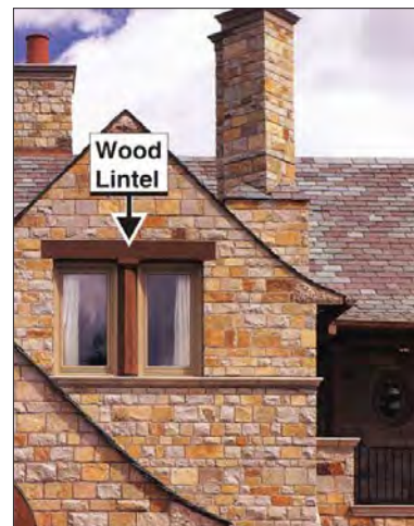
Use stone or wood lintels over openings in stone walls