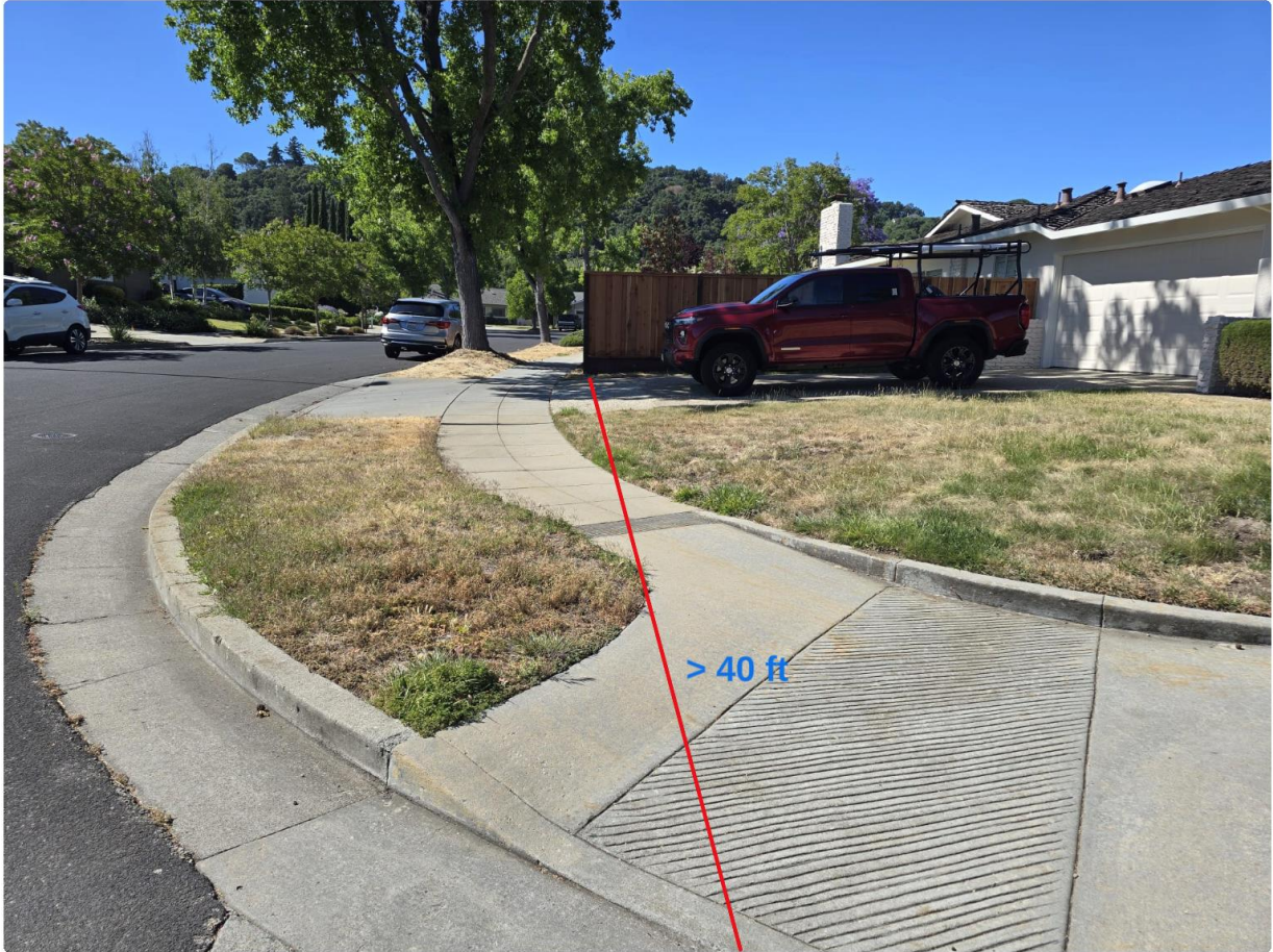
Pic2: Fence is more than 40ft from the intersection