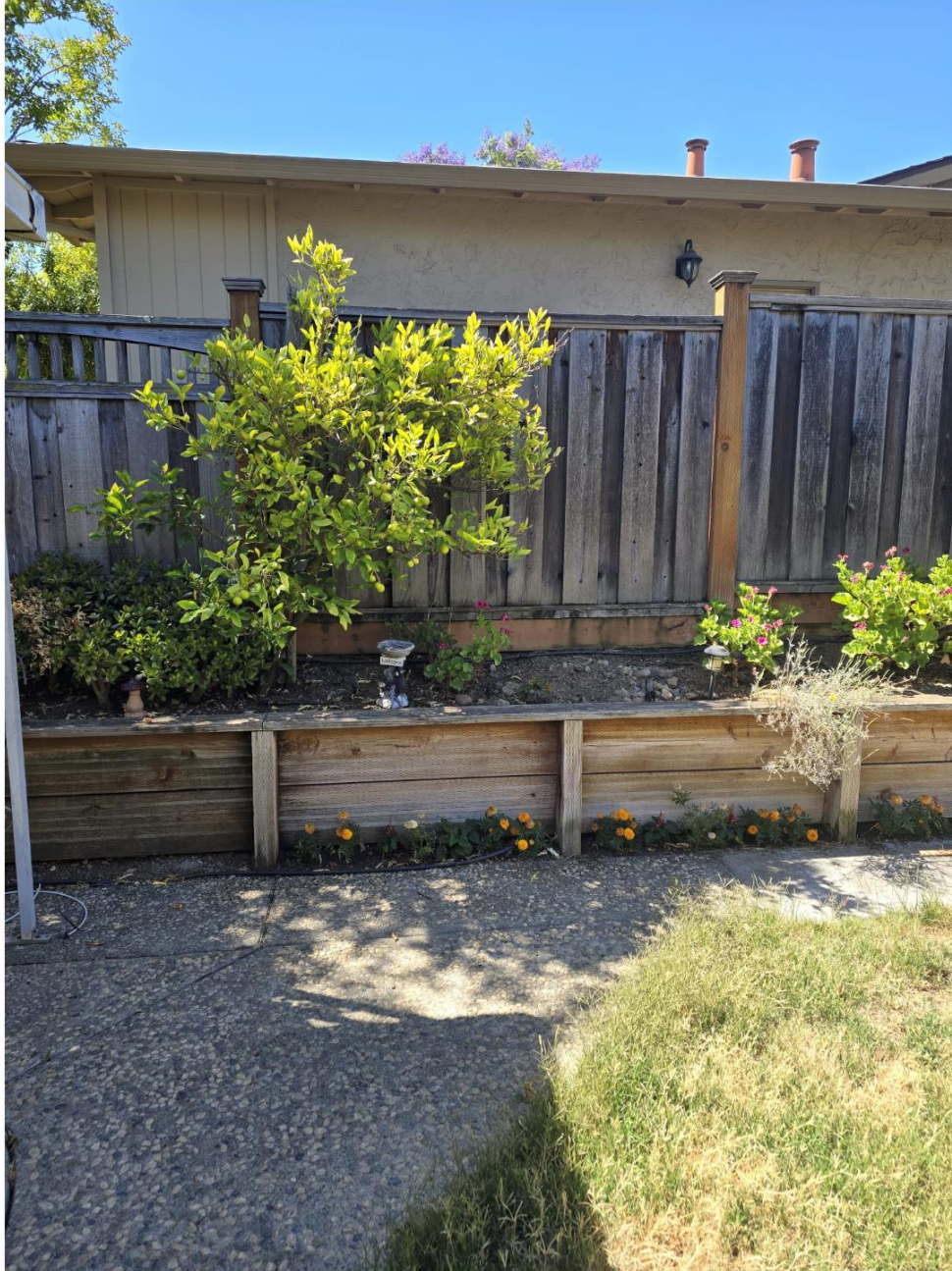
Pic 3: Height of the fence adjacent to the neighbor and proximity to their house

We have two young boys, ages 7 and 3 respectively, who need open and safe space to play. Our neighborhood sees a heavy pedestrian traffic. With kids so young, a 3 ft fence will have them exposed to all the passersby and some pets that tend to be aggressive. Given how young and eager to make friends they are, a 3 ft fence in that area of the house will make it practically unusable by our kids. Our backyard is so narrow that we cannot put a play structure or even a basketball hoop for our kids to play[Pic 4]. In