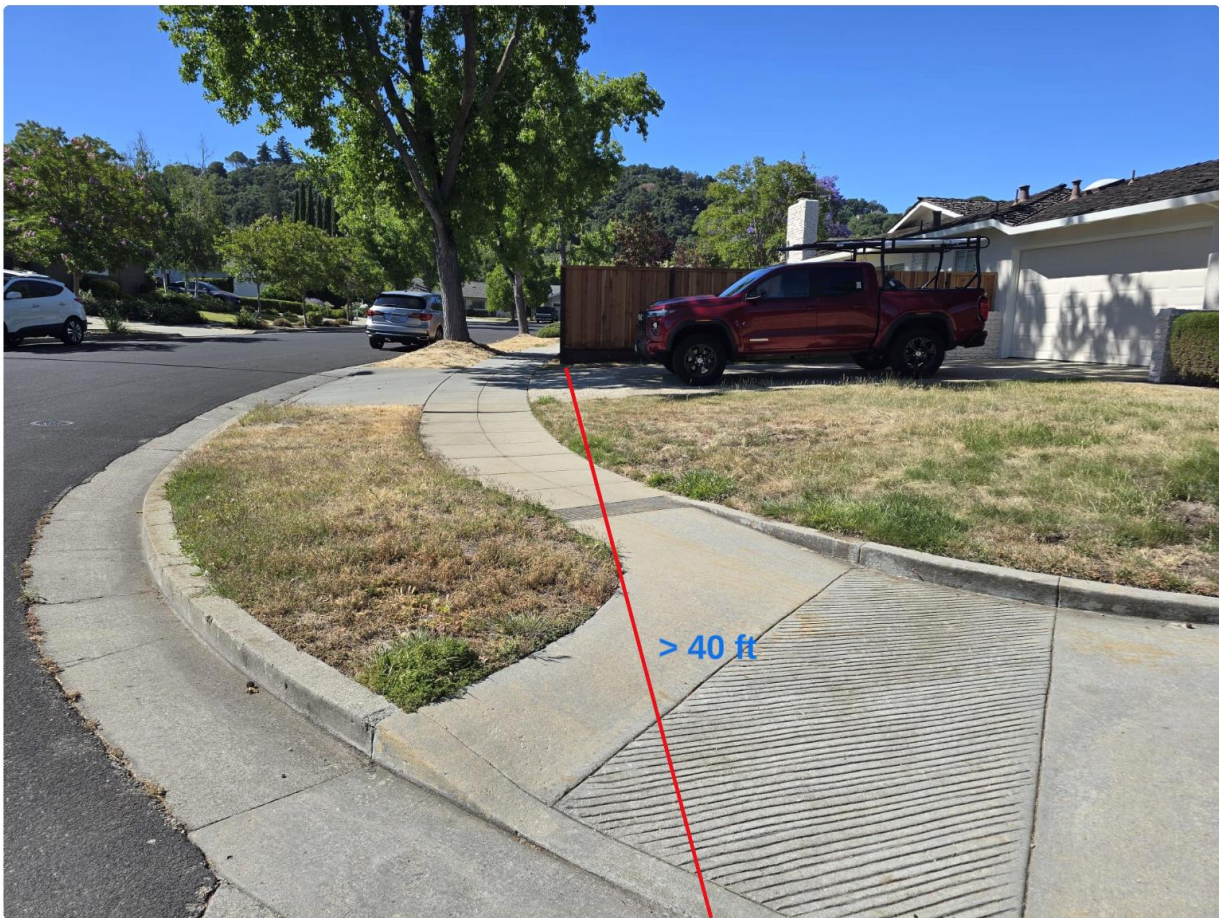
Pic1: More than 40 ft from the corner intersection

When we constructed our fence, we followed the example set by most corner homes in our neighborhood, unaware of any specific regulations that applied (Photos of similar fences in the neighborhood are at the end of this letter). In doing so, we ensured that we did not fence the corner of the intersection, leaving more than 40 feet for visibility. Our fence abuts the street next to the cul-de-sac, where there is not a lot of traffic, which we believed would not pose any issues. [Pic1, Pic2]