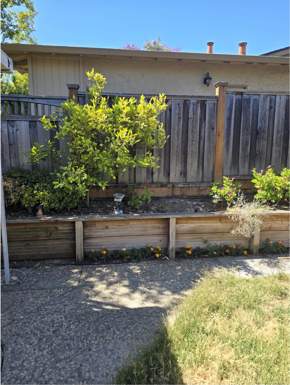
Pic 4: Height of the fence adjacent to the neighbor and proximity to their house