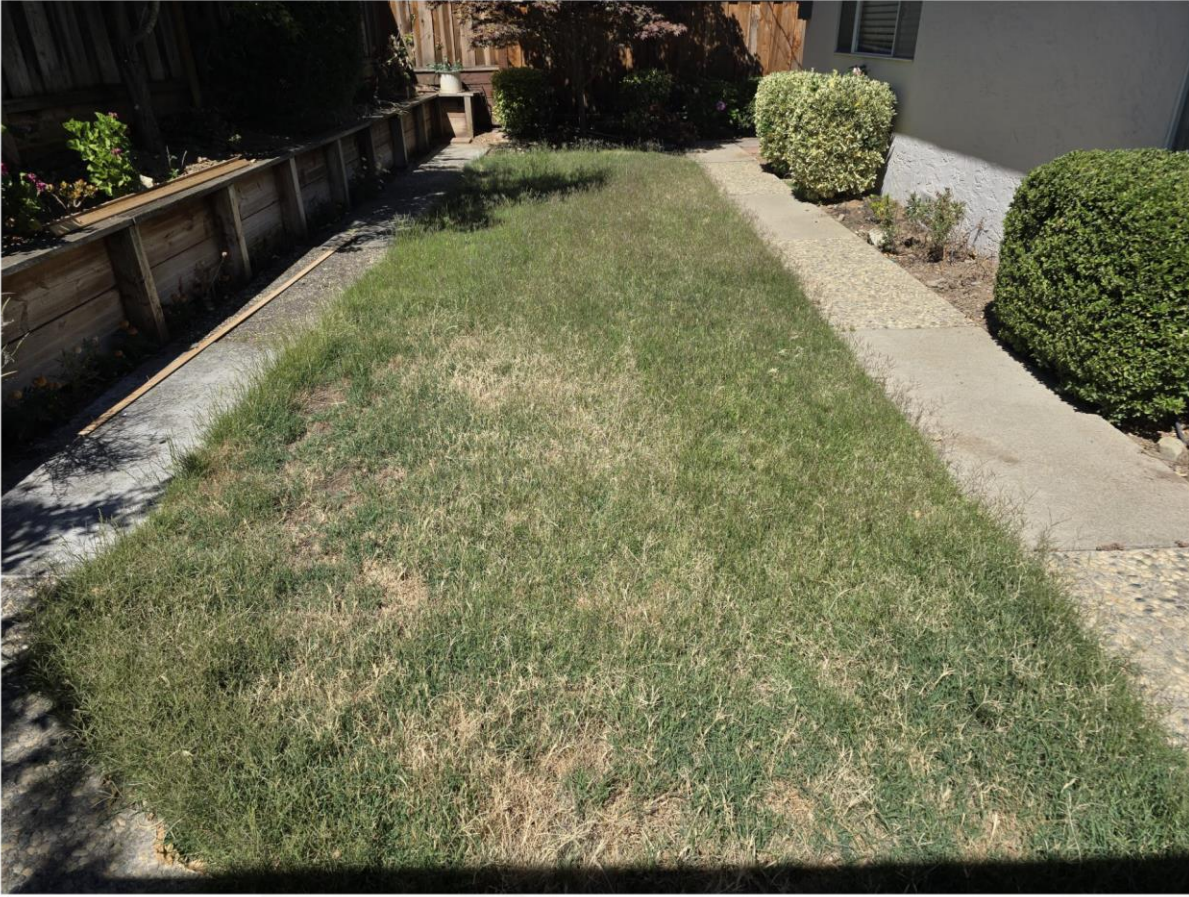
Pic 3: Picture depicting how narrow our backyard