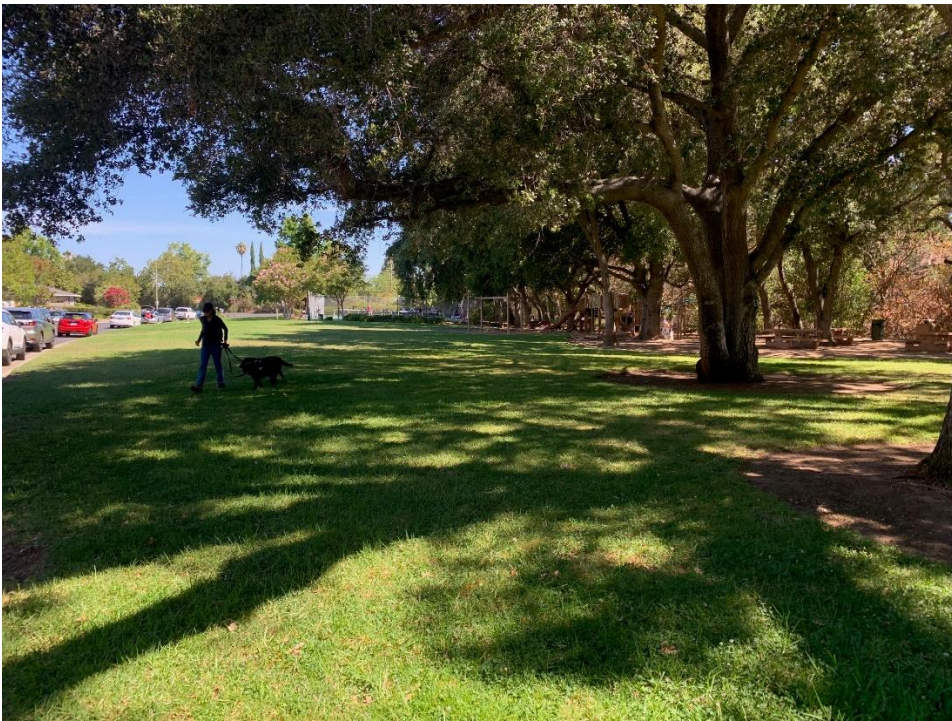
Riconda neighbor park yesterday