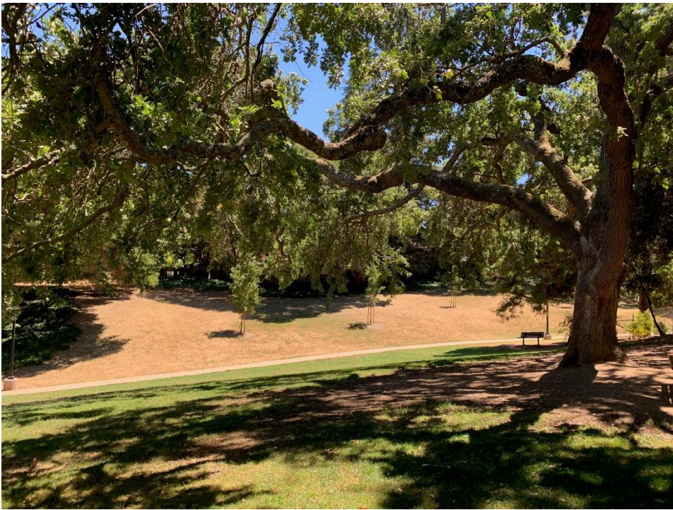
Bachman upper 1/3 dead above no water!