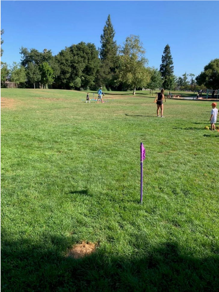
Blossom hill yesterday Sent from my iPhone