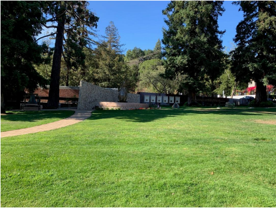
Civic center yesterday