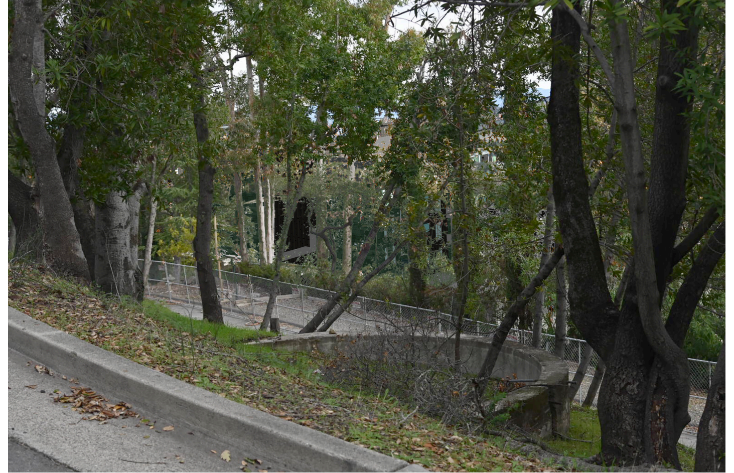
FINE TUNED ARCHITECTURE BASED ON STORY POLE LOCATIONS (JANUARY 2022)