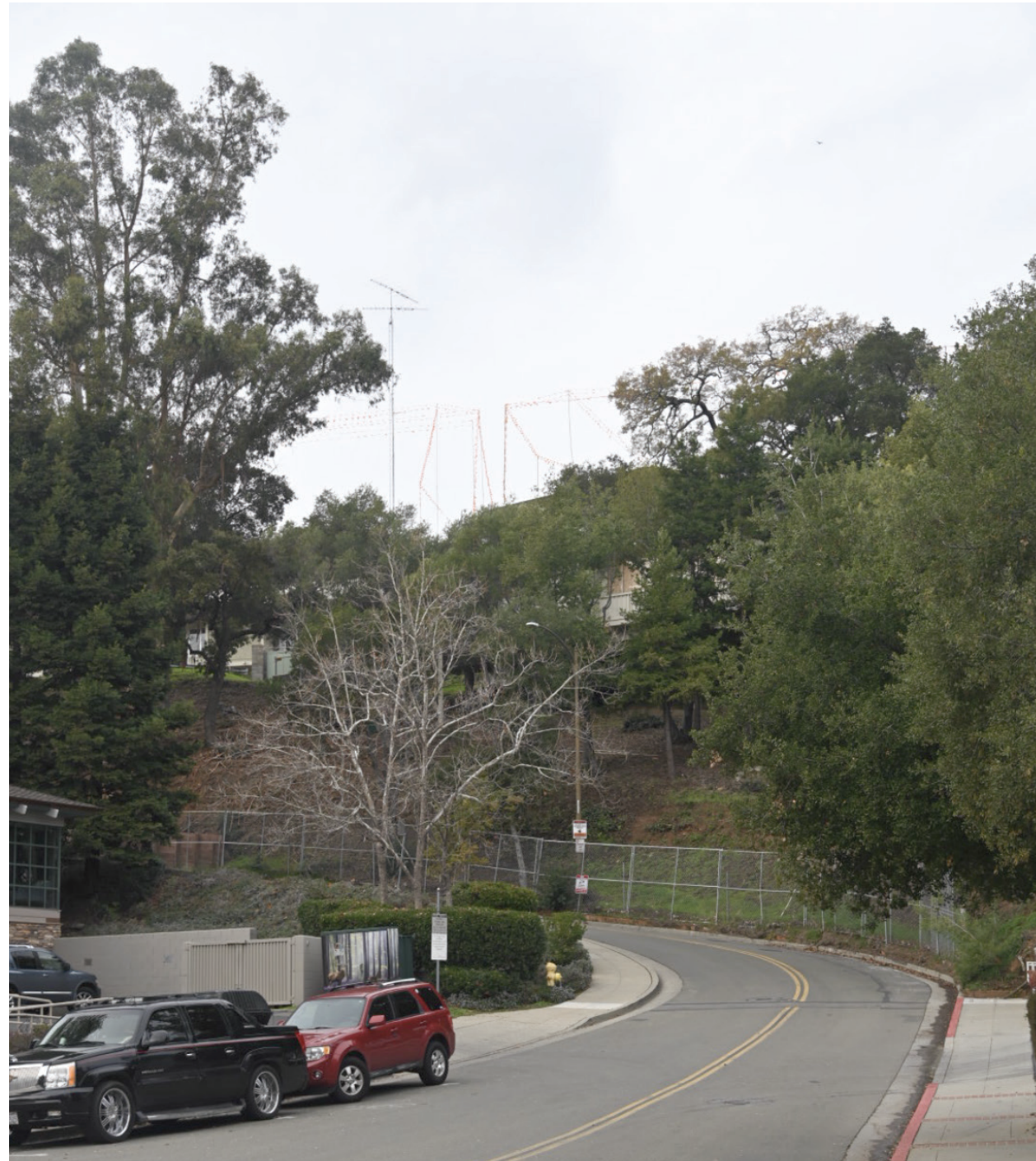
VIEW WITH STORY POLE