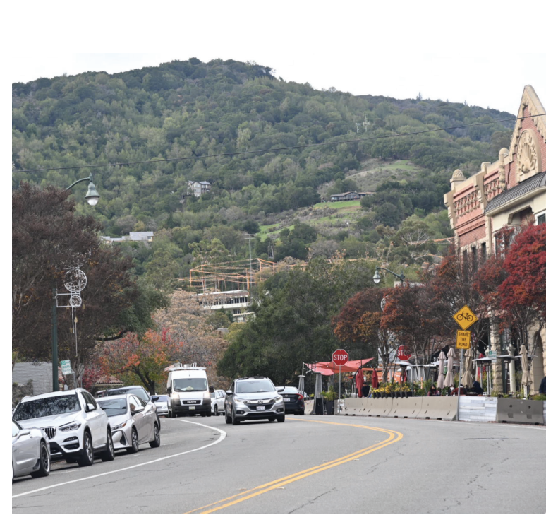
VIEW WITH STORY POLE (DECEMBER 2021)