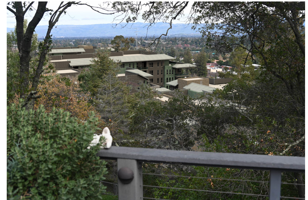
FINE TUNED ARCHITECTURE BASED ON STORY POLE LOCATIONS (JANUARY 2022)