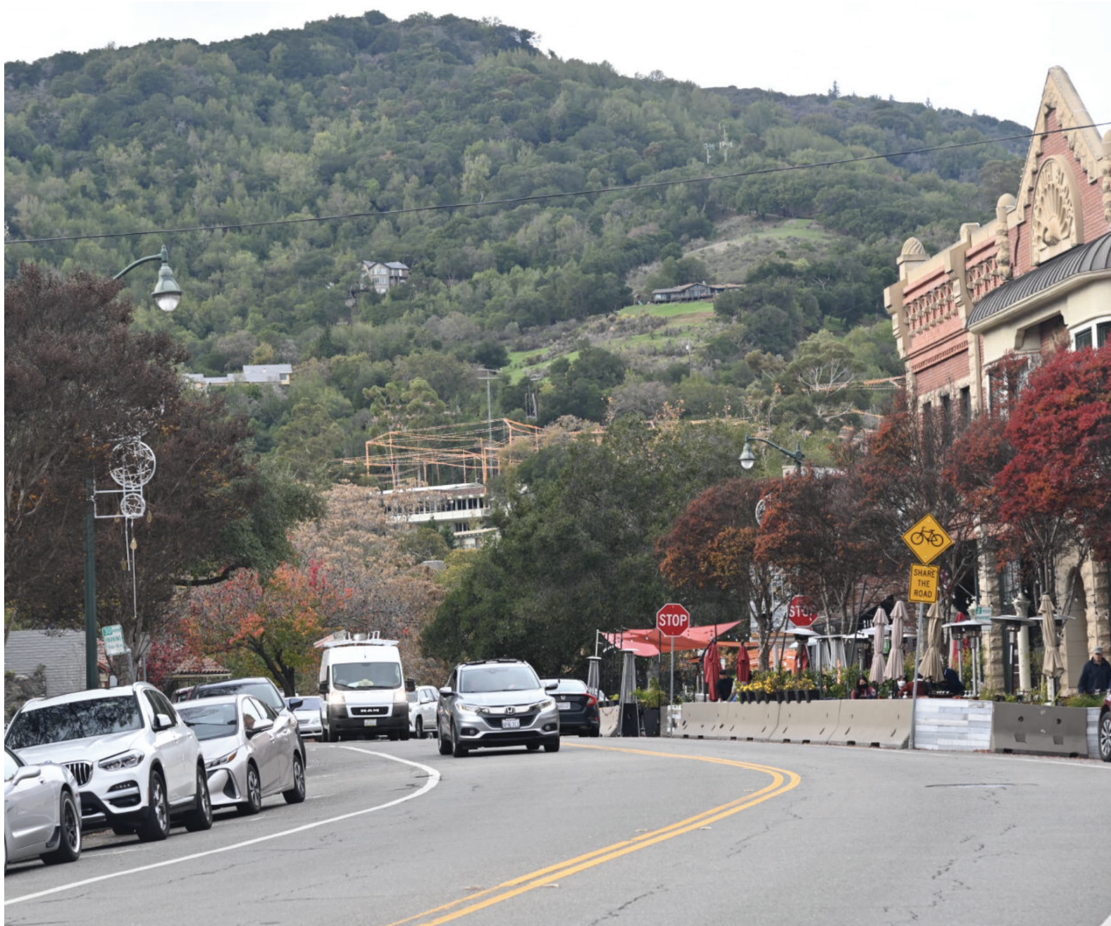
VIEW WITH STORY POLE