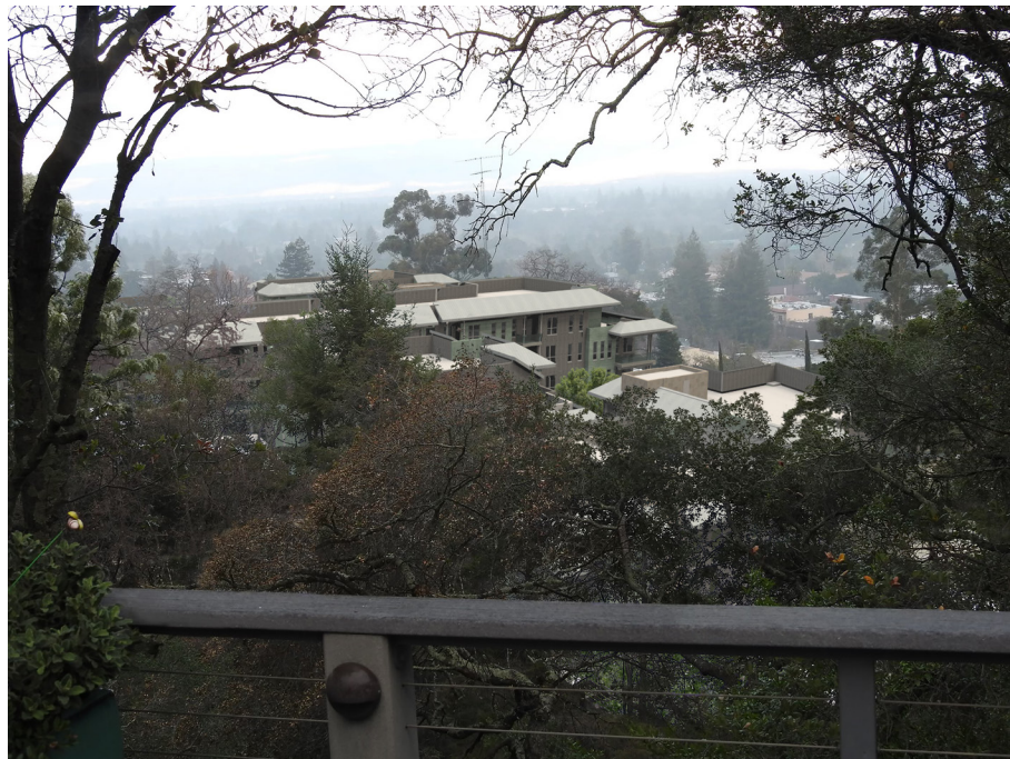
PROPOSED (MAY 2021)