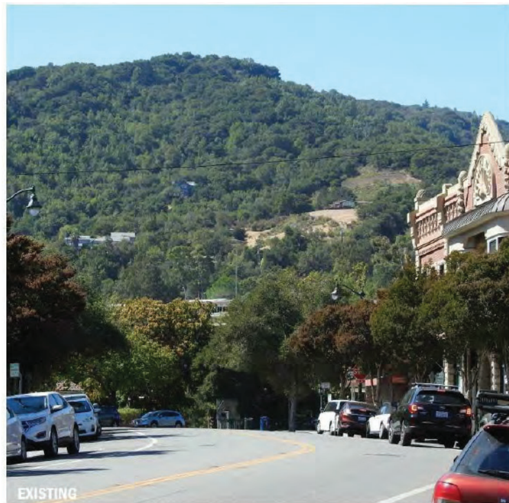
EXISTING (JULY 2021)