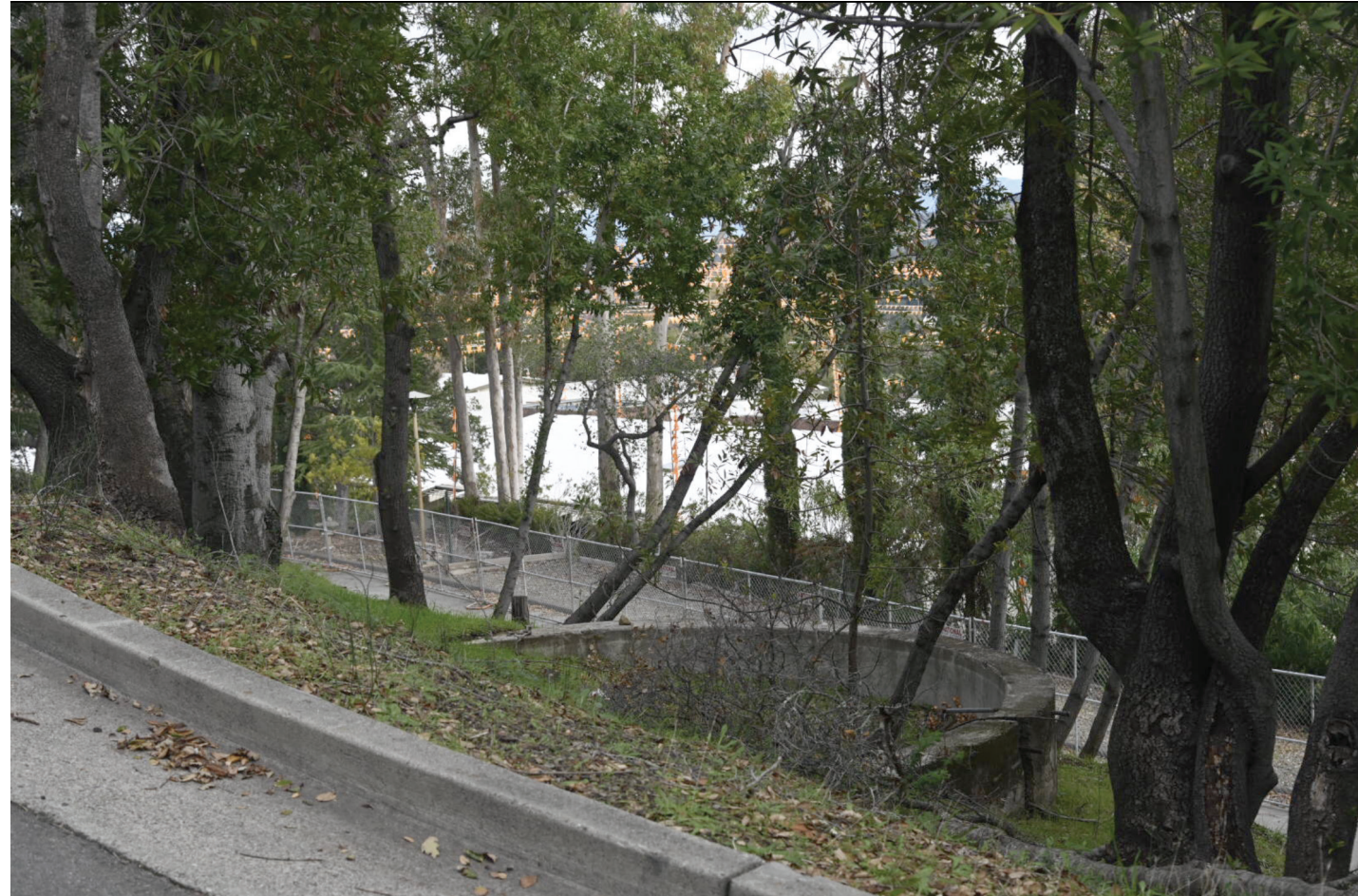
VIEW WITH STORY POLE (DECEMBER 2021)