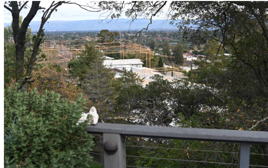
VIEW WITH STORY POLE (DECEMBER 2021)