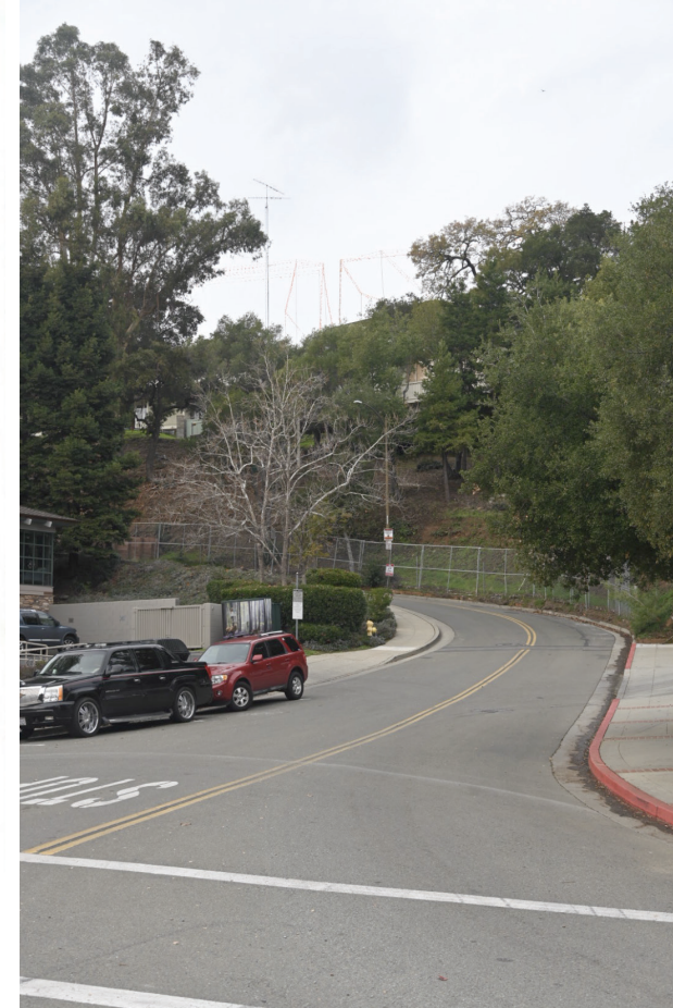
VIEW WITH STORY POLE (DECEMBER 2021)