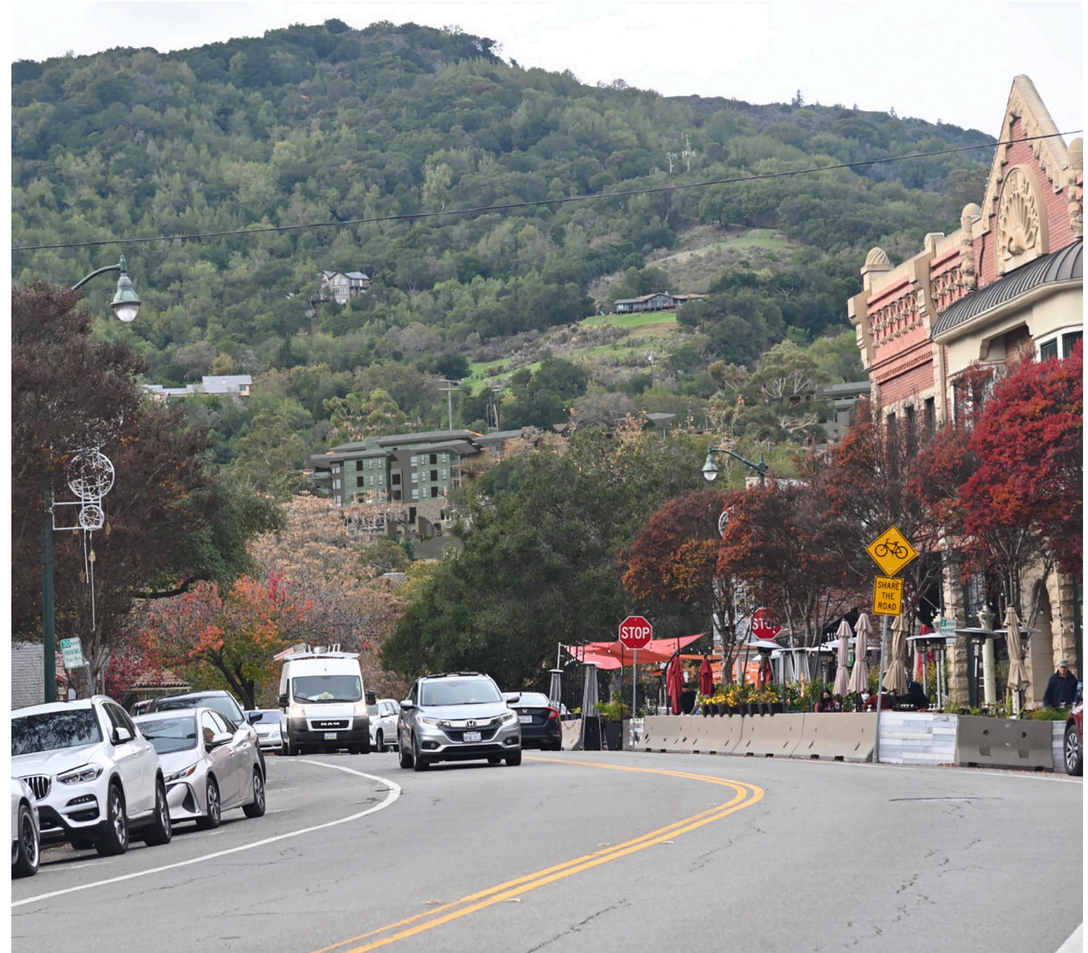
FINE TUNED ARCHITECTURE BASED ON STORY POLE LOCATIONS

LOS GATOS MEADOWS - PHOTOSIMULATION BEFORE AND AFTER JANUARY 2022