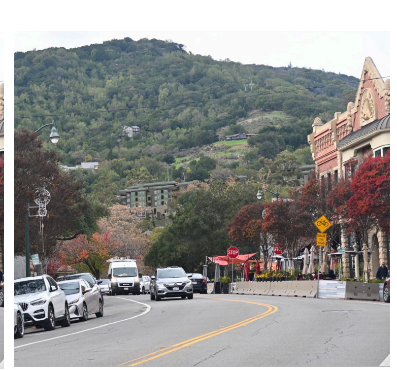
FINE TUNED ARCHITECTURE BASED ON STORY POLE LOCATIONS (JANUARY 2022)