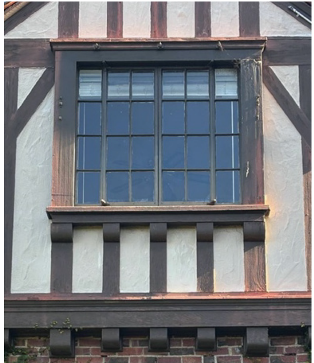
Fig.12 – Casements with side lights and transom window at front