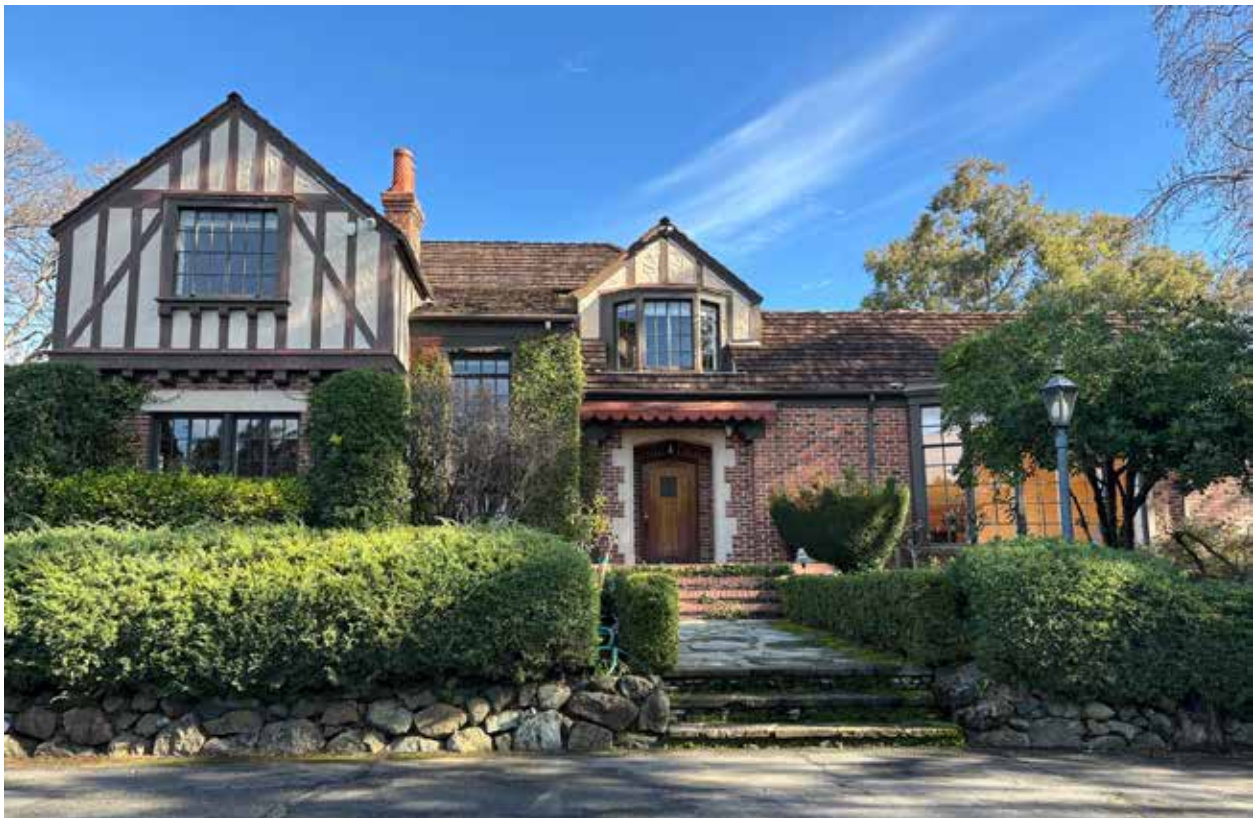
Fig.2 – 17121 Wild Way - Front view from on site (west)