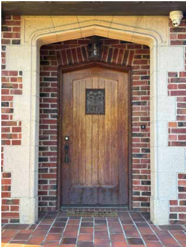
Fig.8 – Front (north) door