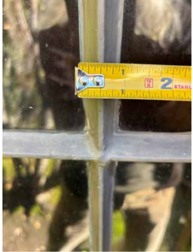
Fig.7 – Typical window muntin