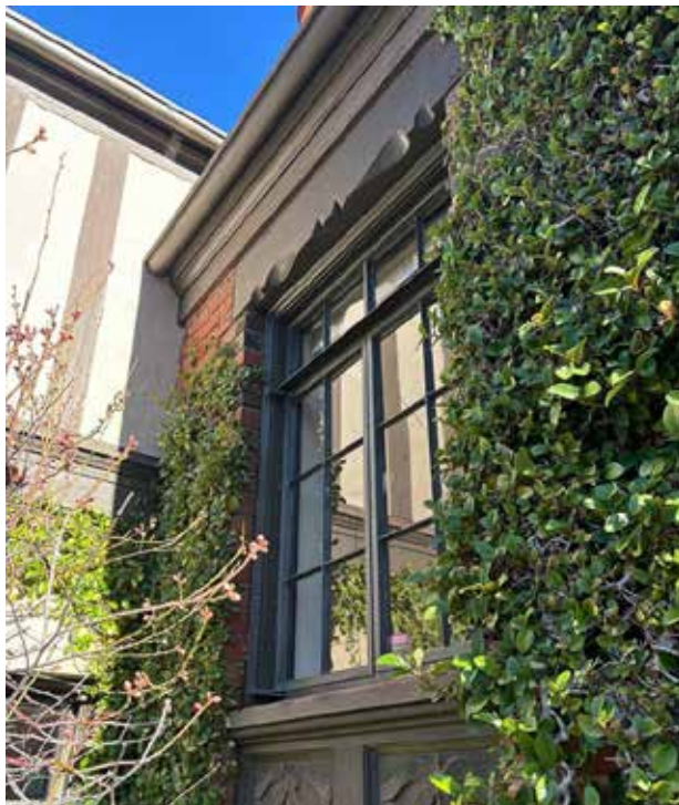
Fig.11 – Casements with transom window at front