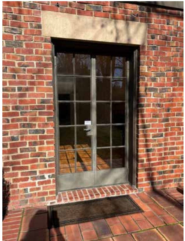
Fig.9 – Living room (south) doors - steel