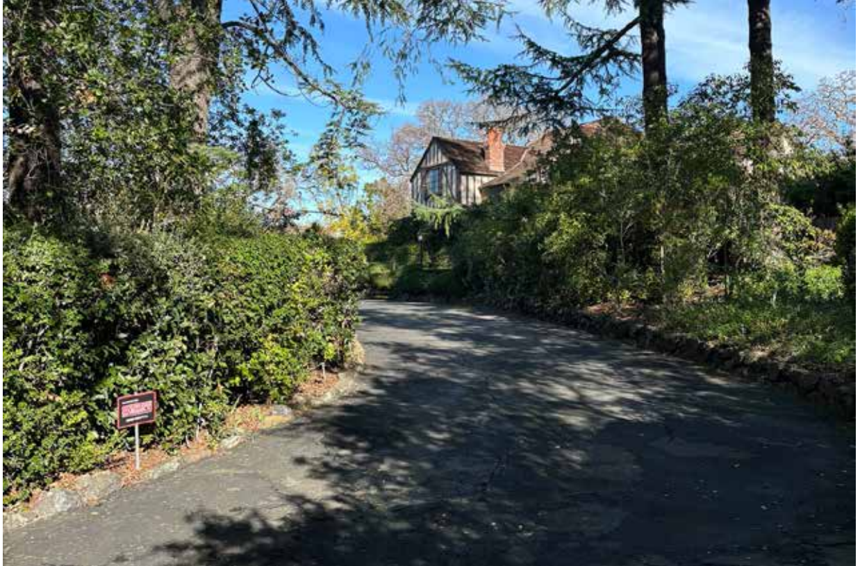
Fig.1 – 17121 Wild Way - View from Wild Way (south) drive