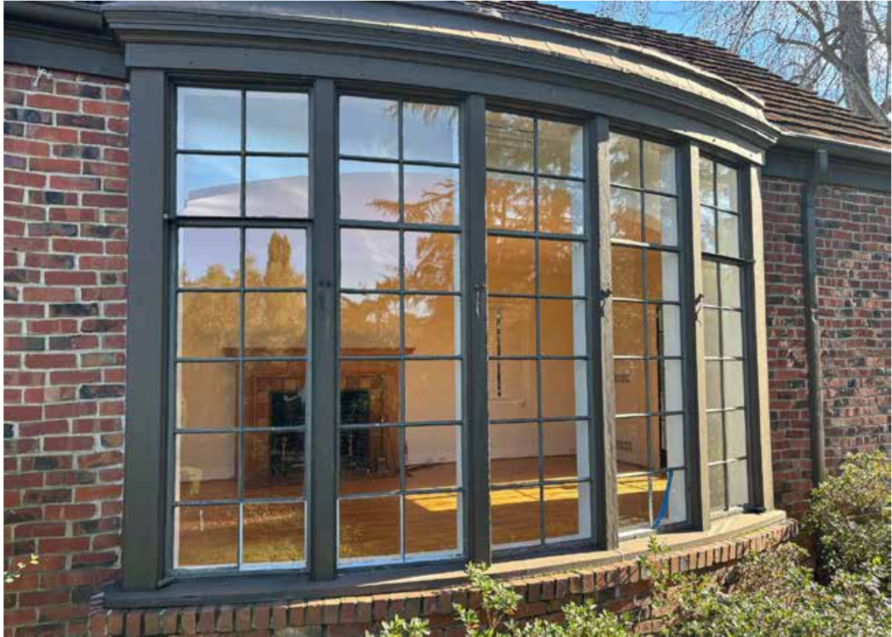
Fig.10 – Living room bay window