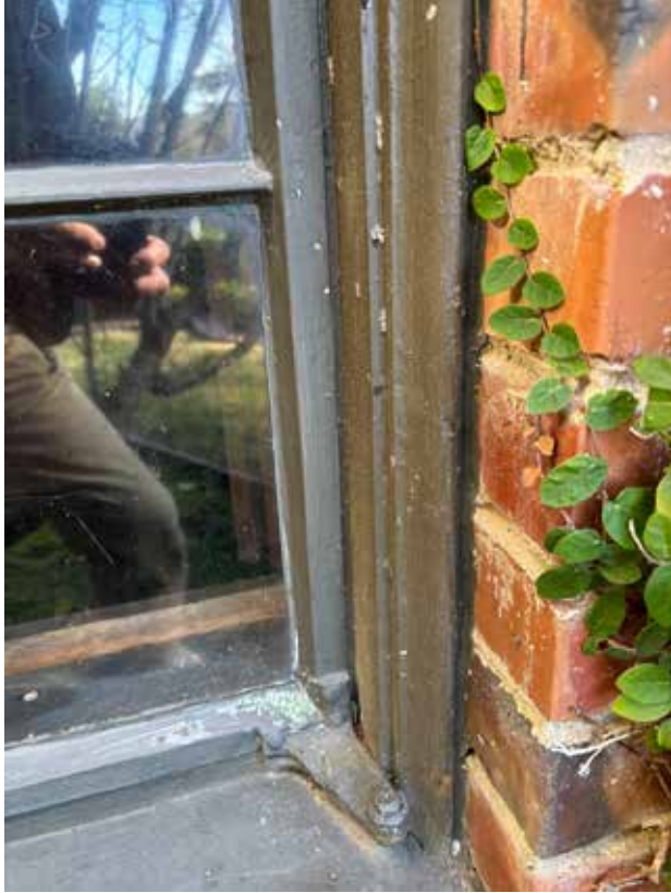
Fig.6 – Typical window casing