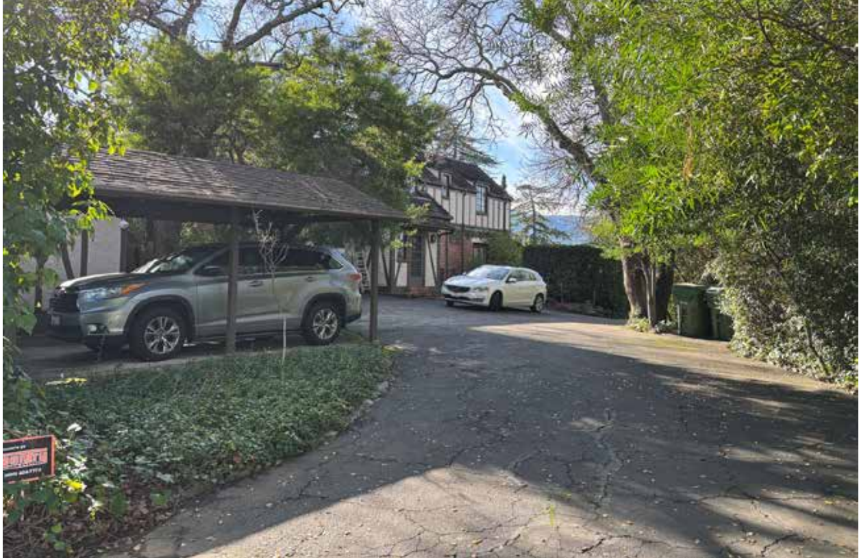
Fig.3 – 17121 Wild Way - View from Summit Way (north) drive