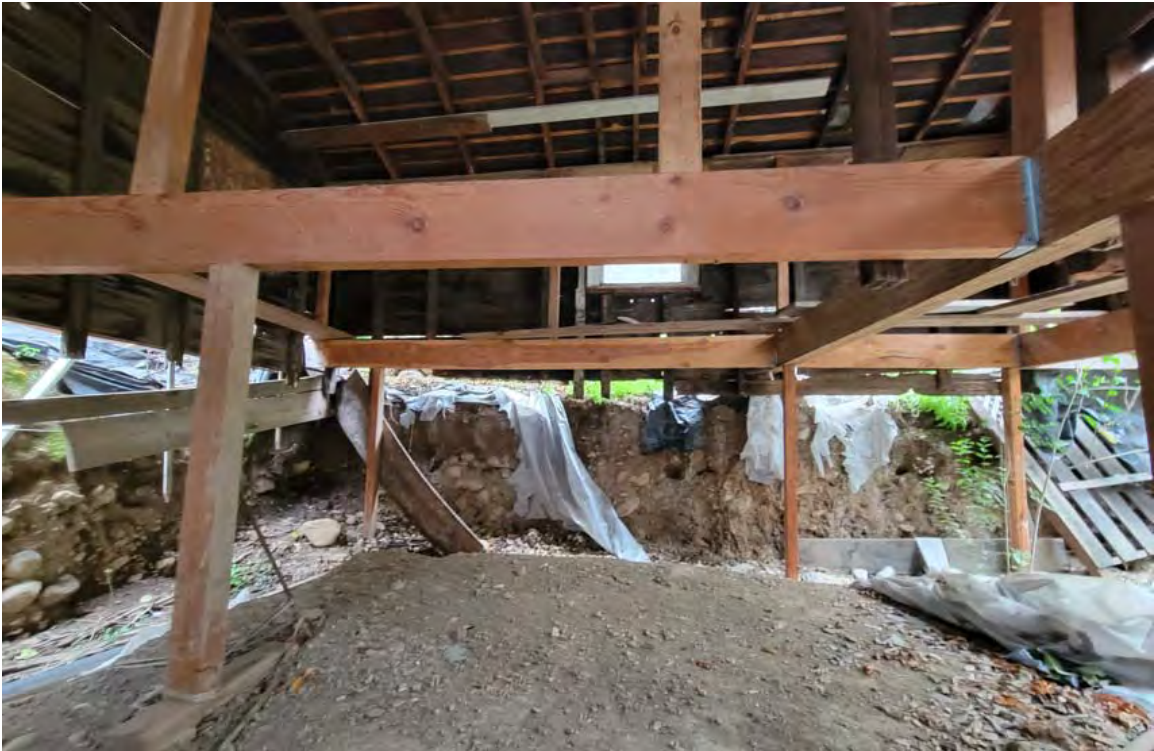
Inside View - Looking East