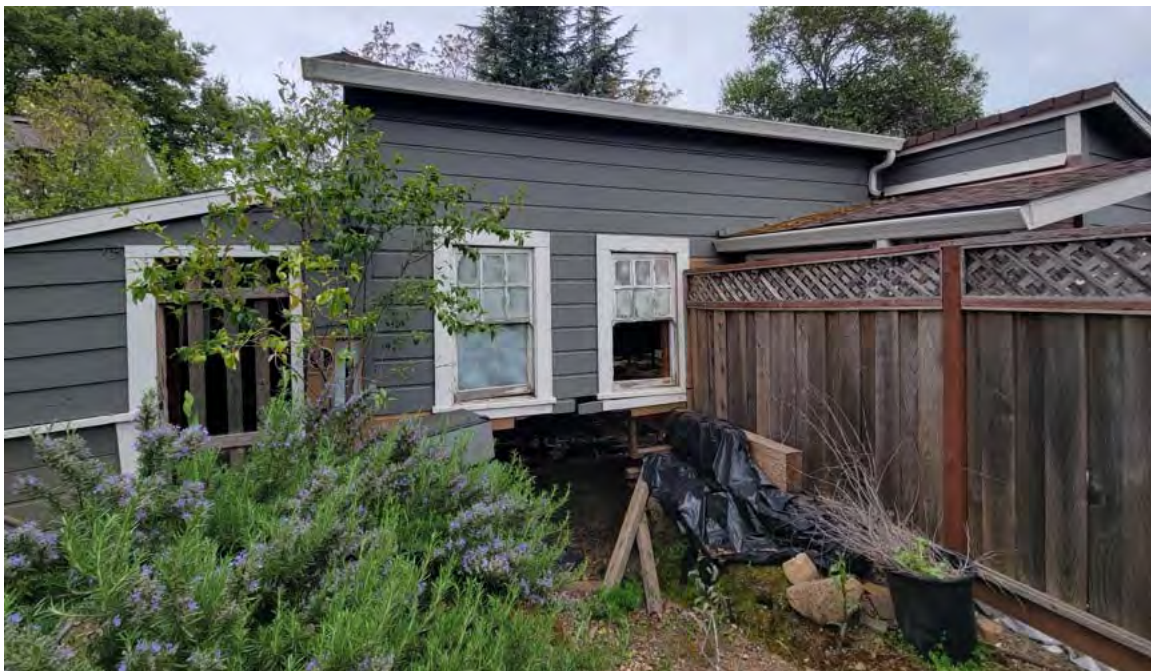
Exterior View - South Side