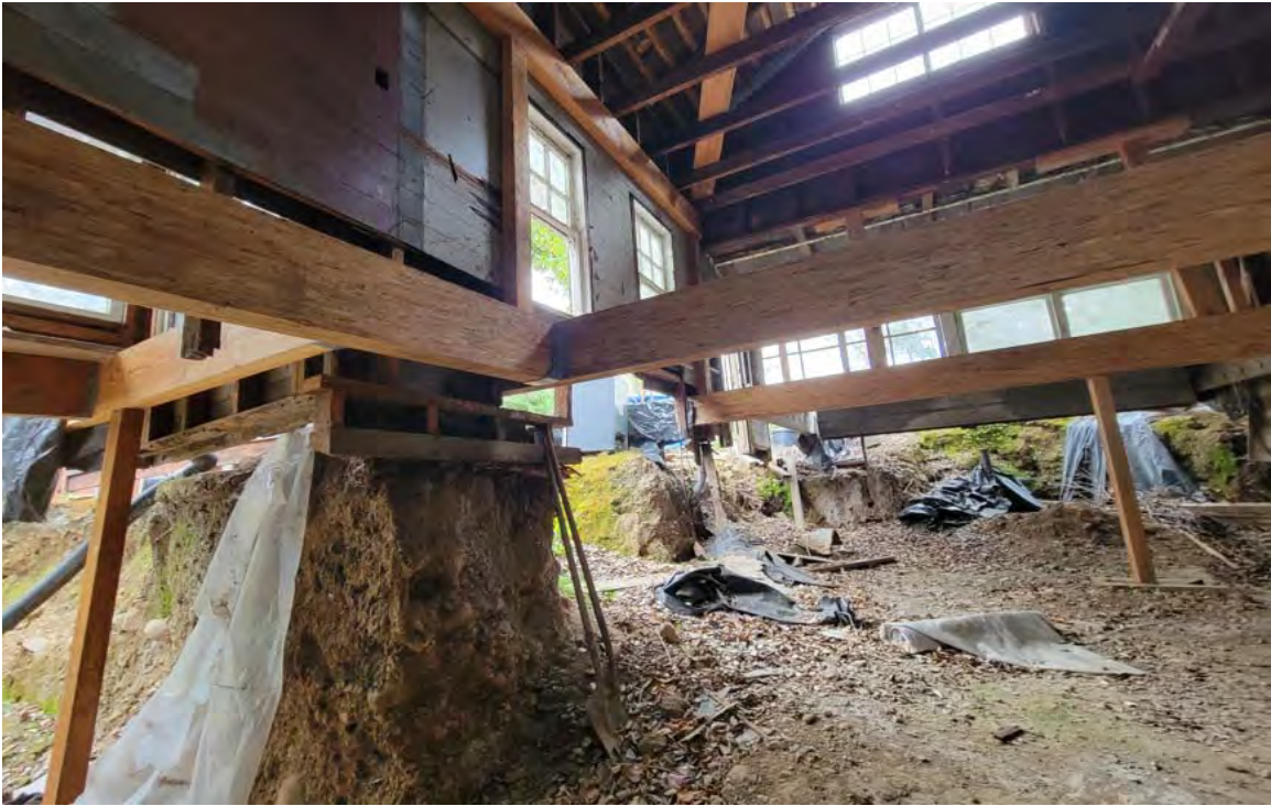
Inside View looking – South/West