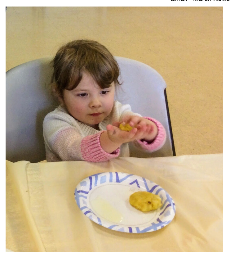
7. Ymm... relishing Aloo Tikkis and Mango Lassi