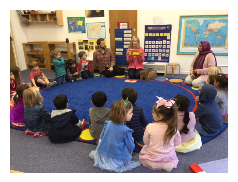
Presentation of flags from Asian countries: