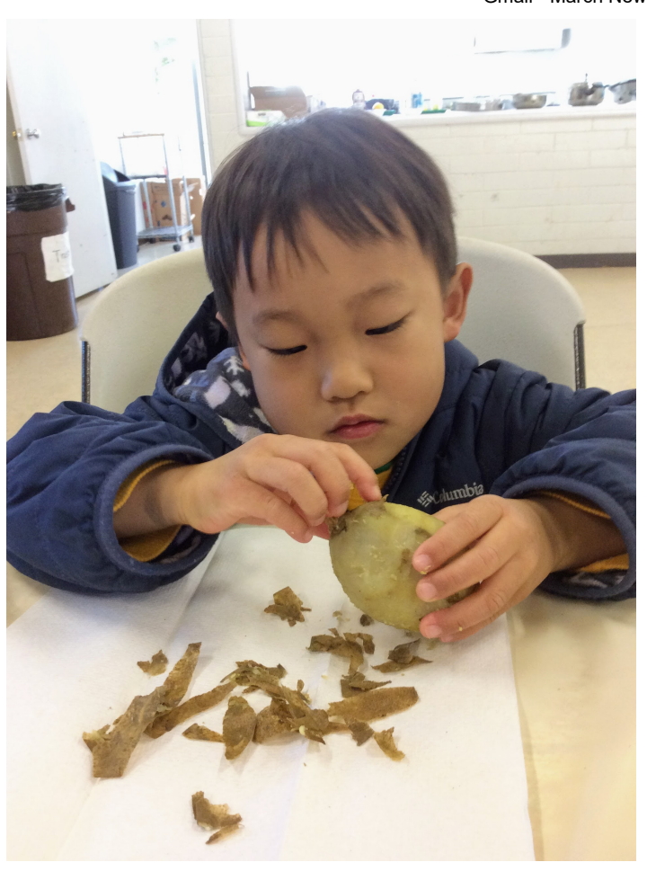
4. Mashing potatoes