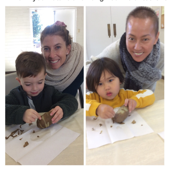
3. Peeling potatoes...