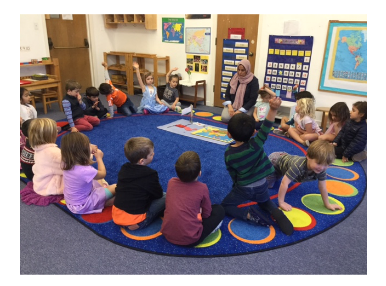
Peace table always works: