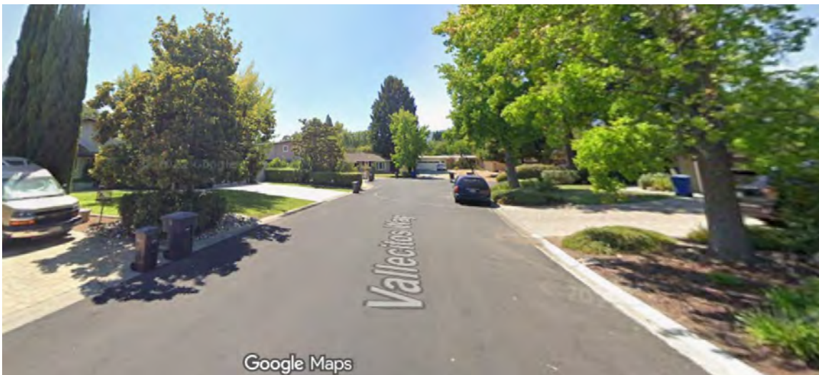
Additional views of 3d below