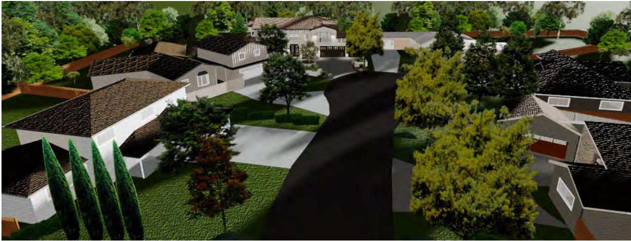
Aerial Survey of 2 story homes around subject home