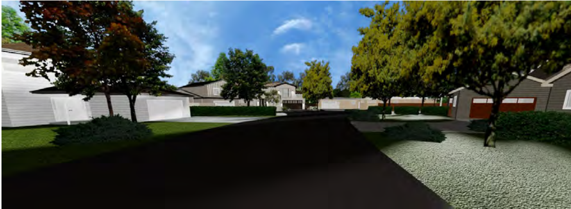
3d view of neighborhood compared to google view below of current neighborhood