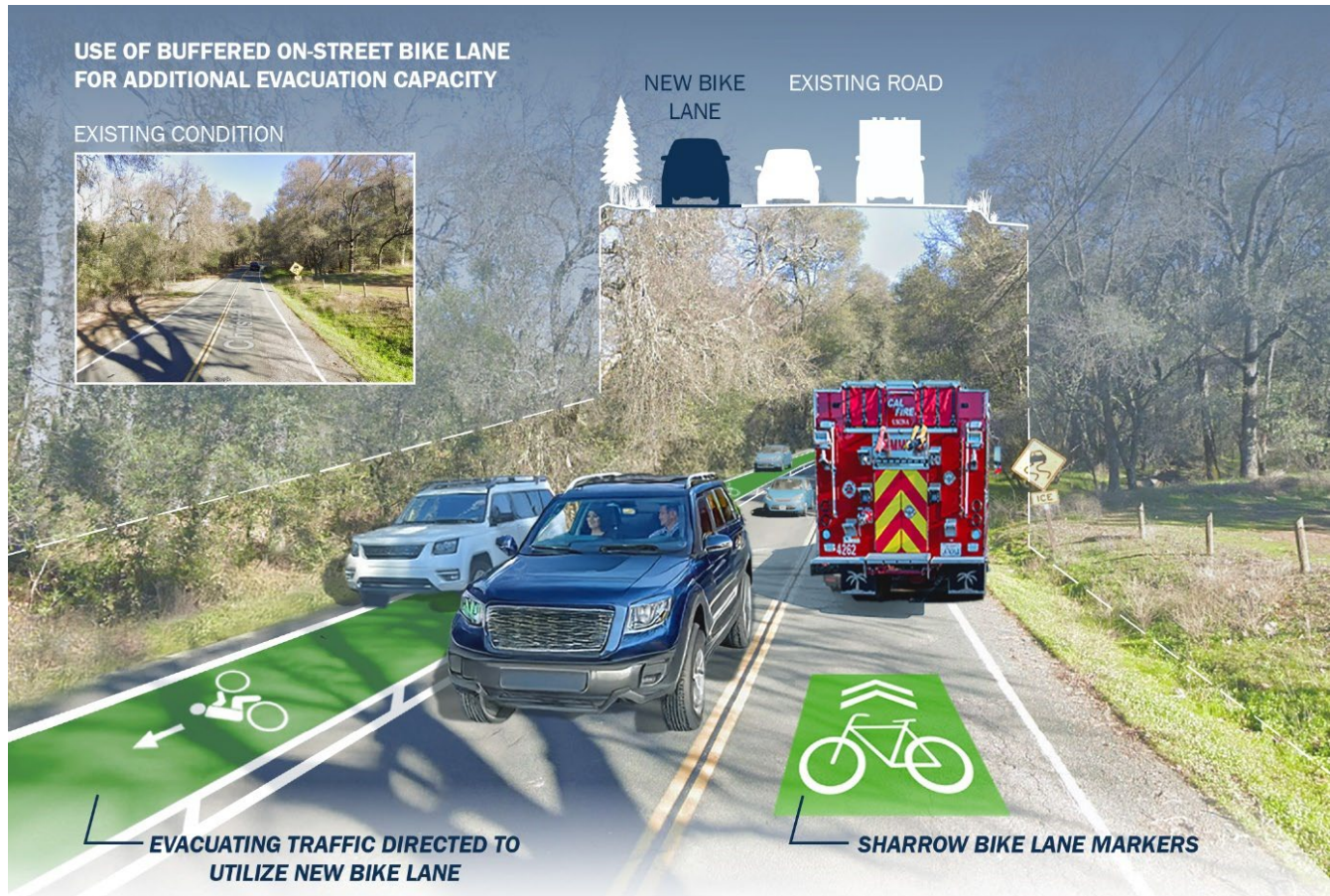
Figure 2. Road Widening Strategies

To further strengthen emergency response capabilities, in coordination with key Town departments, including and not limited to, law enforcement, fire, parks and public works and utilizing findings from the evacuation simulation and fire progression modeling from Task 4, Task 5 will identify evacuation trigger points and zone-specific phase evacuation strategies for a wildfire evacuation event, to improve overall evacuation safety. As part of this coordination, Dudek-CRA will define primary and secondary evacuation routes, traffic control points, Temporary Evacuation Points (TEPs), and staging areas.