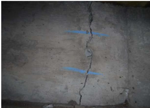
Innova inspection showing foundation cracking