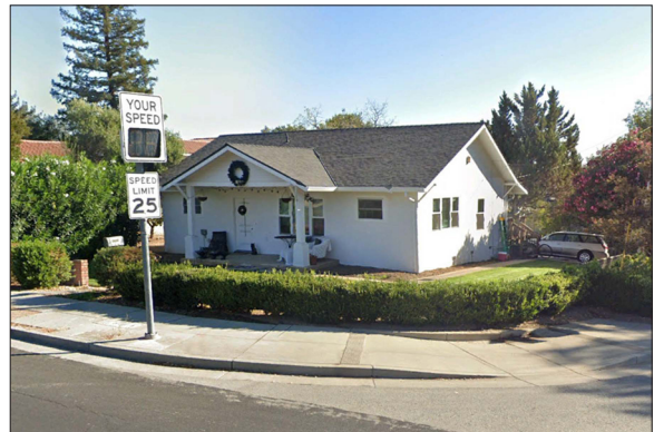
Structure across Shelburne Way from site