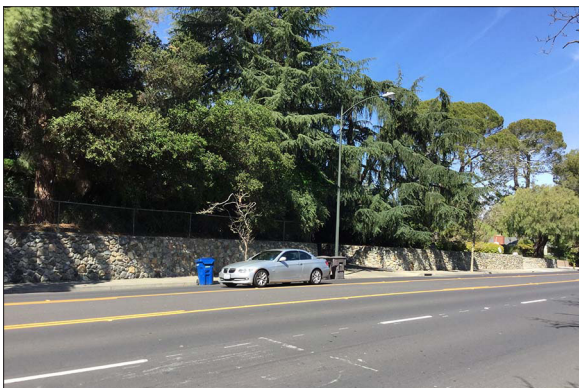
View across Winchester Blvd.