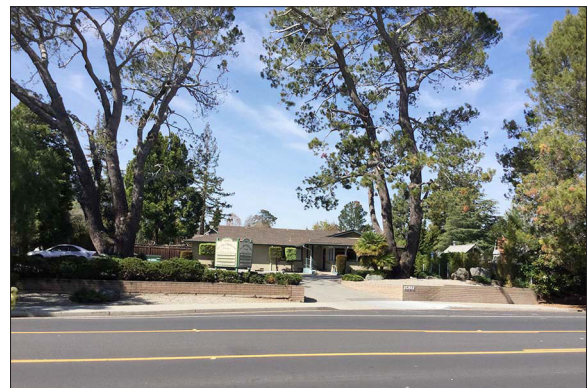
View across Winchester Blvd.