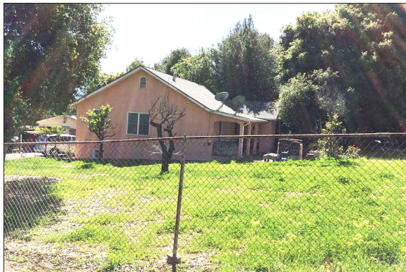
View to the site from corner