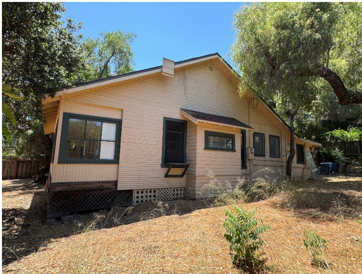
651 N. Santa Cruz Ave. View: North facade with shed pop out. Note the additions on the left and right sides of the building.