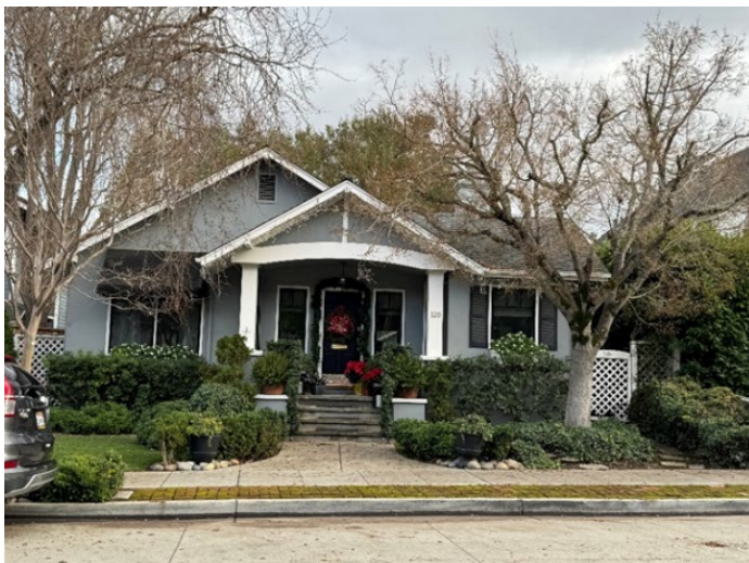
120 Massol Avenue Double-gable Style; constructed 1920