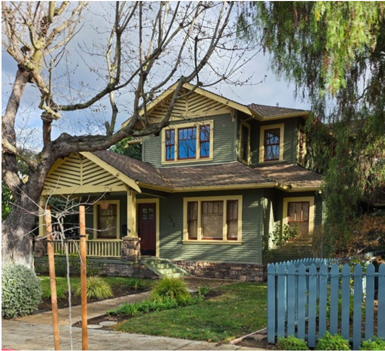
147 Tate two-story double and cross gable house. constructed 1923