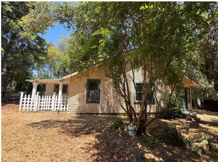
651 N. Santa Cruz Ave. View: South Facde . Note additions and alterations on both sides of the facade