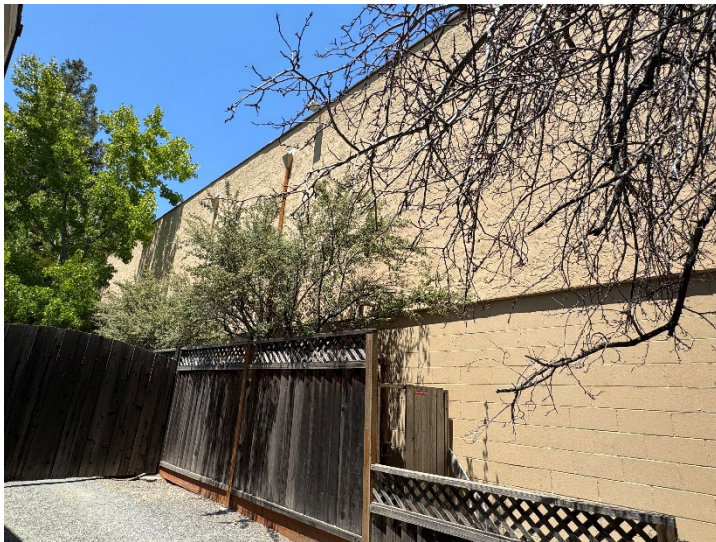
647 N. Santa Cruz Ave. 1979 Office Building The fence is separating the two buildings.