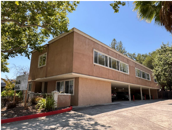
847 N. Santa Cruz Ave View: Fence and gate from the house side.