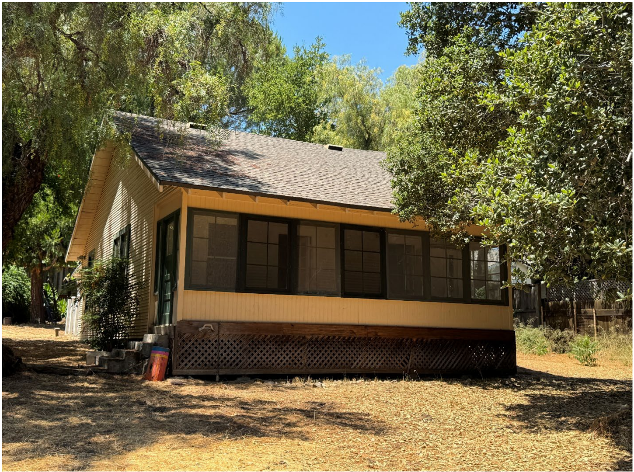
651 N. Santa Cruz Ave. East façade. Note the addition of a wall enclosing the open porch.. Entrance is on the left side.