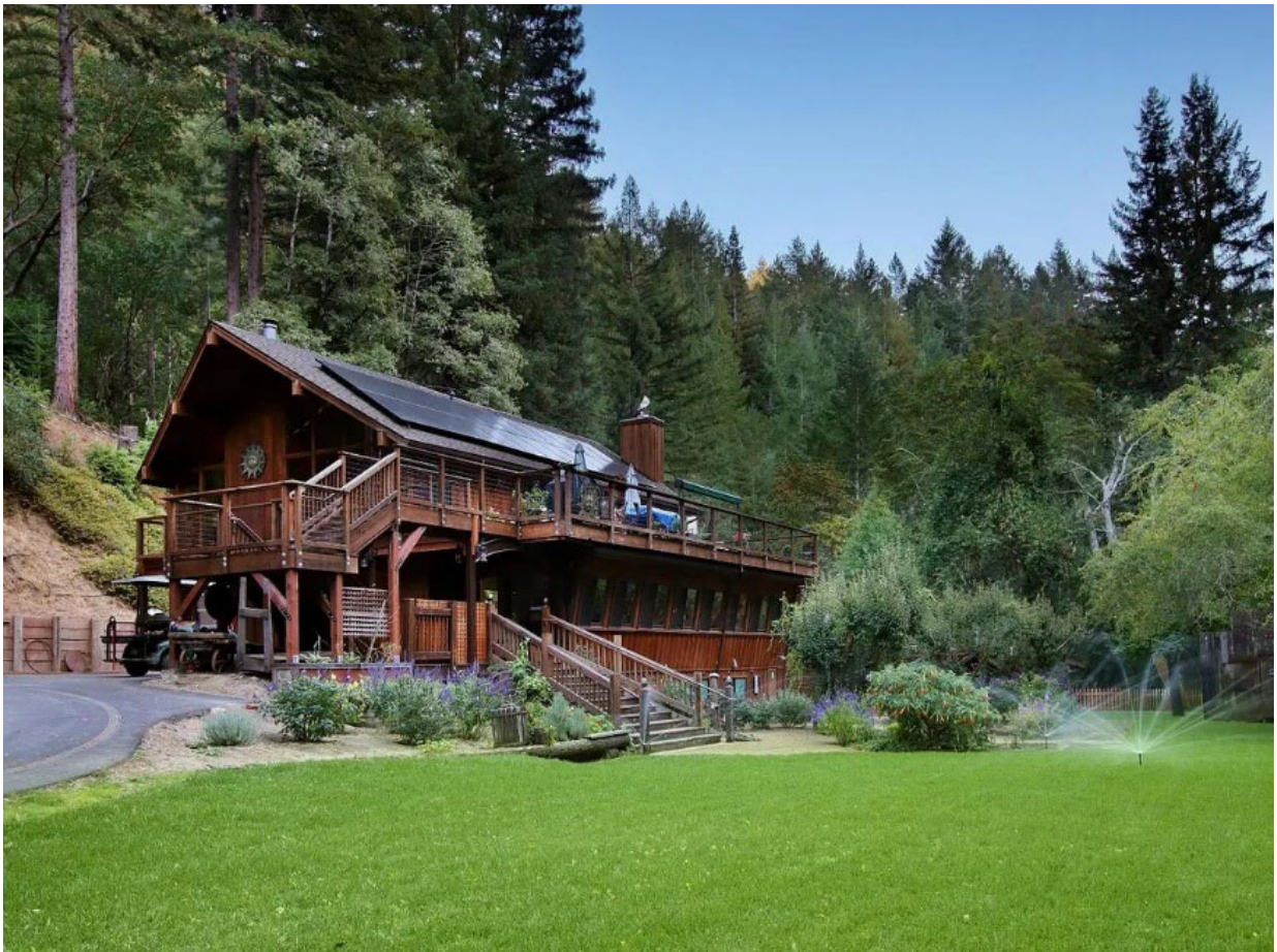
16770 Redwood Lodge Rd, Los Gatos, CA 95033 Rustic, cabin style Craftsman Constructed in 1927;