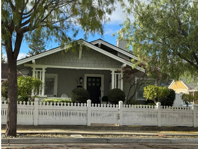
155 Tate Avenue. Double-gable (wide porch) Craftsman constructed 1918

The 40-acre subdivision, the first in Los Gatos after incorporation, features primarily Victorian-era homes with 78 built before 1895. The district's final development phase (1917–1930) added 30 mainly Craftsman-style homes. Below are examples of Craftsman variations in the area.