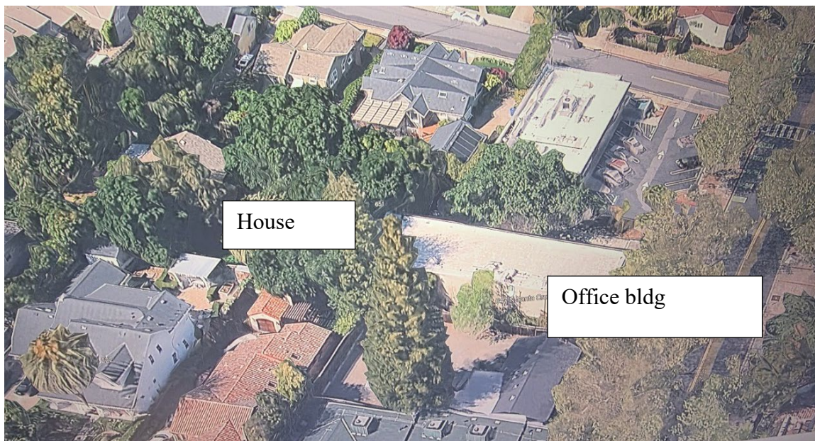
Aerial location map - The house is not visible from N. Santa Cruz Ave