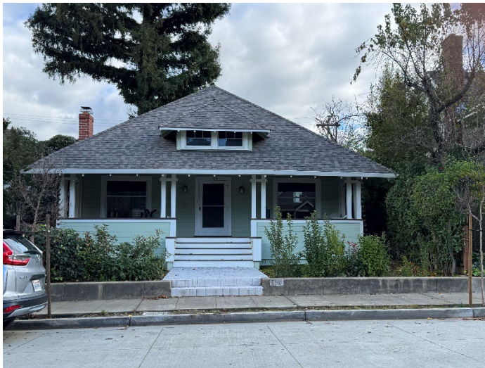
150 Wilder Avenue Early Craftsman Style with hipped roof, full width porch, constructed 1905