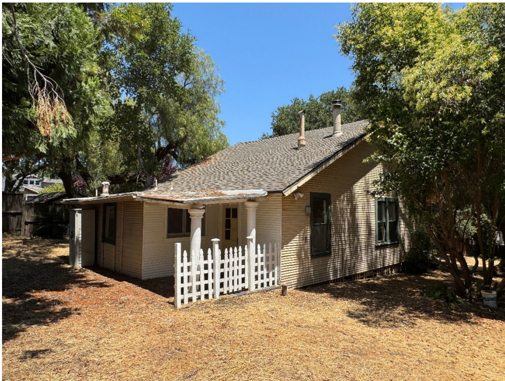
651 N. Santa Cruz Ave. View: West facade Note extensive alterations extending the roof to cover additions, and with Neo-classic architectural columns from other eras that remove the Craftsman style character.

The Los Gatos Historic Preservation Ordinance Sec. 29.80.215. states in the purpose that historic resources must be of "special character" and exhibit qualities that are very similar to the 4 criteria of the California Register of Historical Resources.