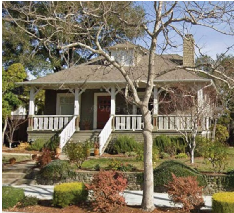
16 Bayview Avenue