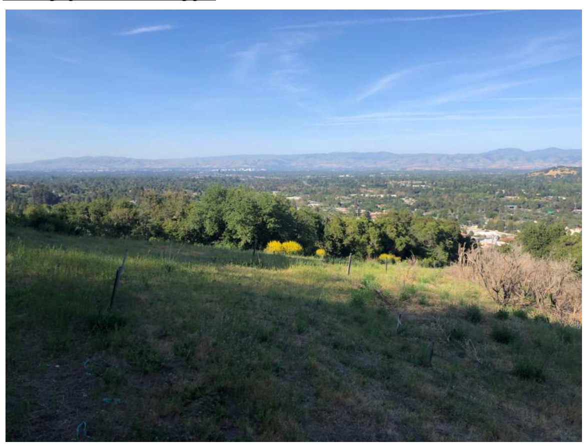
Looking down towards building pad (road cut on the right)