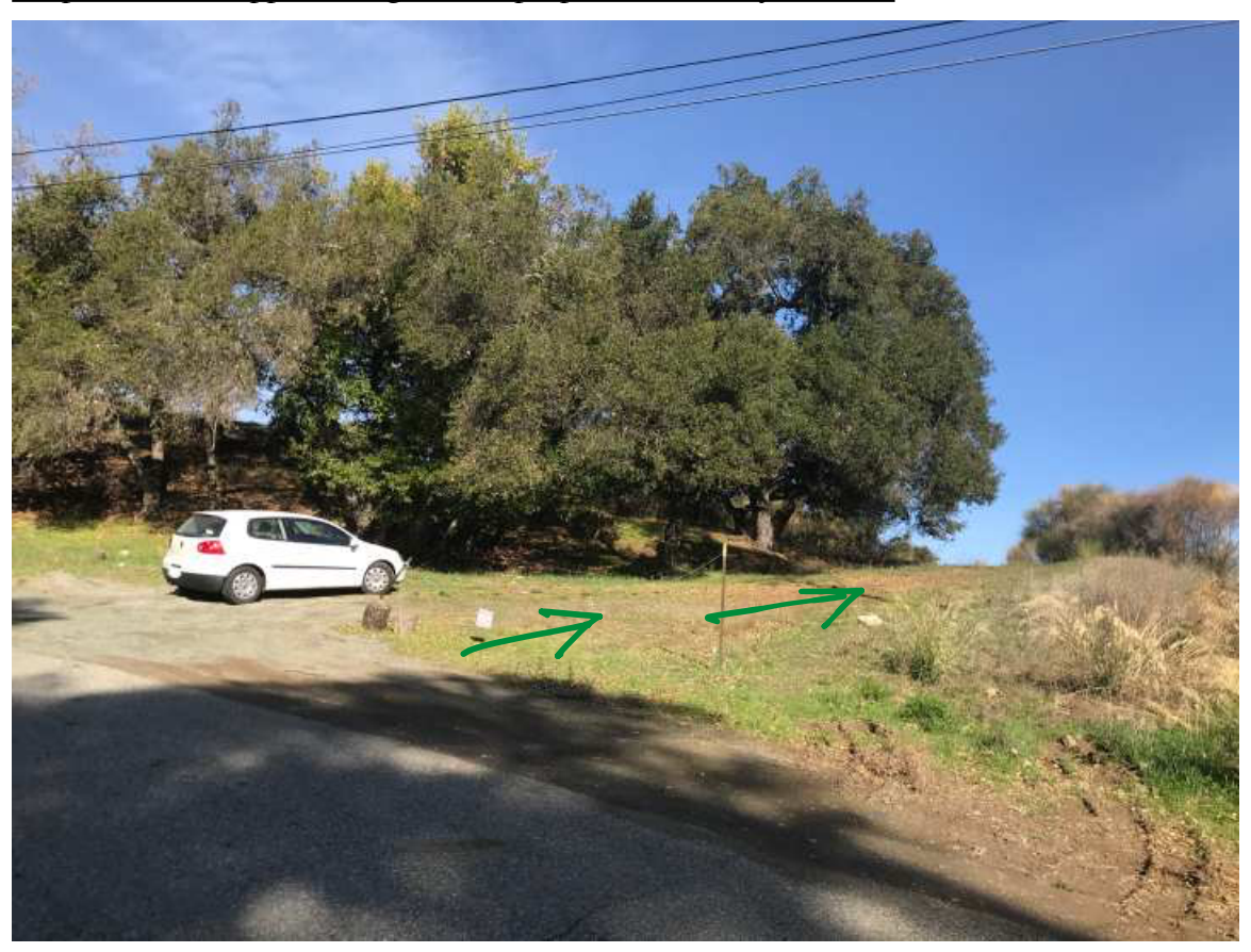
Proposed driveway entrance (going around existing oak grove)