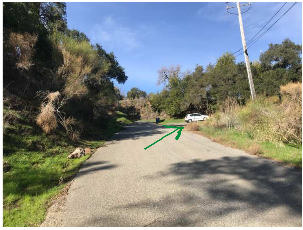
On private road approaching lot and proposed driveway location