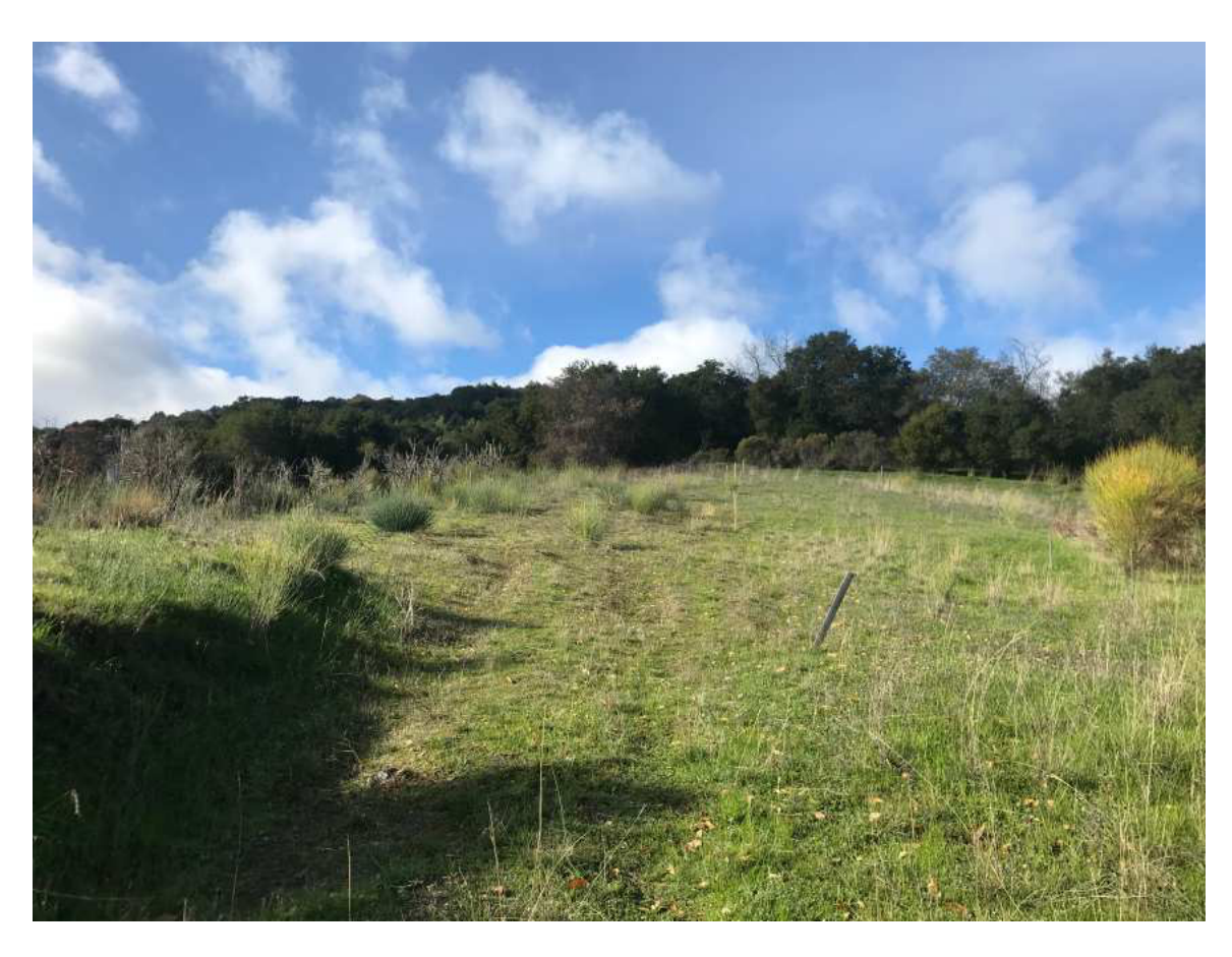
Looking up towards building pad