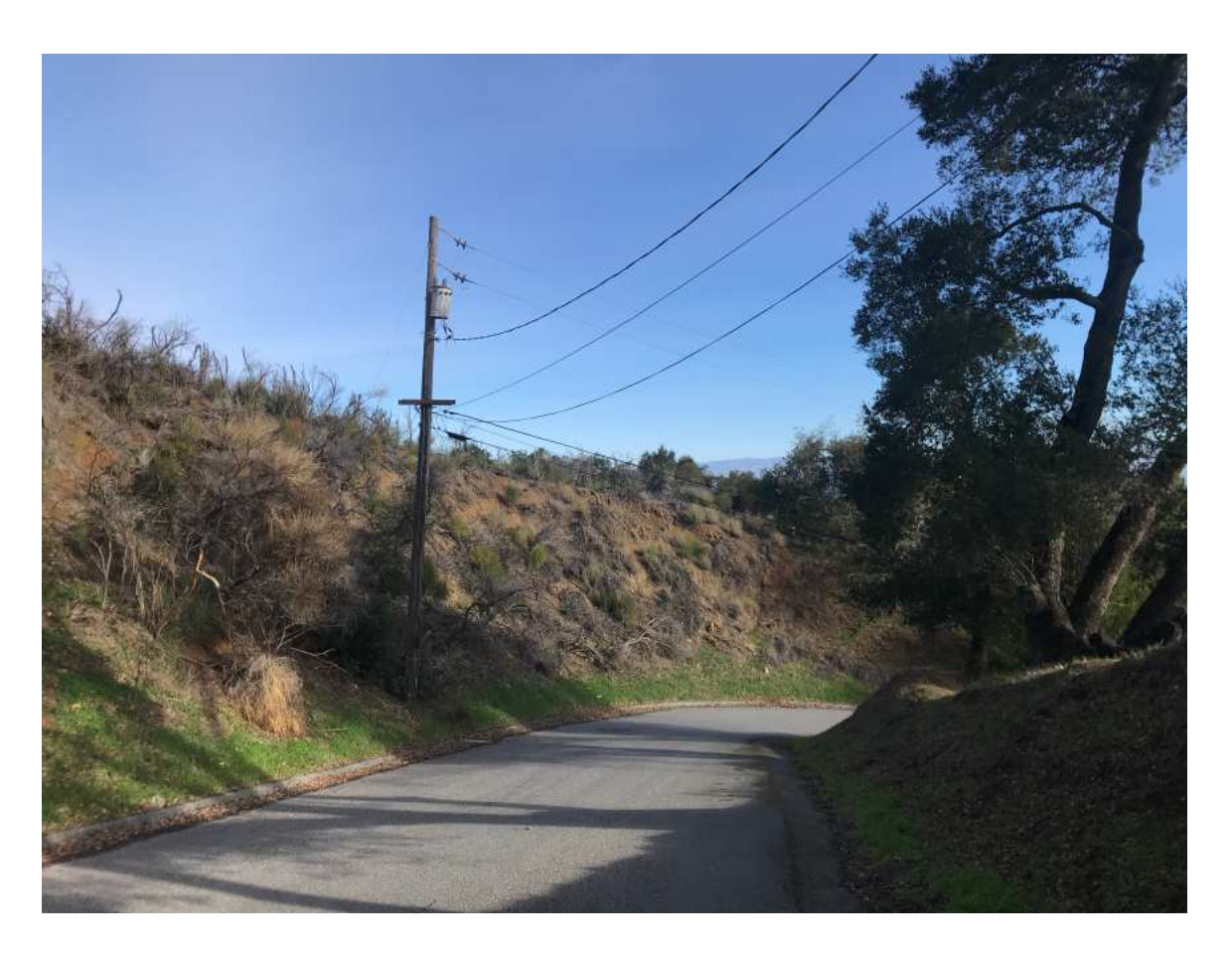
On private road looking at subject property (area of road cut mentioned in letter)