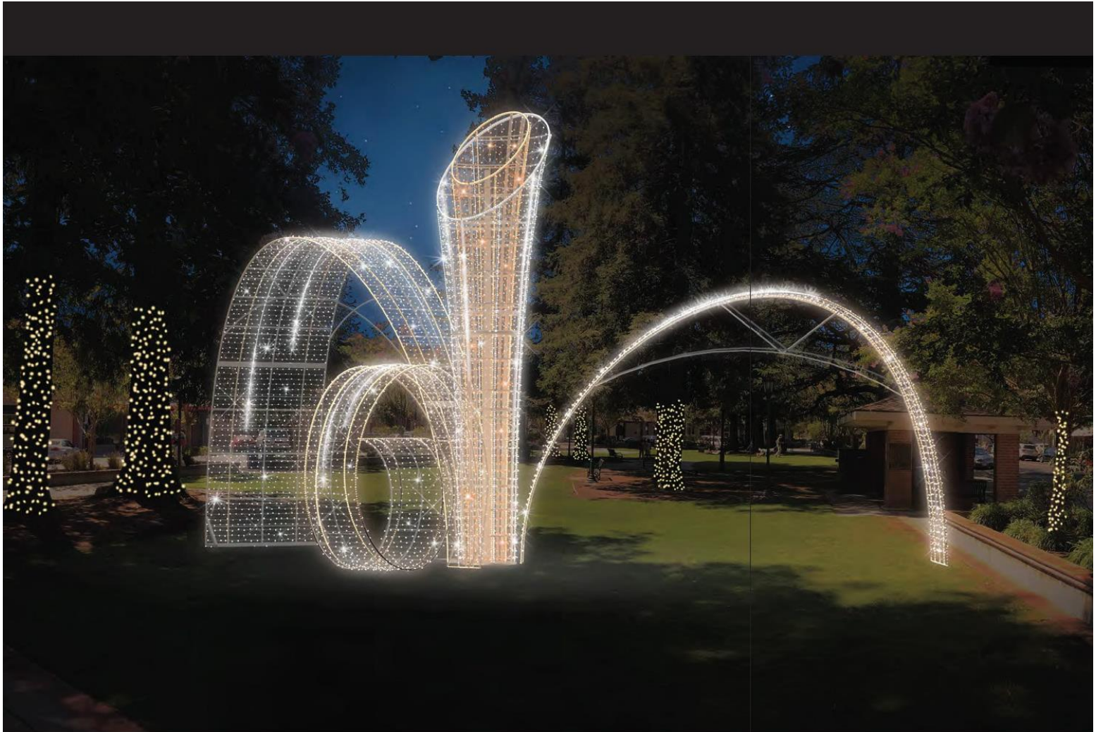
Town Plaza - 202711 Animated Sylma with warm white lights on trunks