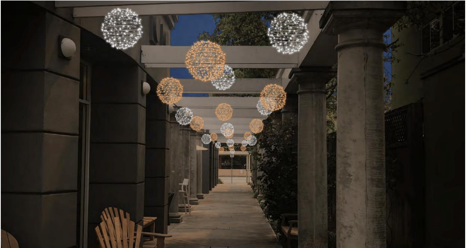
Terra Patio Alley version 2 - 3D 24inch Spheres in warm and pure