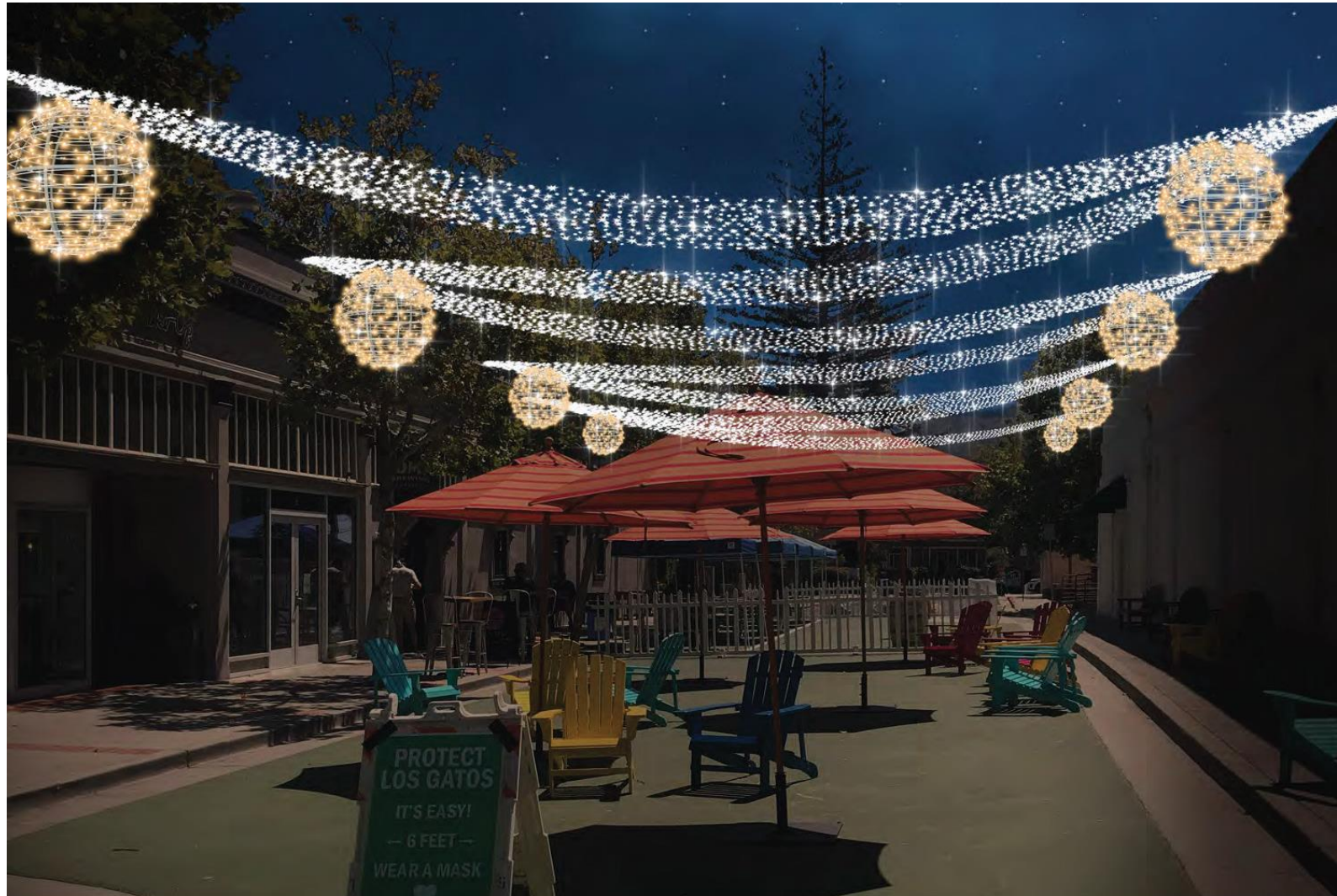
Suspended Mini lights in pure and suspended 3D spheres