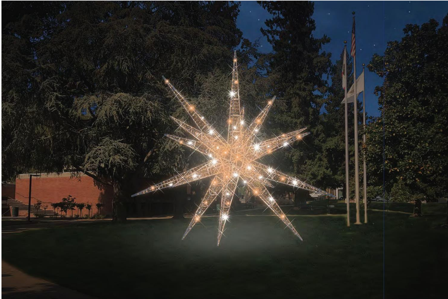
Civic Center - 409131 3D Starburst